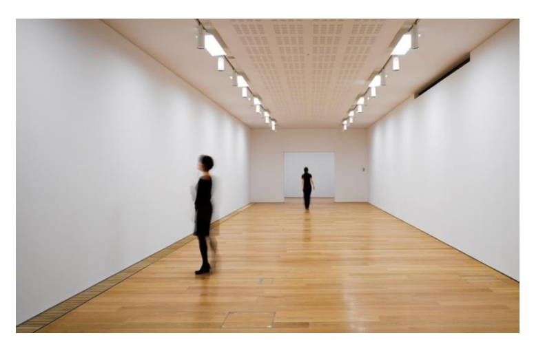
Municipal Gallery & Project Room, dlr LexIcon