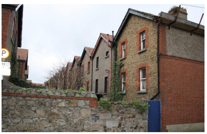
Rear No.17 Seafort Parade

The sash windows in Nos. 4 to 17 Seafield Parade are divided into four smaller panes in the upper sashes on the front elevation. The lower sashes have a larger, single pane of glass. The use of this glazing pattern in 1905, was a deliberate design feature, possibly indicating some Arts and Crafts movement influence. From the first half of the nineteenth century, much larger sheets of glass had become available, leading to the use of bigger window panes and dispensing with the small panes more typical of the Georgian era. The robust detailing around the doorways of Nos. 4 to 17 Seafort Parade also shows a strong influence from the Arts and Crafts movement.