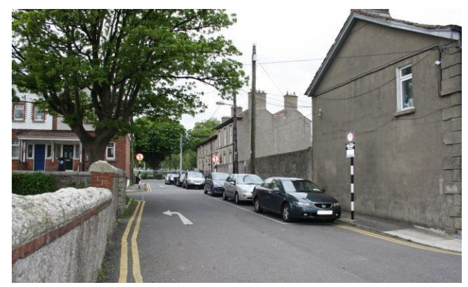
View to Rock Road