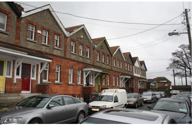
Parking and wirescape