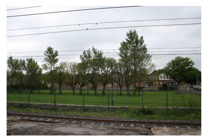
View of Seafort Parade from seashore

There are only limited vistas into and out of the area of the ACA from Rock Road.