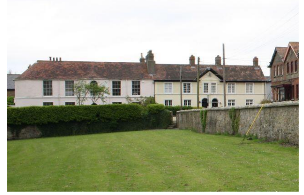
Nos. 18-20 Seafort Parade

The Martello Tower is the most significant structure of architectural heritage value on Seafort Parade. It dates from 1805, and originally stood on the foreshore. Located between the Tower and Nos. 1 to 3 Seafort Parade, stands Martello Terrace, dating from the first years of the twentieth century. Nos. 1 to 3 Seafort Parade are five modest two storey houses, with clay tile roofs.