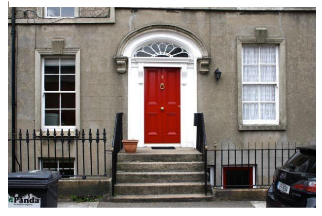
Entrance No.3 Seafort Parade