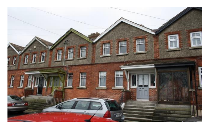
Central part of terrace