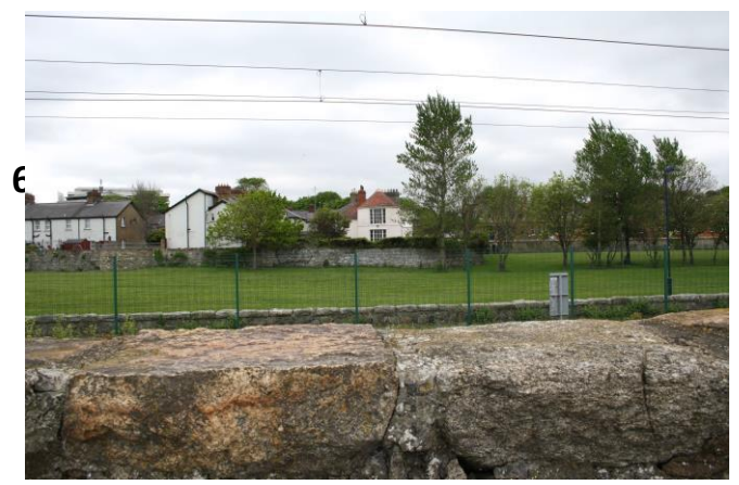
Park and No.18 Seafort Parade with Emmet Square to left side.