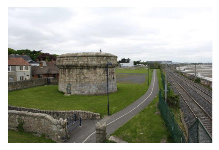
Martello Tower and park

There is one large maple tree opposite No. 4 Seafort Parade, which is a prominent feature of the area. On the linear parkland, there are other trees. The shoreline and sea, which lie outside the ACA, constitute the other main natural feature of the general area.