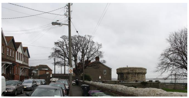
View to Martello Tower from Seafort Parade Nos 4-17

There is no good quality street furniture and traffic control signs proliferate along Seafort Parade. Pavements are concrete. Overhead wires proliferate to the front of the main terrace.