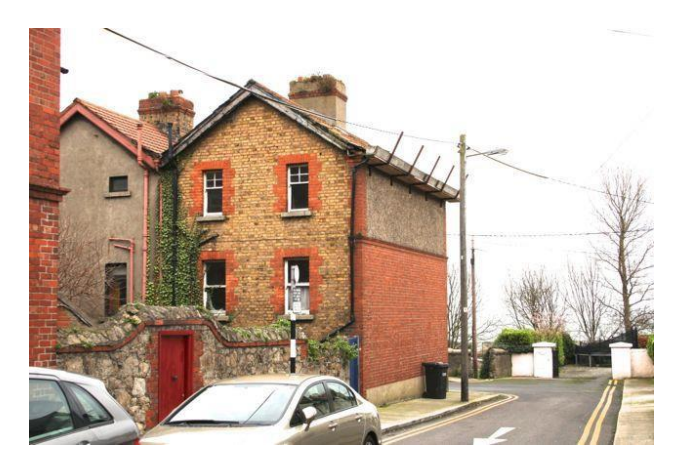
Rear No.17 Seafort Parade

Nos. 1 to 3 Seafort Parade also underwent some modification (Thom's Directory records rebuilding in progress to Nos. 2 and 3 in 1903, as also to Nos. 1 to 11 in 1905). The houses are all two-storey over basement, of modified Georgian style. Roofs are covered in clay tile of relatively modern origin, possibly replacing an original slated finish. No. 3 has a double A roof with a central valley and Nos. 1 and 2 have a single span roof. Chimney stacks have a plain render finish. All three houses have a wet bast finish to the upper floor, with a smooth cementitious render to the lower levels, incised to resemble ashlar stonework.