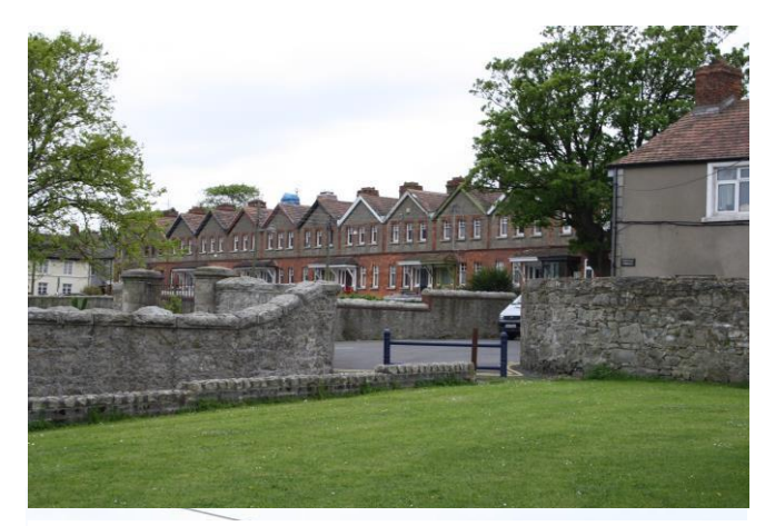
Nos. 4-17 Seafort Parade

The most prominent wall finish in the ACA, on the main terrace of houses (Nos. 4 to 17) is glazed red brick, laid in English bond. Brick is also employed around window openings, as a string course and as a form of quoin. A brick corbel is part of the support system for the canopy roof over the front doors. The use of a dash finish on the upper levels of Nos. 4 to 17 Seafort Parade contrasts strongly with the brick finish. The plaster finish to Nos. 18 to 20 Seafort Parade provides a visual counterpoint to the brick.