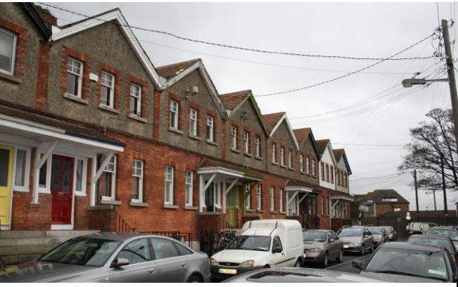
Wire-scape to front of terrace