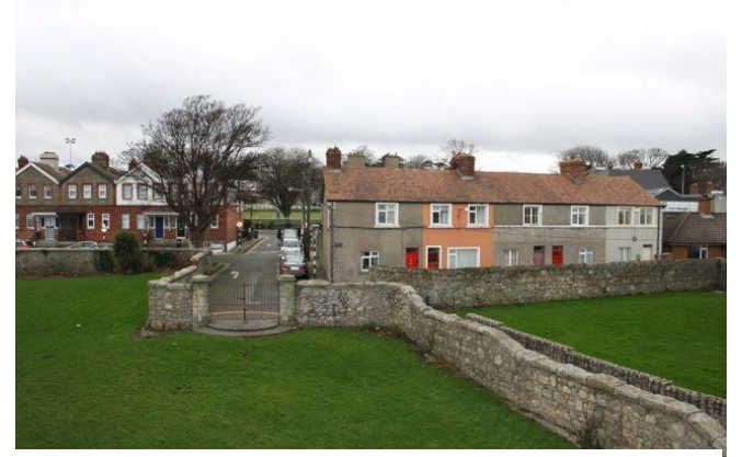
Granite walls to park boundary Martello