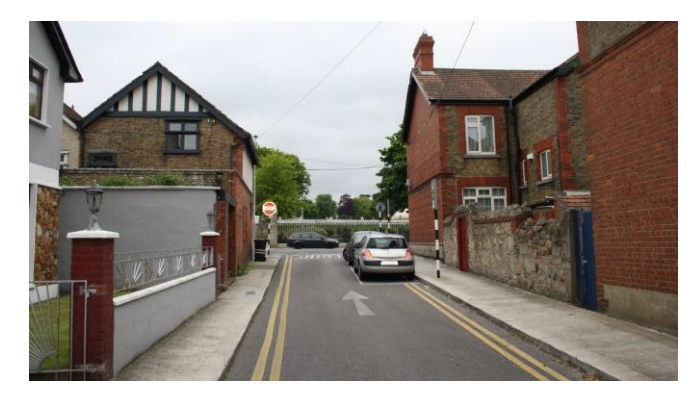
View to Rock Road