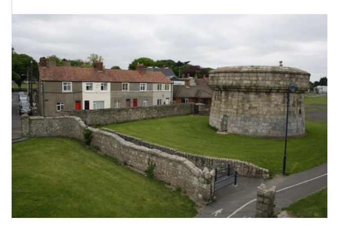
Martello Tower and Martello Terrace