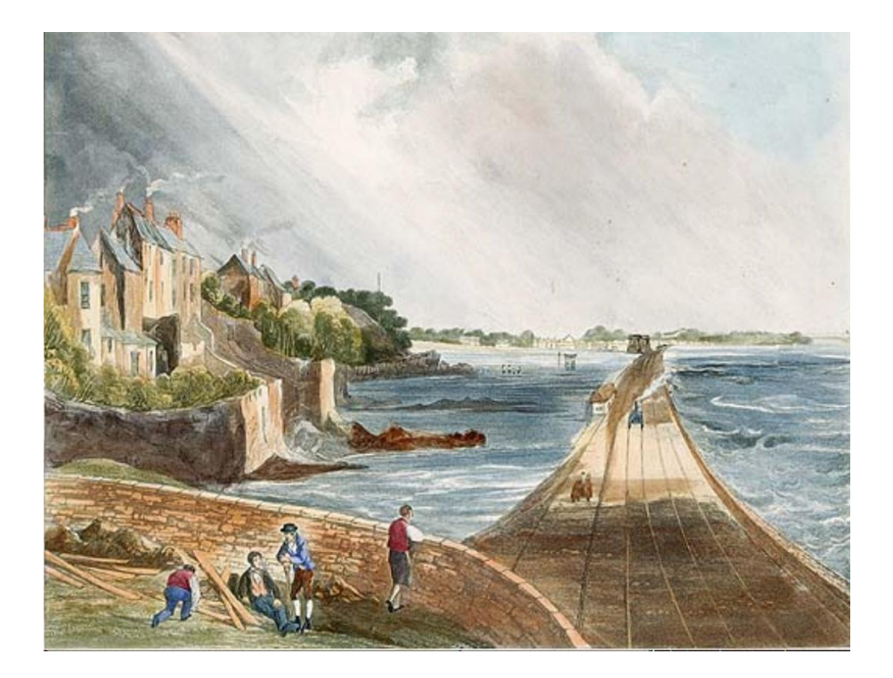
Illustration from 1834, showing Williamstown Martello Tower in middle distance, with railway under construction by J. Harris

With the exception of No. 21 Seafort Parade and Nos. 1 to 5 Martello Terrace, all buildings in the ACA are on the Record of Protected Structures. The central terrace, consisting of Nos. 4 to 17 Seafort Parade, forms the core of the ACA. The Martello Terrace houses, although modest, constitute a significant element in the setting of the Martello Tower. In terms of scale and finishes, these houses form a strong element in the overall Seafort Parade ACA.