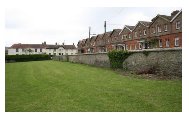
Main terrace Nos. 4-17 Seafort Parade(rhs) and Nos. 18-20 (lhs)

Seafort Parade is a heterogeneous development, carried out over more than a century, with its roots in the eighteenth century. The main group of buildings is the terrace containing Nos. 4 to 17 Seafort Parade. In its current form, this dates from the first years of the twentieth century, when Thom's Directory records Nos. 1 to 11 as re-building in 1905. Nos. 4 to 17 Seafort Parade are all to the same basic design, being two- storey over basement, gable fronted, with three bays. The roofs are simple 'A' type, running from front to rear, clad in flat terracotta tiles with lightly decorated barges. There is a roof valley running between each pair of houses. The chimney stacks are centrally placed, finished in a yellow 'Dolphin's Barn' brick, with glazed red brick stringcourse. The upper front facades are finished predominantly in a dashed render, with brick dressings to the window openings and brick quoins separating the individual houses. A moulded red brick string course separates the upper floor from the ground floor. The latter is finished in a red brick, laid in English bond. Basements are finished in a plain render, painted.