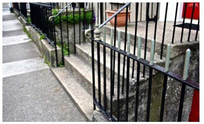
Entrance steps at No. 3 Seafort Parade