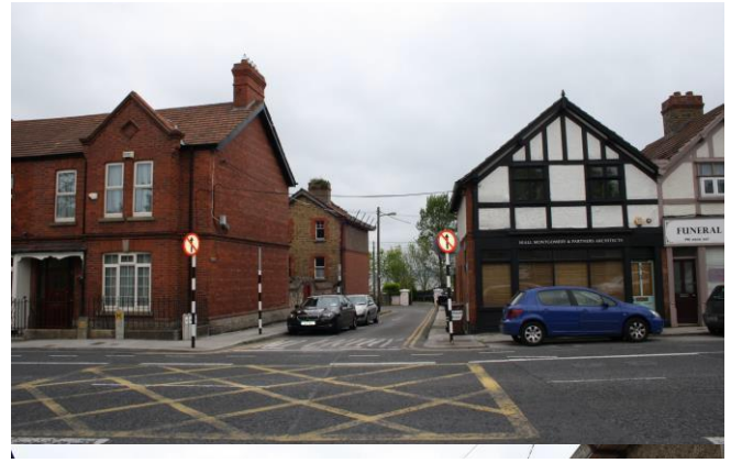
View from Rock Road