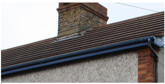
Chimney stack No. 4 Seafort Parade