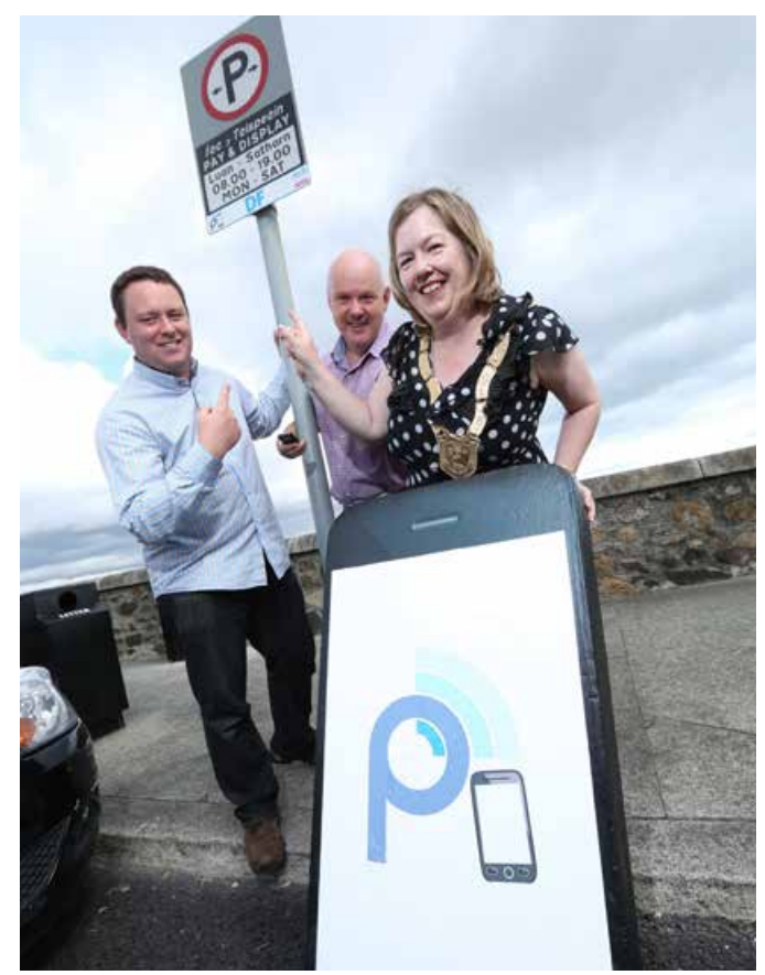
Above: Pay by Phone - Parking Tag System

Further rollout of the GIS computerised asset management system to manage activities of public lighting maintenance from fault reporting all the way through to invoicing.