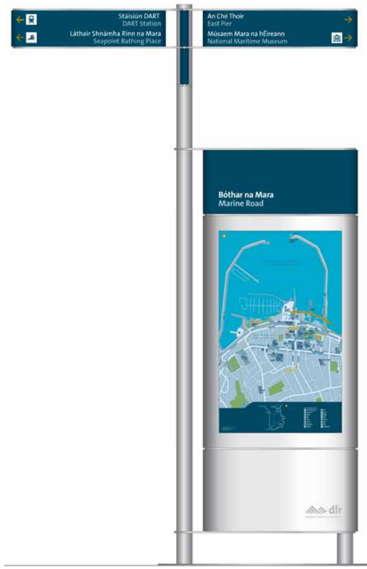
Below: Way-Finding System - Pedestrian Signage

The Unit facilitated the co-ordination of the CDB Economic Development Committee that consisted of the senior management of DLR County Enterprise Board, FAS, IADT, Dún Laoghaire VEC, County Dublin VEC, Southside Partnership, IDA, Enterprise Ireland and DLR Chamber.