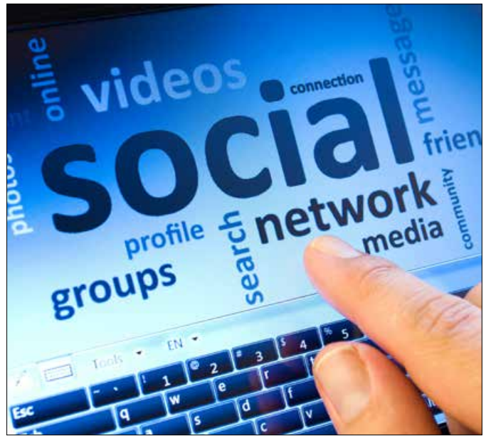
Above: Social Media