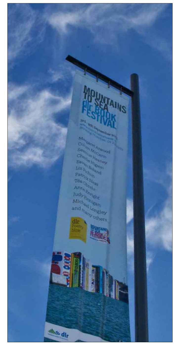
Above: Mountains to the Sea Book Festival Banner

Legal Services continuously review and monitor systems to ensure that all cases and claims are effectively managed.