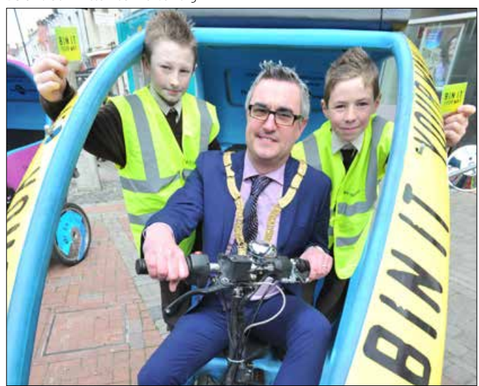
Below: Gum Litter Task Force 2013