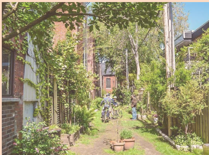
Green Alleys/ Ruelles Vertes, Montreal