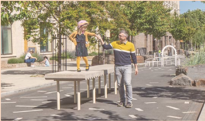
Kings Crescent Estate Hackney