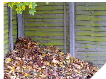
Photo credit Bonfires: Leaf Pile, bishib70 on flickr CC BY-NC-ND 2.0