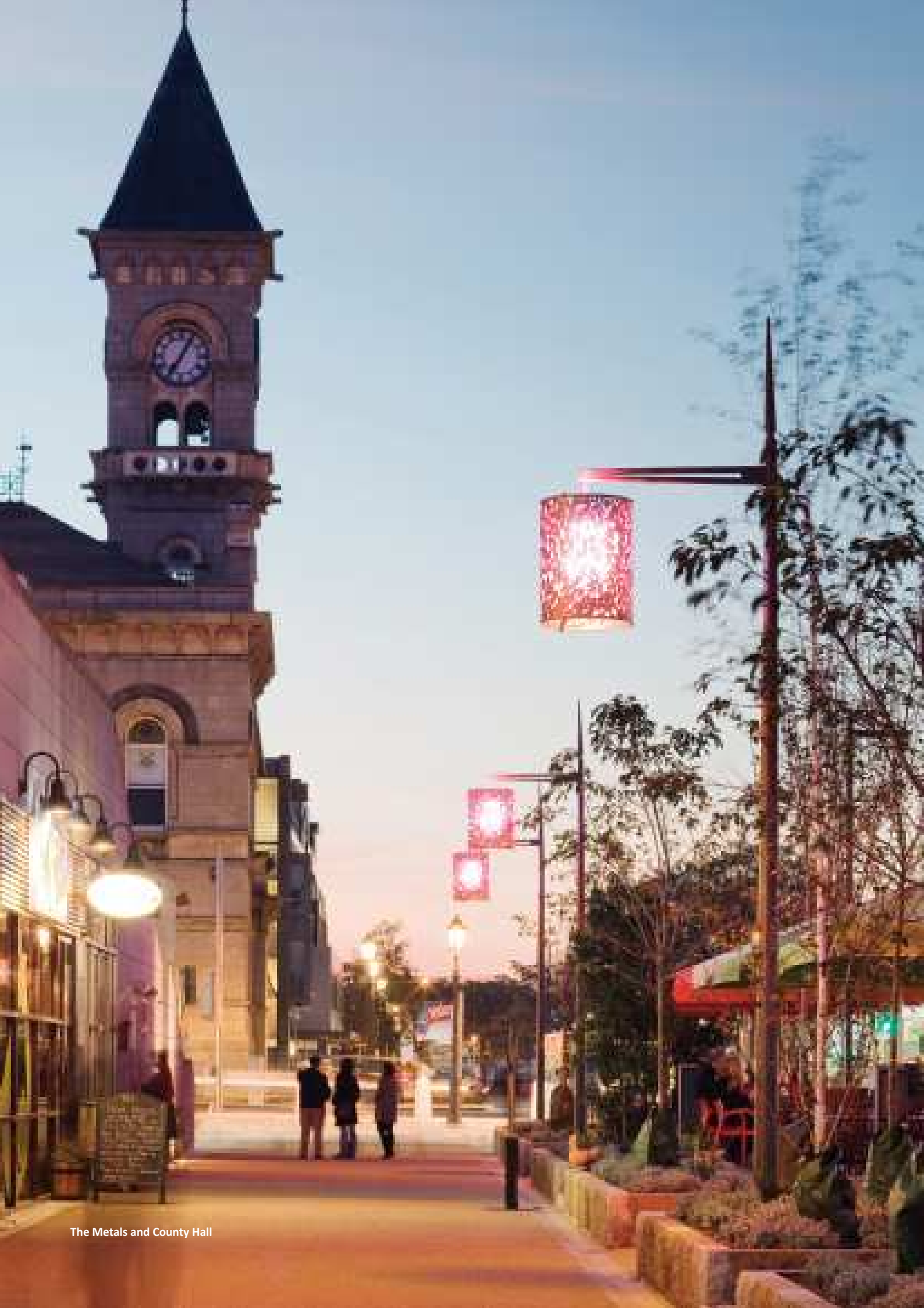
The Metals and County Hall