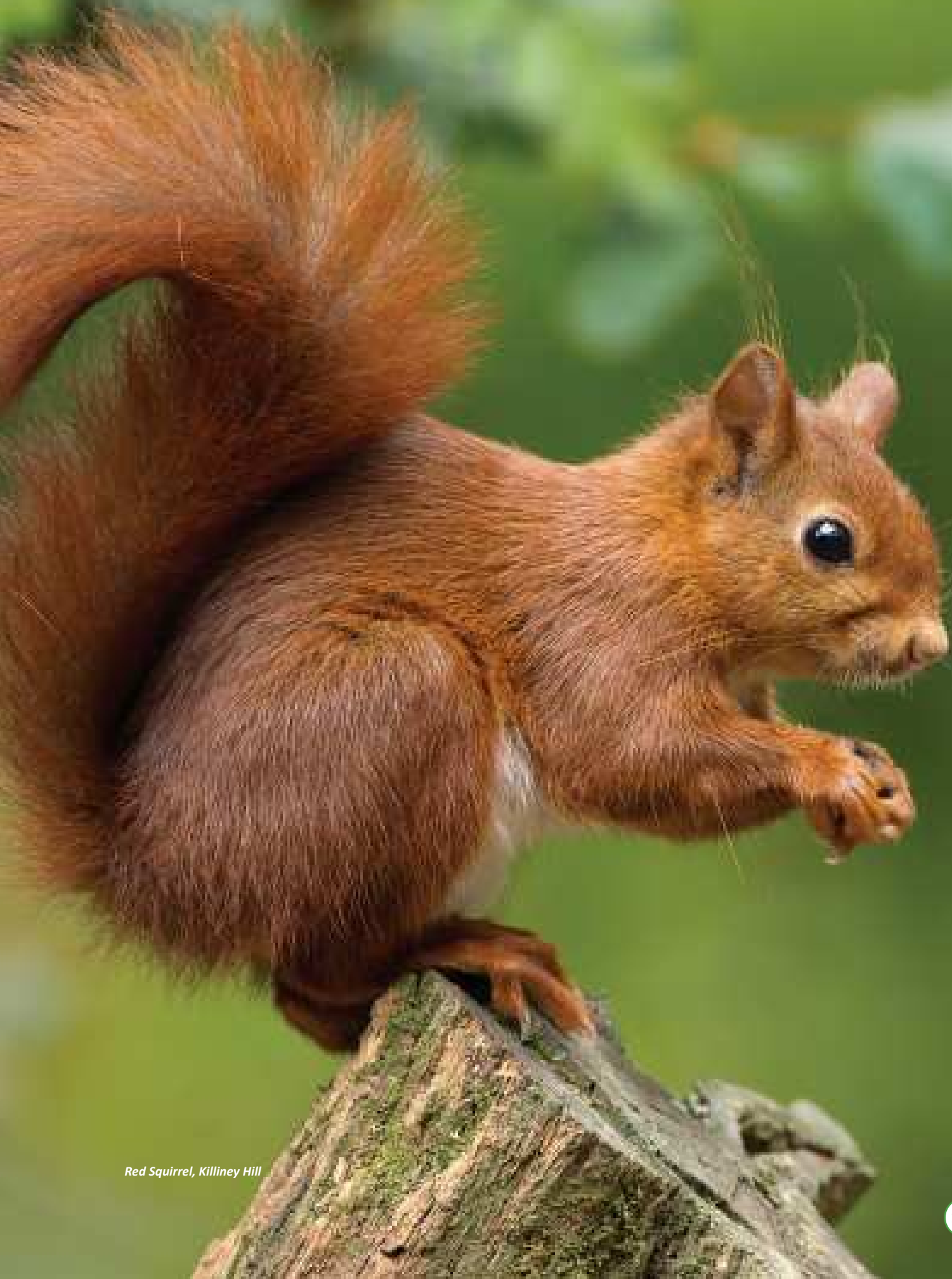
Red Squirrel, Killiney Hill