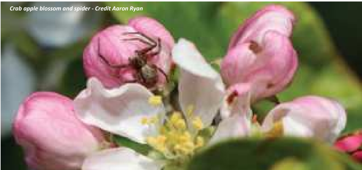
Crab apple blossom and spider