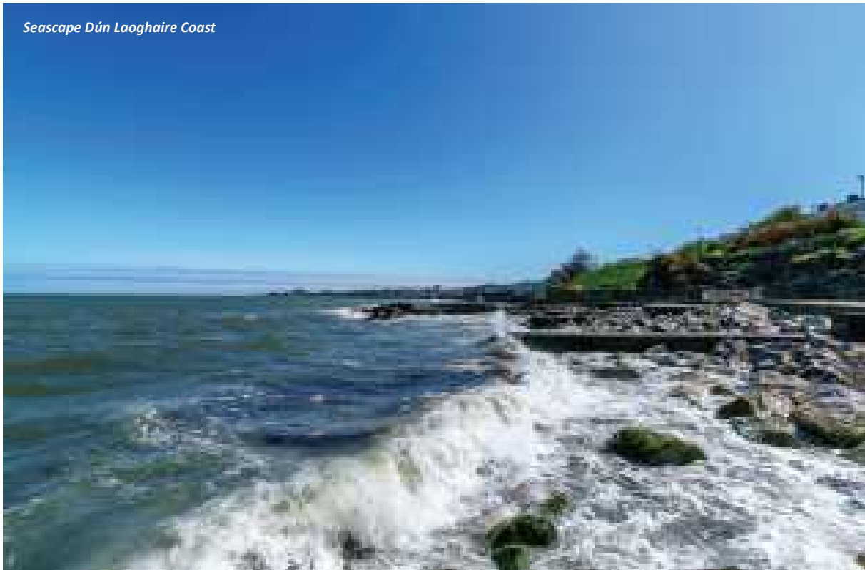
Seascape Dún Laoghaire Coast

Seascape Character Assessment is an extension of Landscape Character Assessment and, with 17km of coastline, Seascape is a crucial element of the County's history, identity, and culture. It is recognised that a Seascape Assessment for coastal parts of the County should be carried out, as there is a need to identify and describe seascapes in order to recognise the character, and key visual attributes of different parts of the coast/sea, and to understand and manage the natural and other factors that lead to seascape character change.