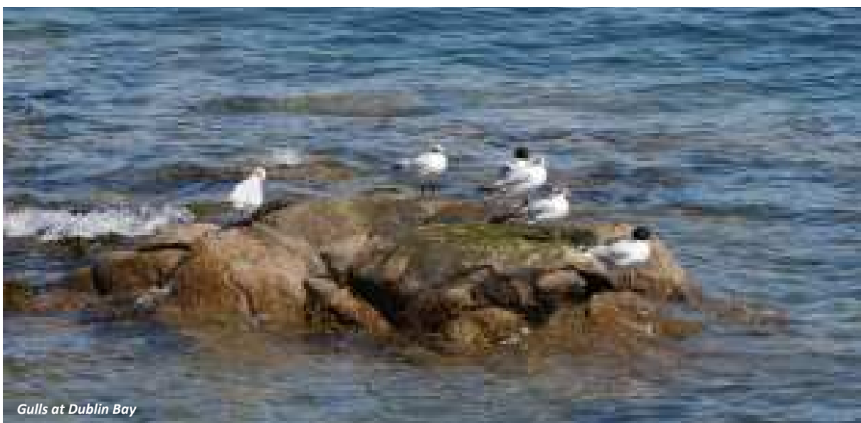
Gulls at Dublin Bay

It is a Policy Objective to continue to upgrade recreational and tourism-related amenities in the public parks and harbours along the coastline, including improved accessibility by the general public.