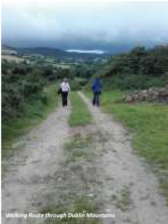
Walking Route through Dublin Mountains

It is a Policy Objective to promote and to co-operate in the extension of the Wicklow Mountains National Park.