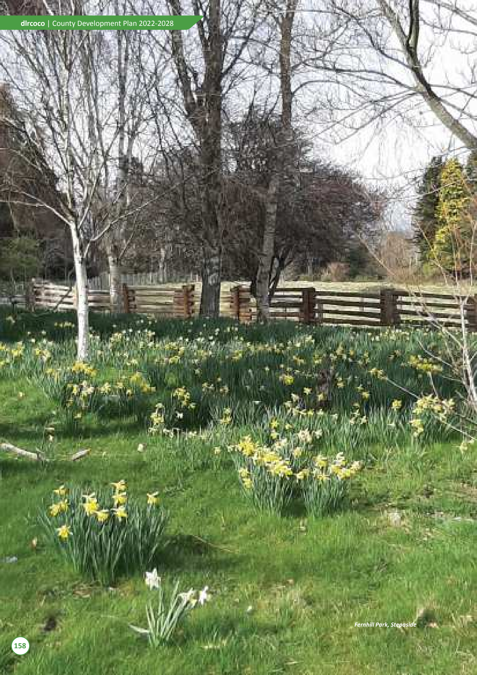
Fernhill Park, Stepaside