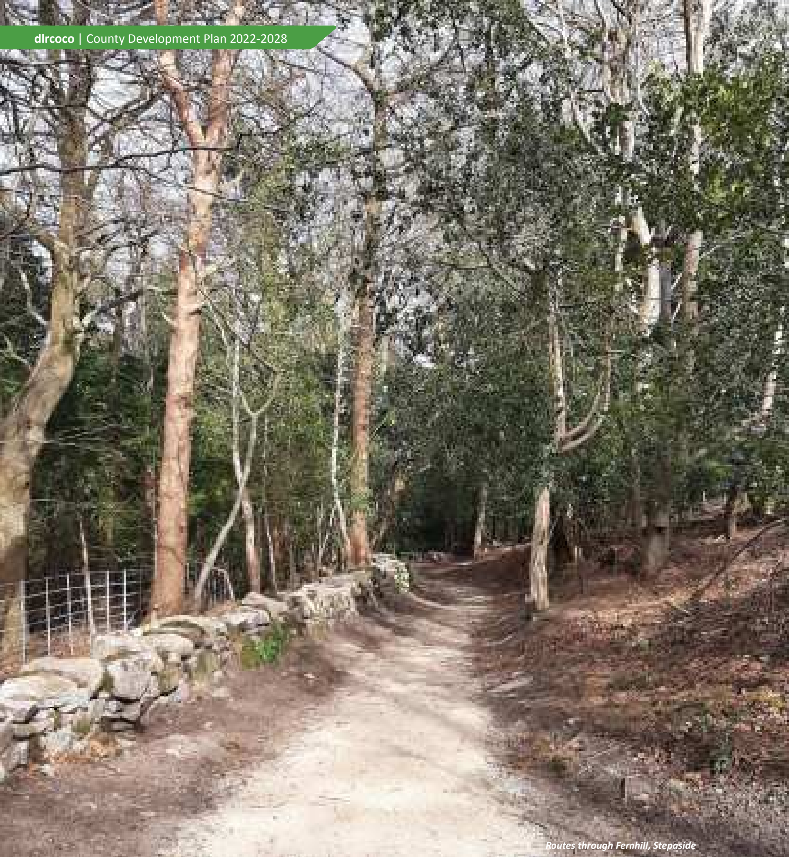
Routes through Fernhill, Stepside