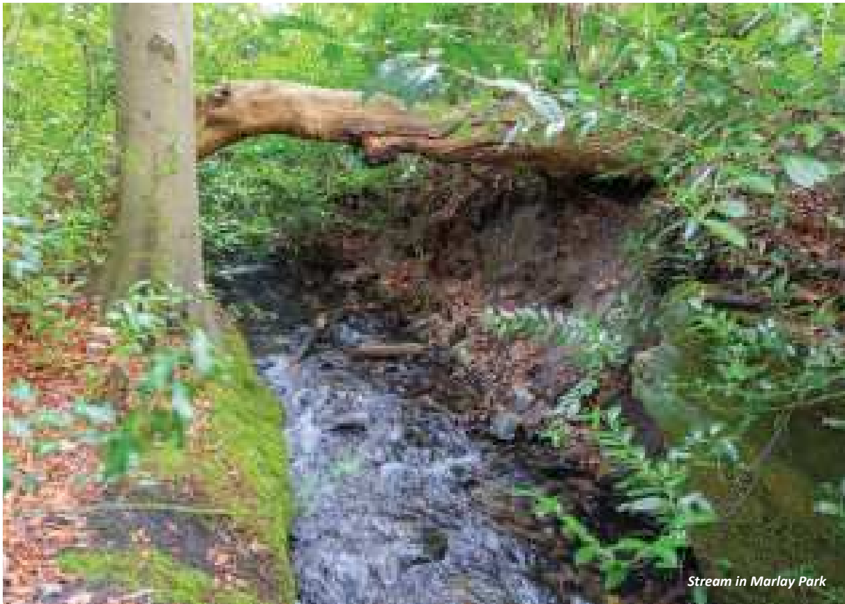
Stream in Marlay Park

Policies throughout the Plan are aimed at affording further protection of these features (refer also to Policy Objectives GIB24 and GIB25 below).