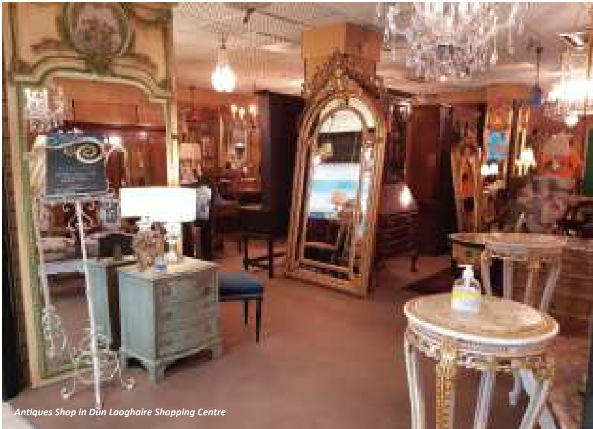
Antiques Shop in Dún Laoghaire Shopping Centre