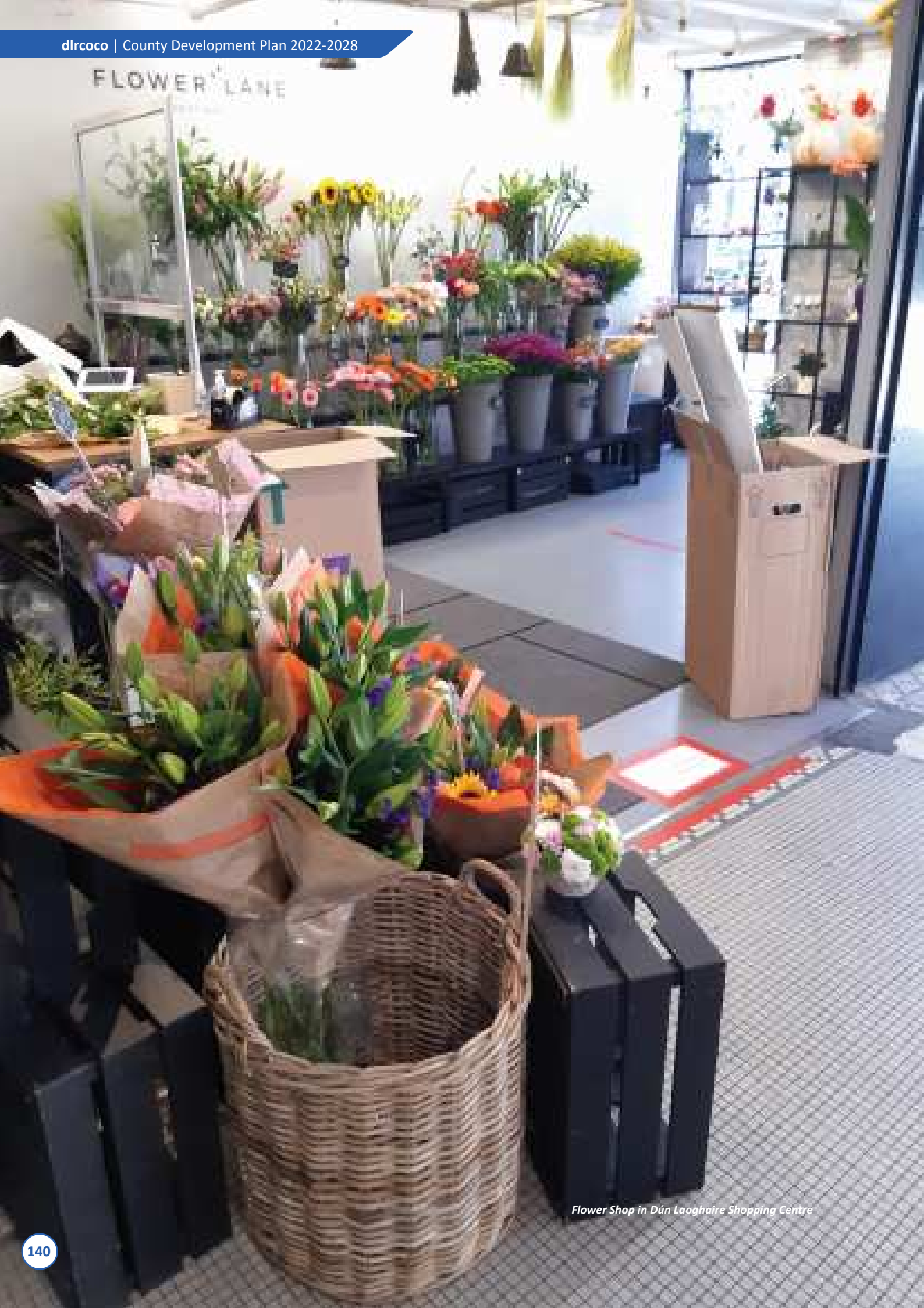
Flower Shop in Dún Laoghaire Shopping Centre