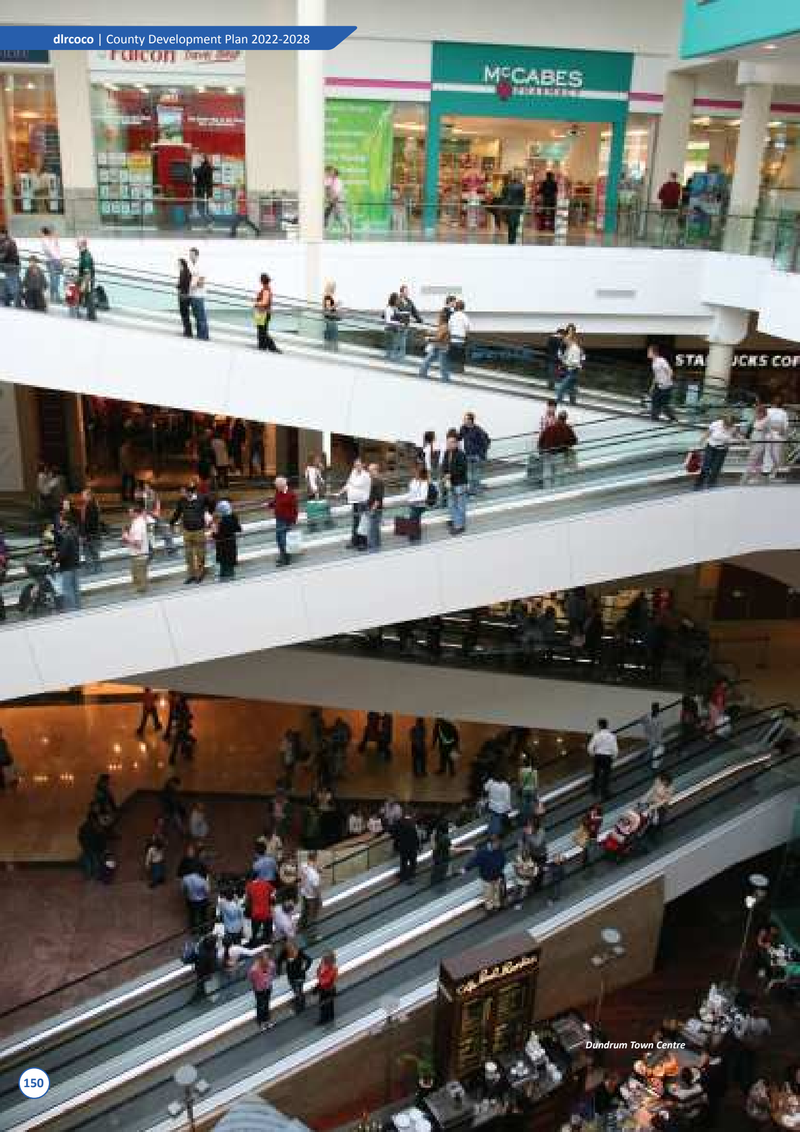
Dundrum Town Centre