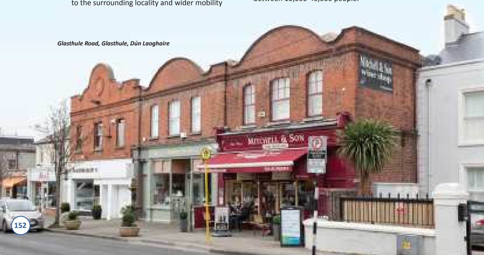
Glasthule Road, Glasthule, Dún Laoghaire

According to the RSGDA, District Centres will vary both in the scale of provision and size of catchment depending on proximity to a major town centre. However, a good range of comparison shopping would be expected (though no large department store) as well as some leisure activities, a range of cafes and restaurants and other mixed uses including employment. They should contain at least one supermarket and ancillary food stores alongside financial and other retail services. District Centres should generally range in size from 10-25,000 sq. m. net retail sales area catering for a population of between 10,000-40,000 people.