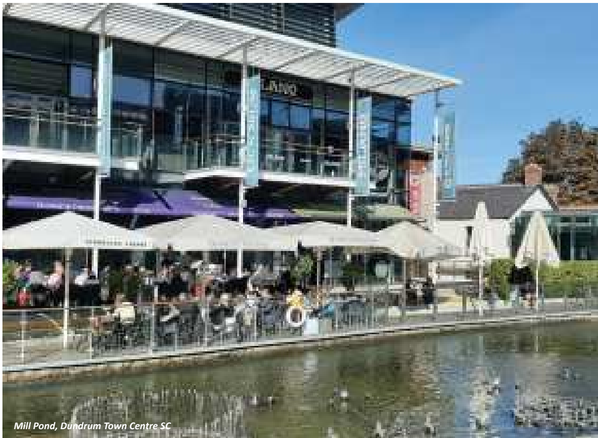
Mill Pond, Dundrum Town Centre SC

so as to create a sense of place and vibrancy. Across the UK and Continental Europe, town centres are consolidating rather than expanding, and development coming forward in centres is increasingly less retail-led and more mixed use in nature. Additionally, research from the UK indicates that out of town, one shop food shopping is declining in favour of convenient, local neighbourhood shopping.