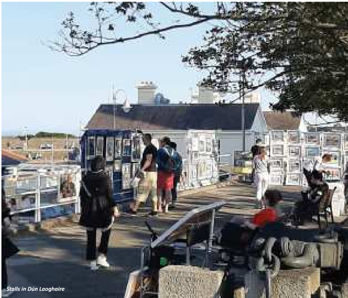
Stalls in Dún Laoghaire

It is a Policy Objective of the Council to have regard to the 'Retail Planning Guidelines for Planning Authorities' and the accompanying 'Retail Design Manual' published by the Department of the Environment, Community and Local Government in 2012 in determining planning applications for retail development.