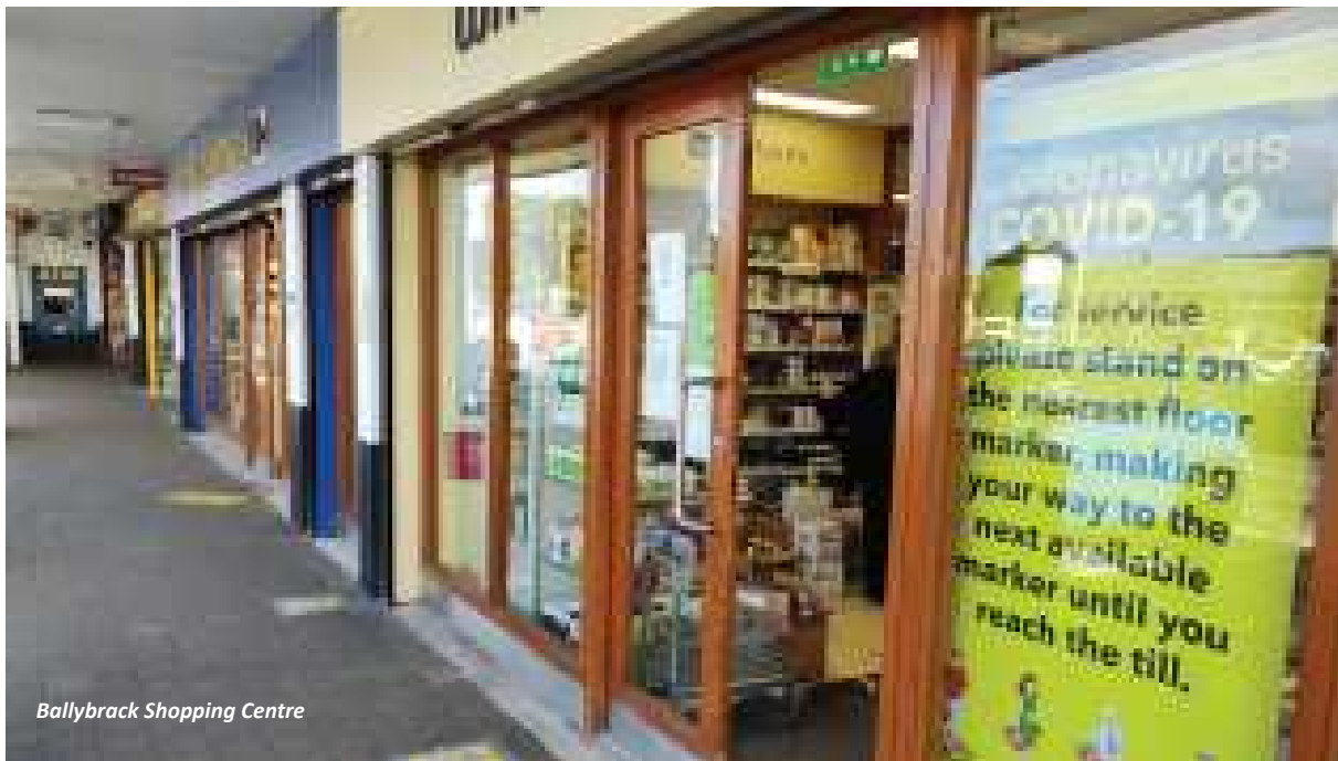
Ballybrack Shopping Centre