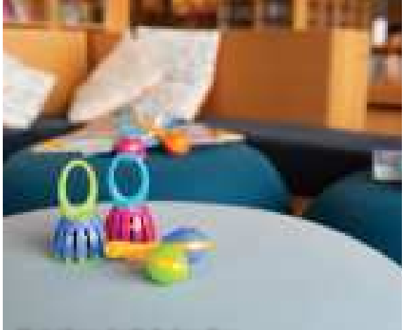
Music Library, Credit: Barbara Flynn

It is an objective of the Plan to support the facilitation of the provision of refuges and safe home accommodation for victims of domestic, sexual and gender-based violence in the County, with the involvement and support of Túsla, the Child and Family Agency, the primary statutory agency for the provision of domestic violence related services and provision and other relevant agencies.