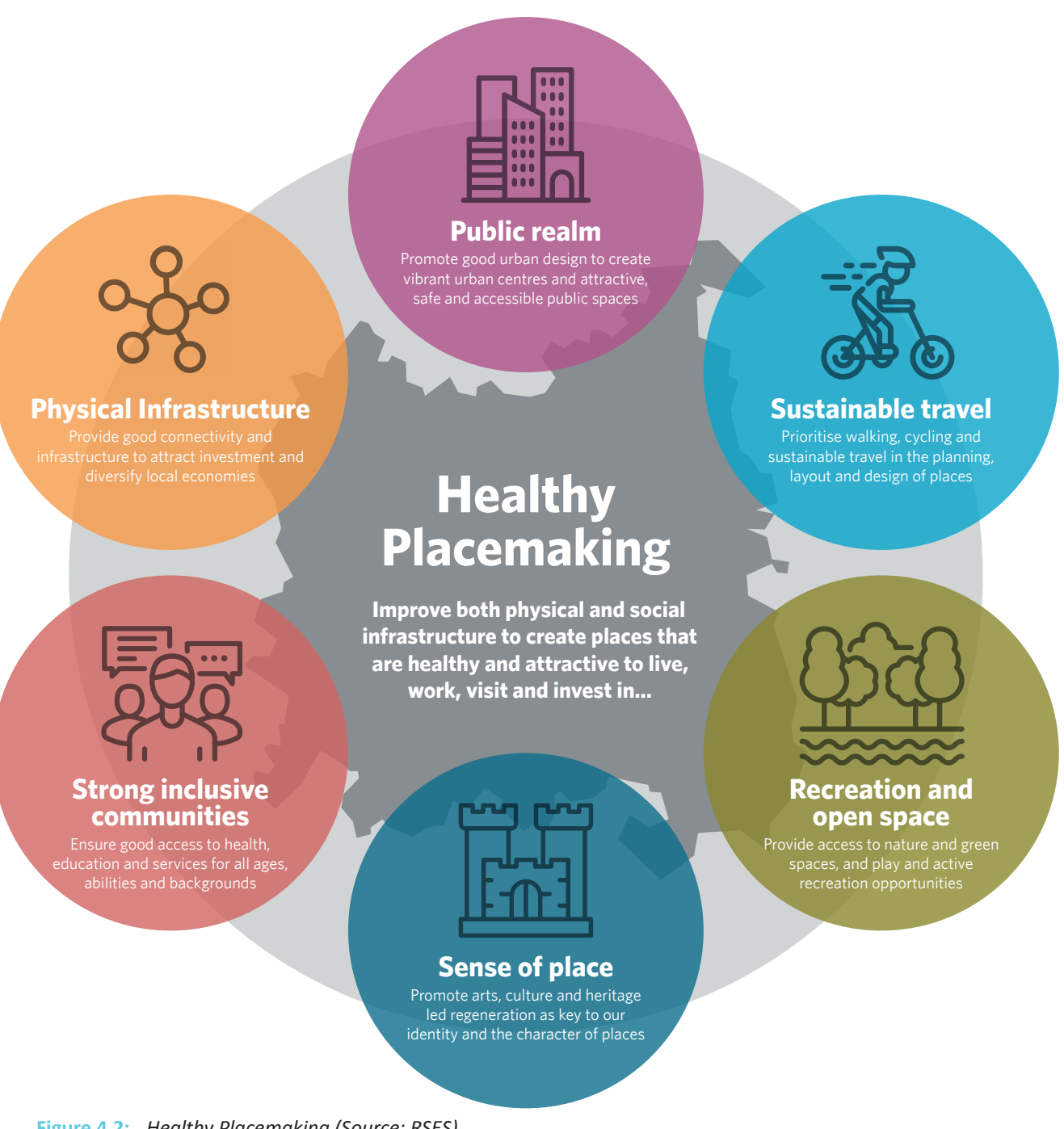
Figure 4.2: Healthy Placemaking

Healthy placemaking incorporates high quality urban design with promoting active lifestyles through good quality pedestrian and cycling links, particularly to and from places of work, education and recreation. The various strands of healthy placemaking, as taken from the RSES are illustrated in Figure 4.2. Healthy placemaking in DLR will require the application of a number of various policy objectives and guiding principles contained throughout this plan. In promoting high quality design and healthy placemaking, the plan has had regard to the policy and guidance contained in Appendix 12.