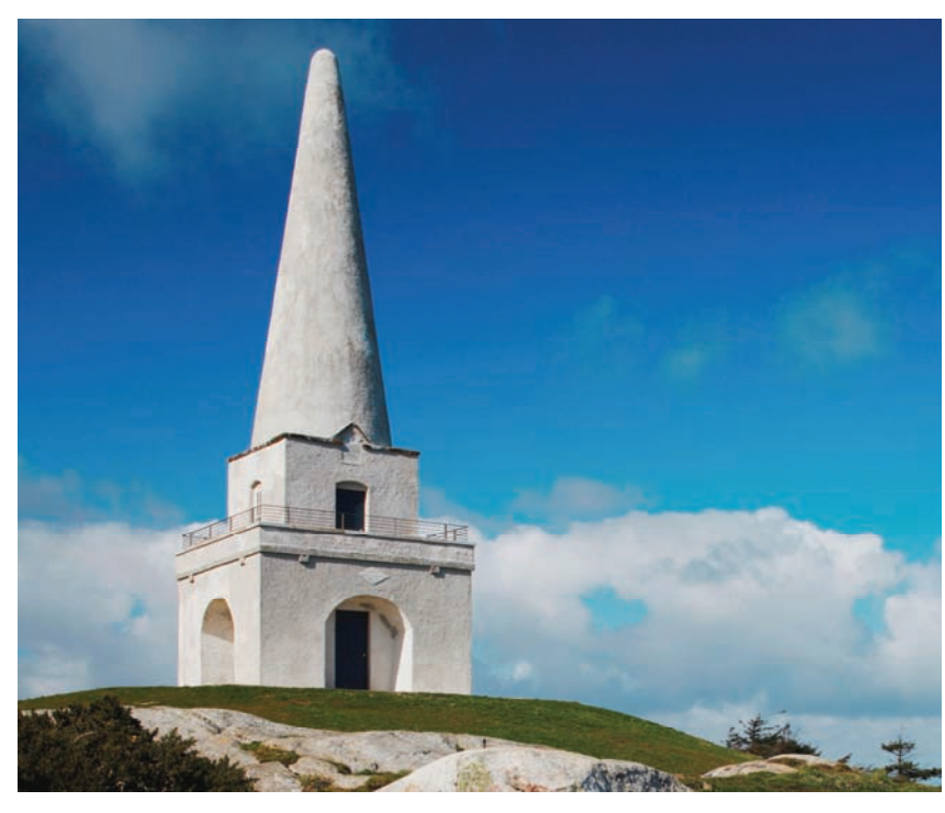
Manmade feature in a semi-natural landscape at Killiney Hill Park

2.4.4 The Planning and Development (Amendment) Act 2010 incorporates the ELC definition of landscape into Irish legislation for the first time. This definition reflects the idea that landscapes evolve through time, as a result of being acted upon by natural forces and human beings. It also emphasises that a landscape is understood as a whole entity, where its natural and cultural components are taken together, not separately.