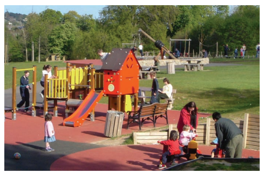
Families and children enjoying the playground at Cabinteely Park