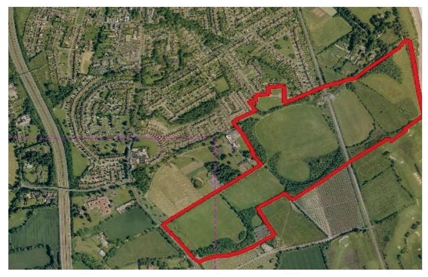
Shanganagh Park (33.4 hectares) - a significant part of the greenbelt between Shankill and Bray [1980's-1990's]

During the late 1990's and early 2000's the pace of development accelerated particularly with the opening of M50 extension and the related high density residential and industrial expansion in Sandyford/Leopardstown, Stepaside and Carrickmines. Changes in density policy density are evident - from 3.3 units to over 100 per hectare being permitted today. While quantitative criteria for open are still important the emphasis has shifted to quality. Employment moved from industrial to smart economy requiring different type of setting and amenities including open space.