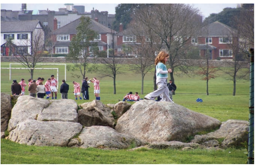
Sport and informal play at Deerpark, Mount Merrion