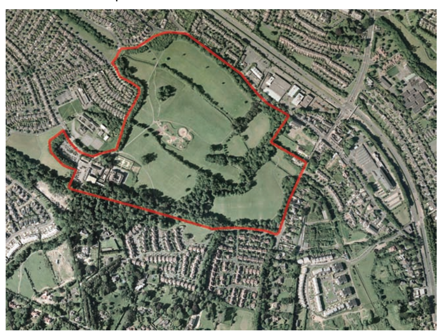
Cabinteely Park (36.6 hectares) in low-density house district [1980-90's], next to Cabinteely Village and old Dublin Road to Bray

The challenge posed by densification and loss of open spaces (e.g Dun Laoghaire Golf Club) to the provision of adequate and high quality parks and open space is significant. In the 1930's it was envisaged that Dublin county would have extensive greenbelts. Today, little remains of that strategic objective, except in areas such as Shankill / Woodbrook and Little Bray, where Kilbogget Park and Woodbrook Golf Course form an important break to the southern expansion of urbanisation.