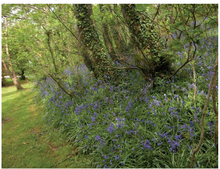
Wild Bluebells at woodland edge in Killiney Hill Park