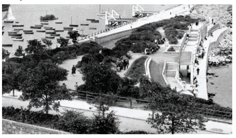
View of east pier and gardens c.1936

People's Park, Beach Gardens (East Pier), Salthill Gardens, Coliemore Park and Sorrento Park. Dalkey Hill and quarry were purhcased to enlarge the Killiney Hill Park.