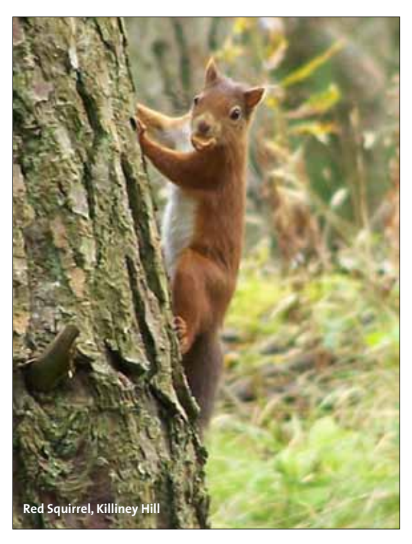
4.1.3.6 Policy LHB24: County-Wide Ecological Network*

It is Council policy to develop an Ecological Network throughout the County which will improve the ecological coherence of the Natura 2000 network in accordance with Article 10 of the Habitats Directive. The network will also include non-designated sites.