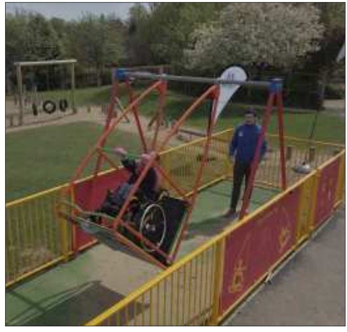
Ability Swing in Cabinteely Park