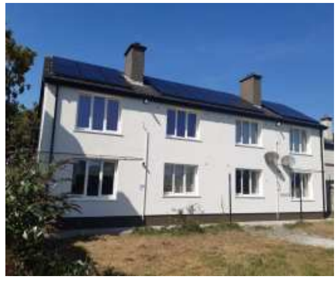
Properties in Rosemount, Dundrum, after receiving an energy retrofit

2021 was the first year of a new 10-year Energy Efficiency/ Retrofit Programme to retrofit local authority housing stock. As part of this programme, the Housing Maintenance Section completed energy upgrades to 53 properties in 2021. The range of works undertaken in the properties included external wall and attic insulation, solar panels, new doors, new windows, blocking of fireplaces, low energy lighting, high efficiency boilers and upgraded heating controls. All properties received a minimum of a B2 BER rating after the works were completed.