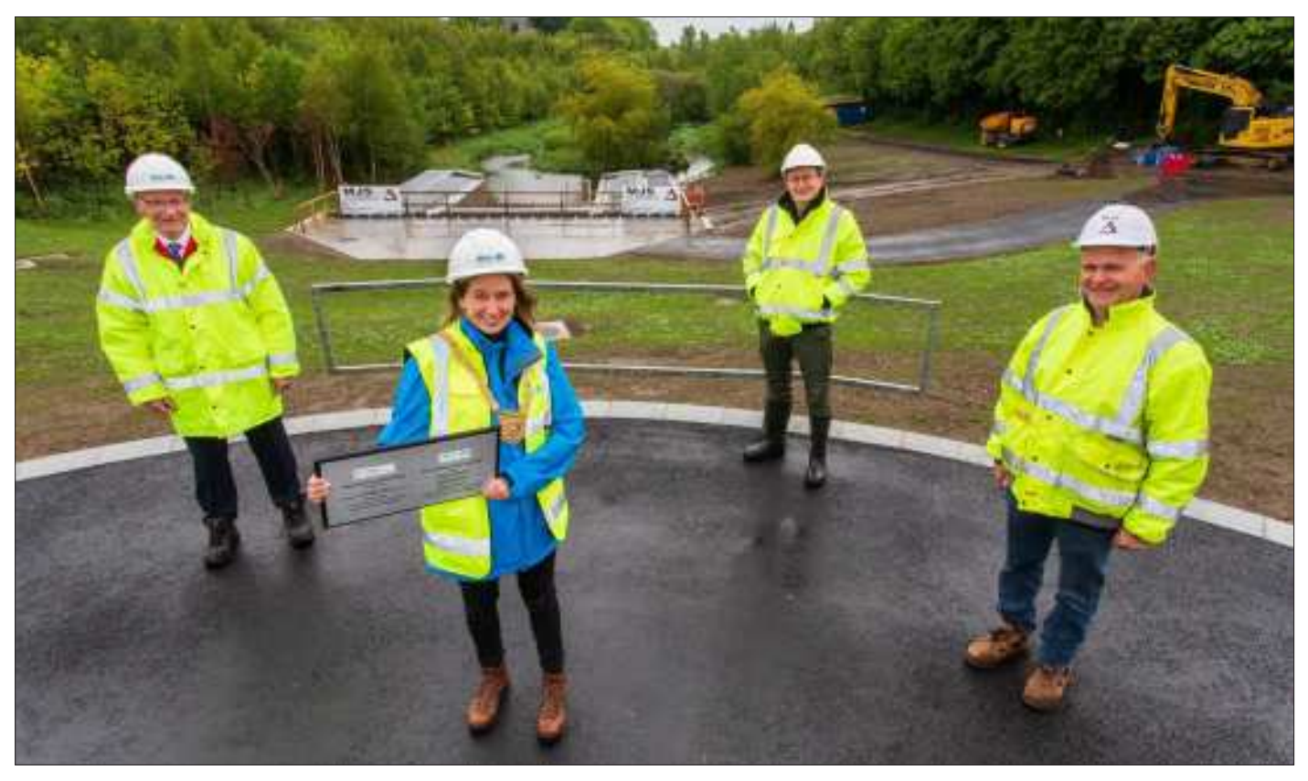
Kilbogget Park Flood Storage System opened

The Section also project manages smaller more localised flood relief projects with DLR funds or OPW Minor Works funding, if available. The roll out of screen cameras on key river catchments is ongoing. These cameras provide vital information during storm events when it is difficult or unsafe for Operations crews to access the areas.