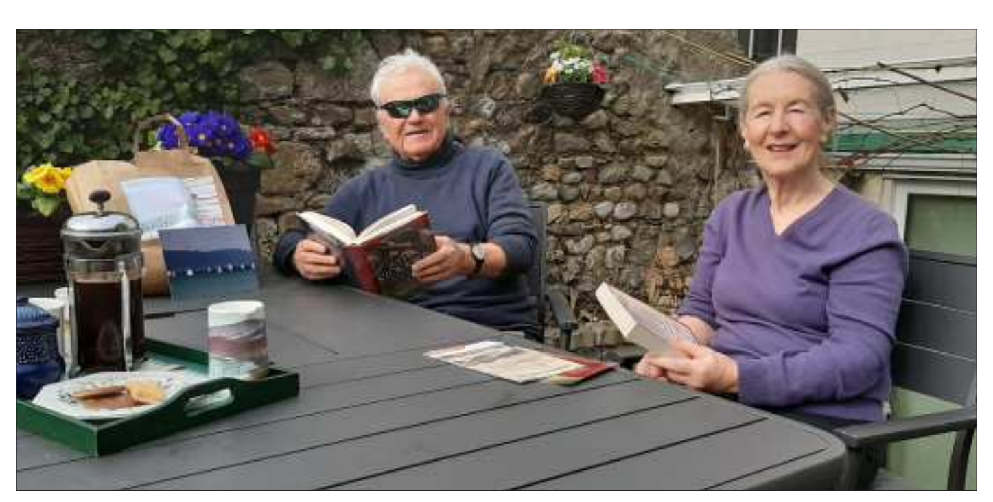
Enjoying a book drop delivery

• 2,489 events held with 74,687 attendees (includes online, inperson and pre-records on social media and YouTube)