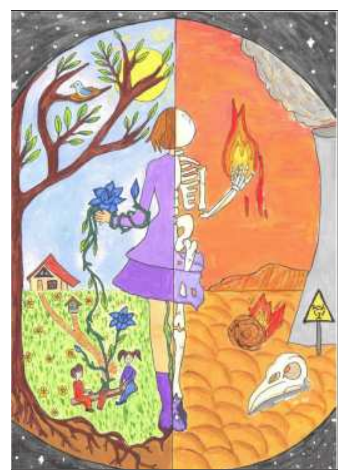
Development Plan Art Competition winner – Climate Action

Building Control's objective is to promote a culture of compliance with the Building Regulations through the fulfilment of the various statutory functions and active engagement through a risk assessed inspection process. 2021 was a buoyant year for the Building Control section, which saw increases in applications and incomes. This was particularly acute in FSC applications (62% rise on 2020) and in Commencement Notices (30% rise on 2020). Along with the Building Control legislation this section also coordinates the