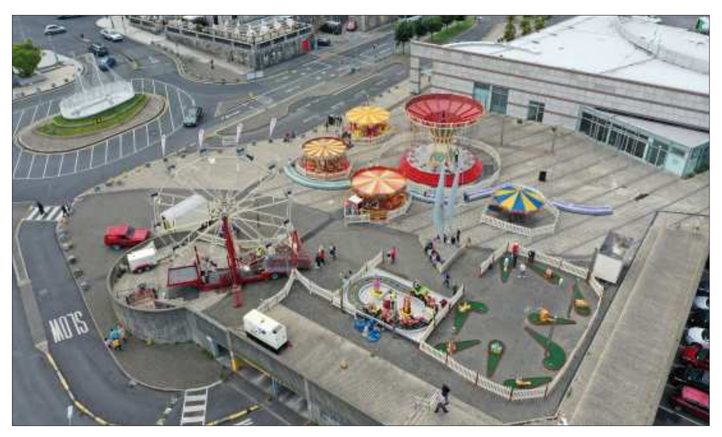
Funfair at Dún Laoghaire Harbour