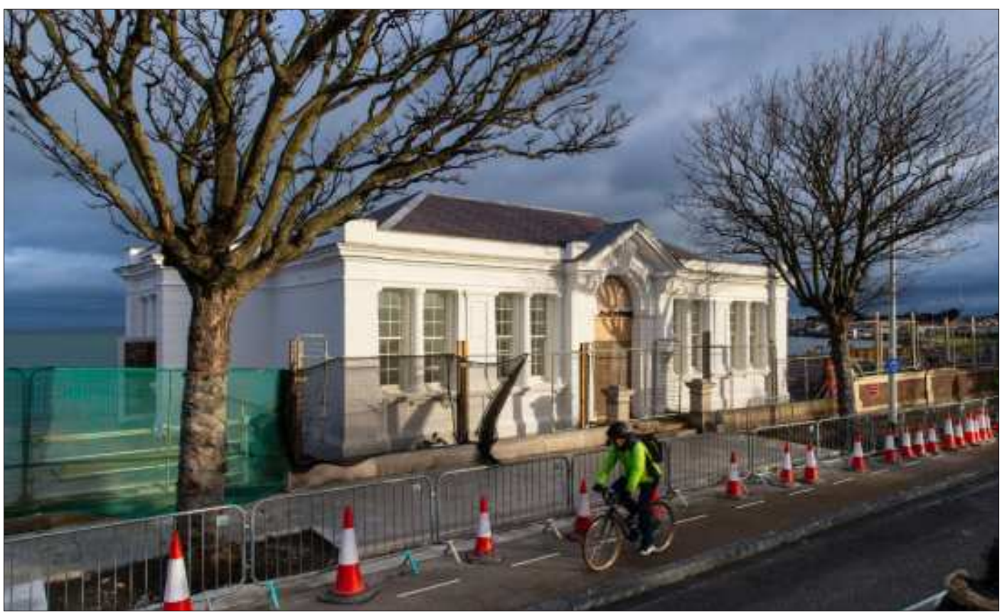
Dún Laoghaire baths