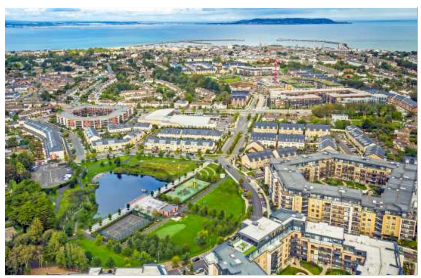
Honeypark - photo by Imageworks Photography on behalf of Cosgrave Group