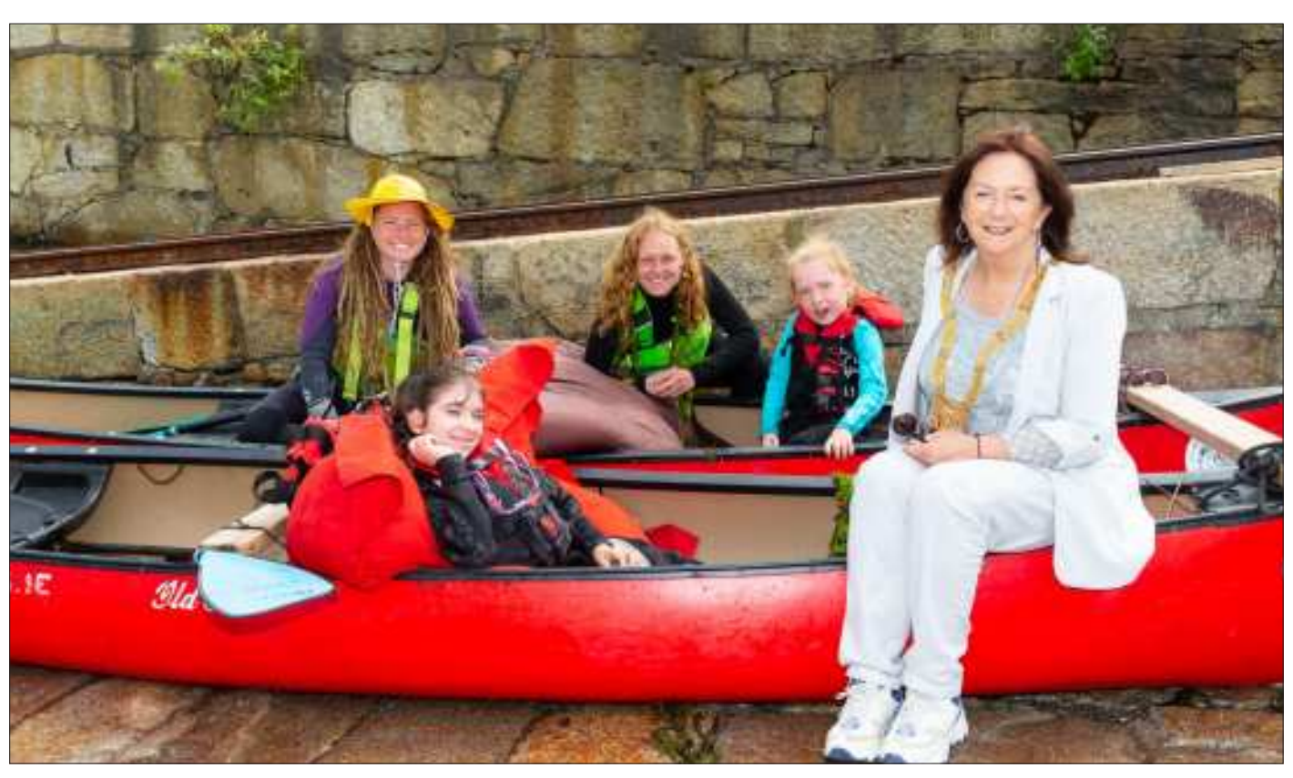
Sports Ability Water Camp

In 2021 DLR Sports Partnership organised and delivered a wide range of training courses, workshops and targeted physical activity programmes for all ages, abilities and sporting types.