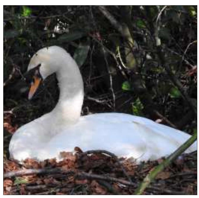
Mute Swan (female) nesting Marlay Park