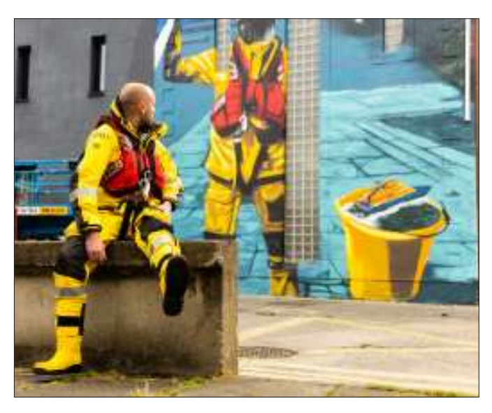
Dún Laoghaire Anseo Street Art – RNLI

The City of Brest, France, hosted the start of the Tour de France Cycle Race in 2021. dlrcc were part of a photographic exhibition of twinned cities for the start of this event.