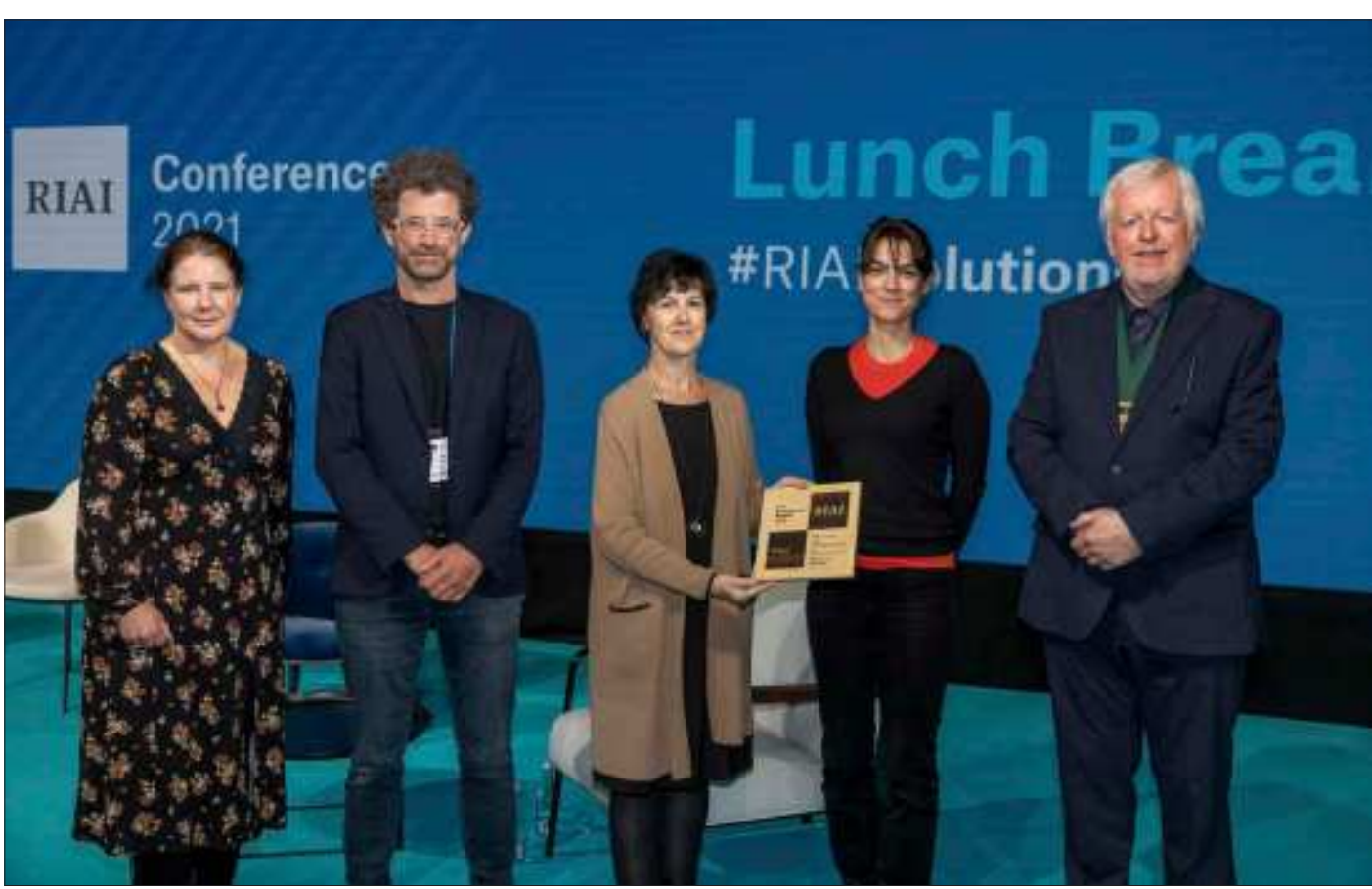
RIAI Awards 2021

In September, the Roger Casement Statue was lifted into place at the Dún Laoghaire Baths. The refurbishment of the existing Baths Pavilion, construction of a new jetty to give easy access to the water for swimming and the creation of a new route between Newtownsmith and the East Pier is nearly completed. The former Pavilion building has been refurbished to provide studio space for artists and to provide gallery and café facilities overlooking Scotsman's Bay. The Pavilion will also provide a new