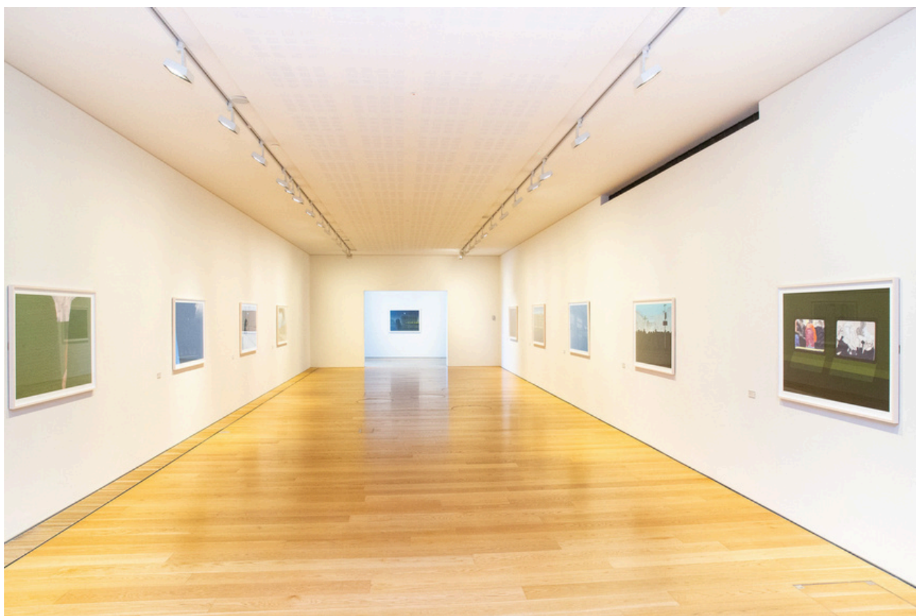
On Returning Exhibition by Gary Coyle.

The decision of the selection panel will be final and will be based on the scoring system that is outlined below. If no application reaches the minimum marks, we will not choose an exhibition from this process. We will then use a different selection process instead.