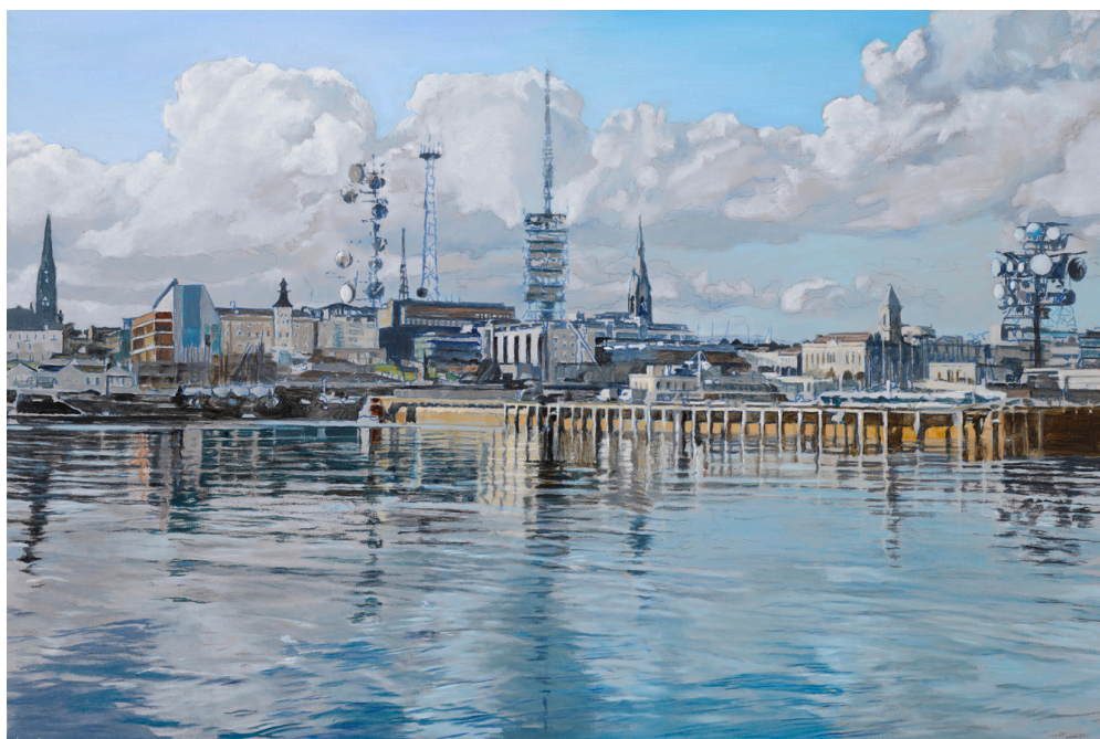
On the Waterfront by Dave Madigan

Please read all the information below before you make your application