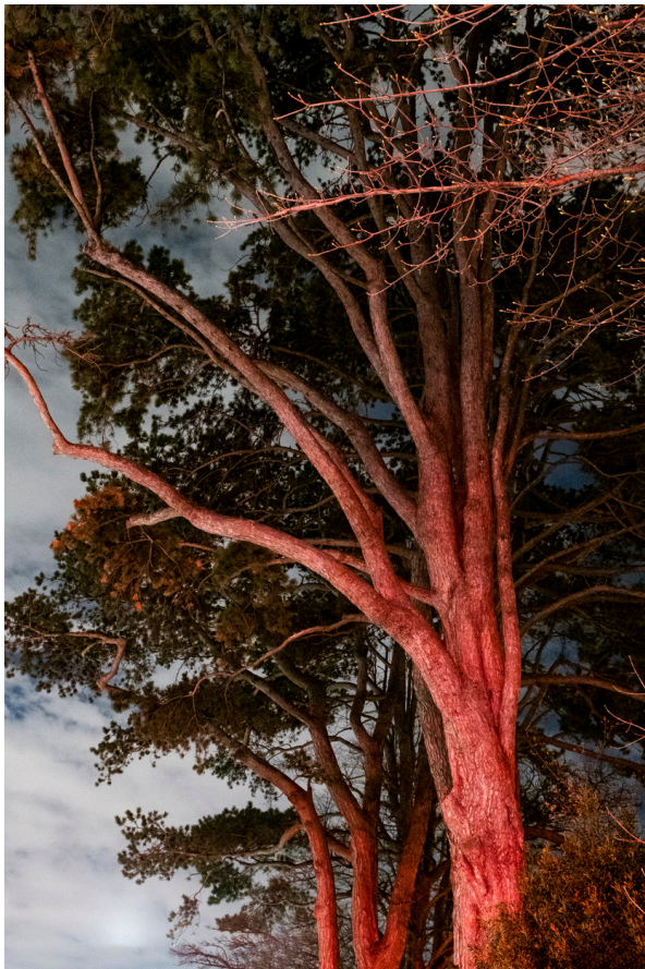
Red Tree, 2022 by Dianne Whyte

Closing date for applications: Monday 3 November 2025 at 2pm