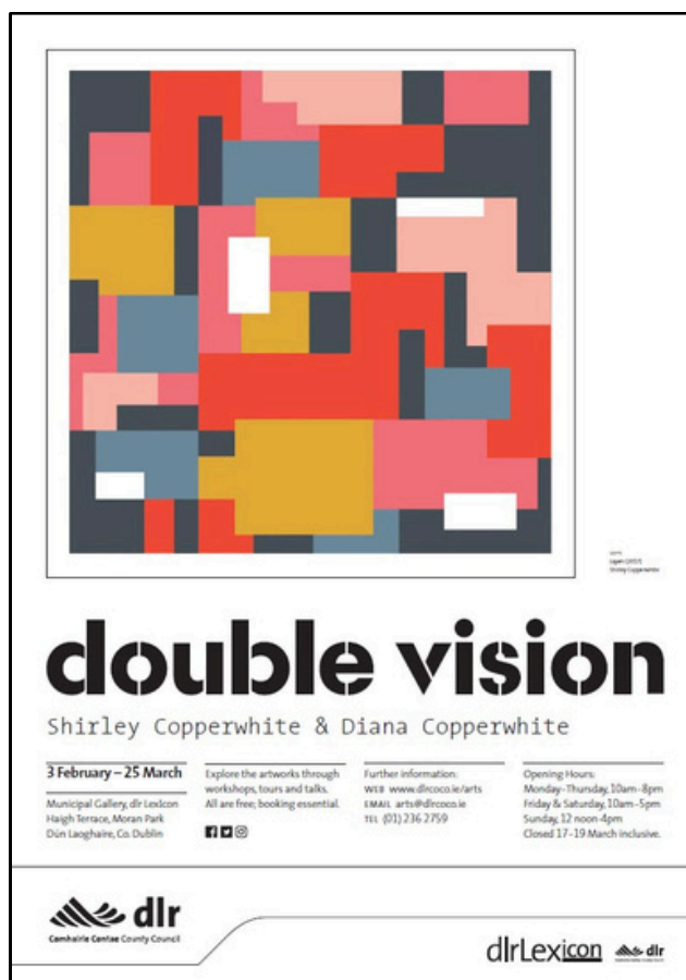
Double Vision Exhibition Posters, 2018. Diana Copperwhite and Shirley Copperwhite