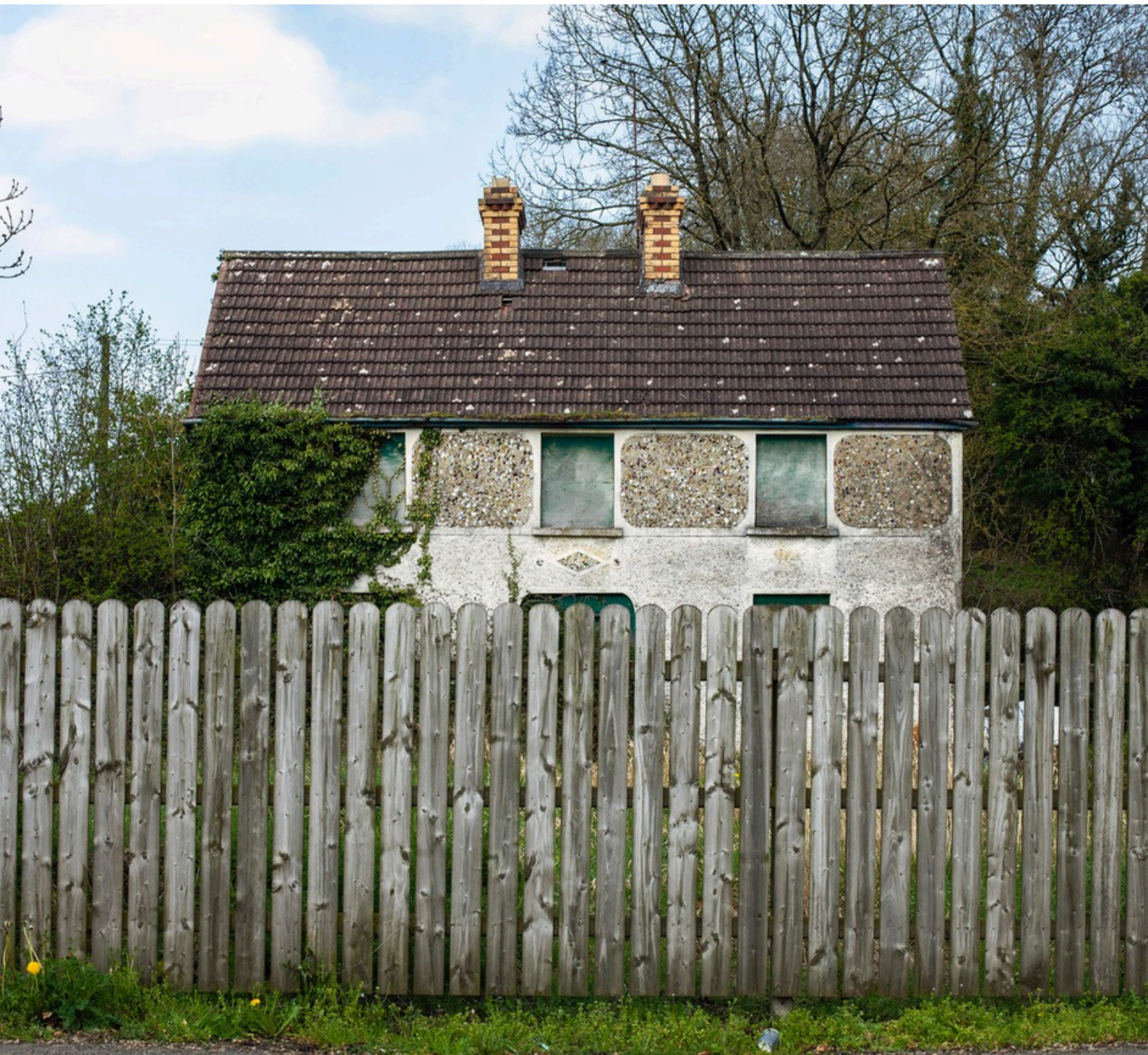
Co. Monaghan 2019