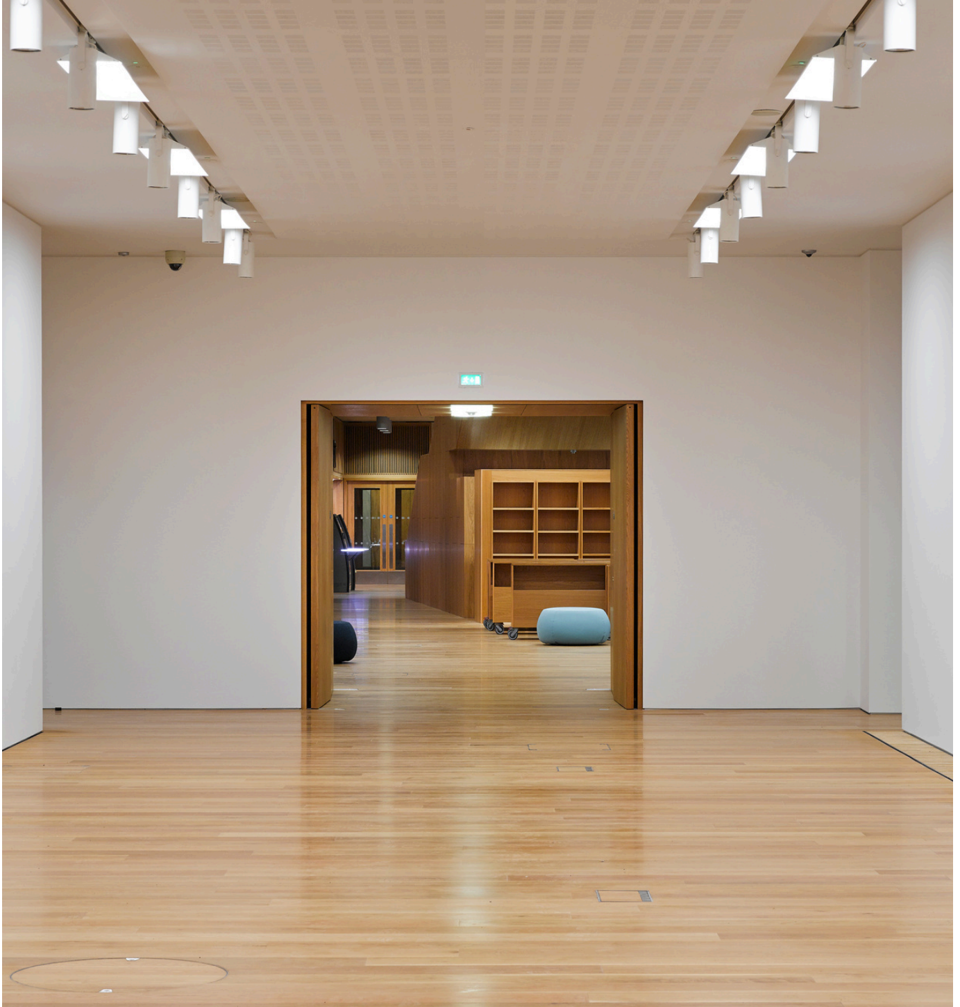
dlr Municipal Gallery by Ros Kavanagh

www.dlrcoco.ie/arts arts@dlrcoco.ie (01) 2362759