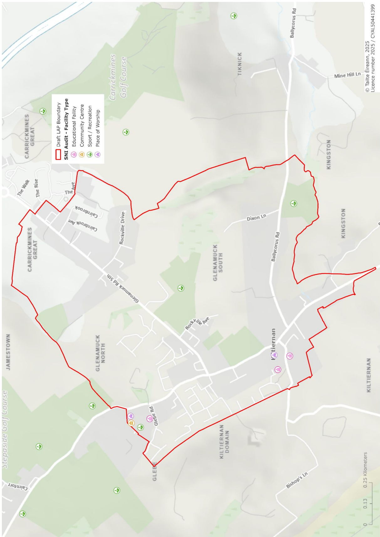
Map 1: Location of existing facilities within the LAP boundary