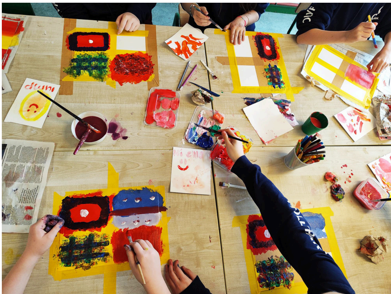
St Patrick's GNS, Hollypark - Jane Cummins

If none of the applications we receive reach the minimum 80 marks, we will not choose from this open call. We will then use a different selection process instead. We will select six applications. We may form a panel from the applications if any also score over 80 marks. We may use this panel for further projects if more funding becomes available within a one-year timeline.