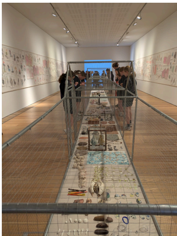
Mount Anville-Gabrielle Breathnach