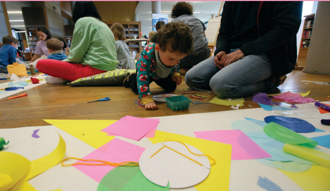
IMAGE: Workshop for children.

Thank you for visiting and we hope you enjoy the 2025 programme of exhibitions.