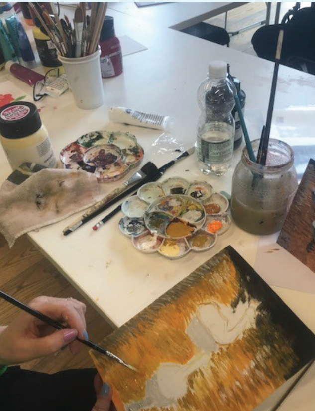
IMAGE: Open Art Studio for Adults

Make sure you visit the Project Room beside the Gallery. There are art materials on hand to bring out the artist in you. Ideal for a rainy day with the kids!