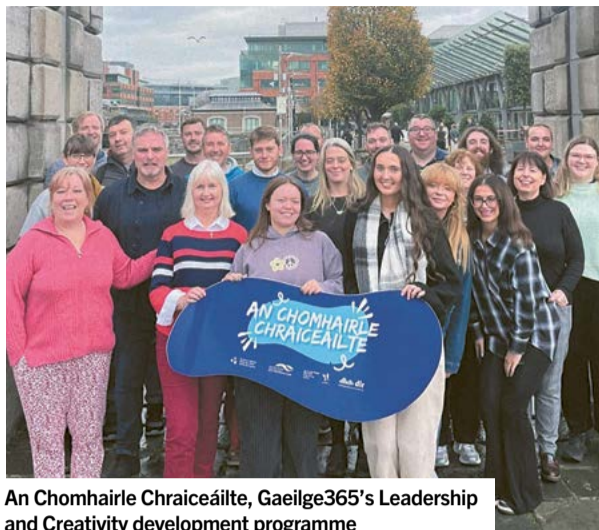
An Chomhairle Chraiceáilte, Gaeilge365's Leadership and Creativity development programme

As this year ends, the Irish Office has continued to play a vital role in upholding the Irish Language Scheme, ensuring that Irish remains a visible and active part of the organisation's work. This year has seen important steps taken to enhance both the accessibility and presence of the Irish language across public and workplace environments.