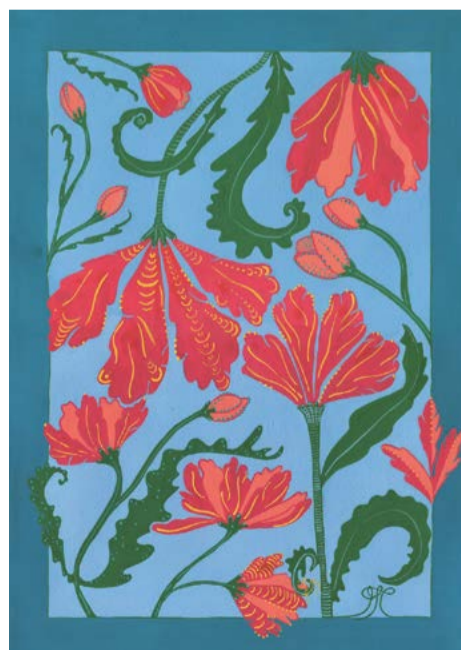
Image courtesy of Hannah-Clare de Gordun who will be facilitating an 'Introduction to Gouache Painting' Workshop on 7 December.

Workshops for adults are bookable on www.eventbrite.ie by searching for dlr Lexlcon Gallery.