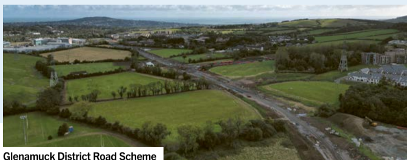
Glenamuck District Road Scheme