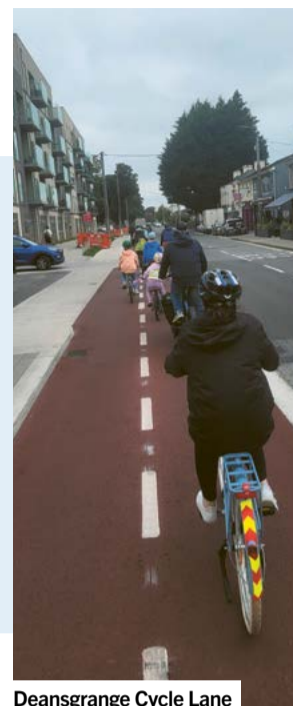
Deansgrange Cycle Lane