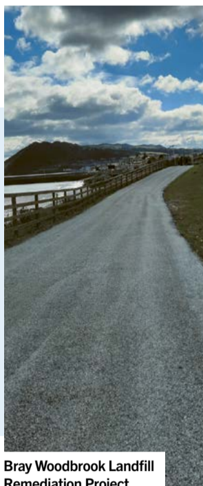
Bray Woodbrook Landfill Remediation Project