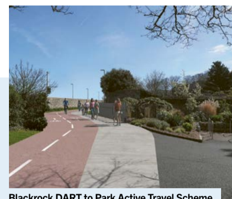
Blackrock DART to Park Active Travel Scheme