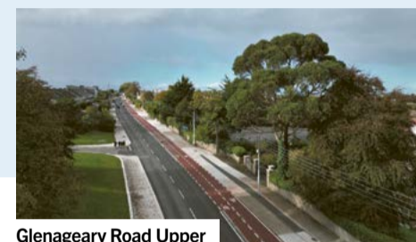
Glenageary Road Upper