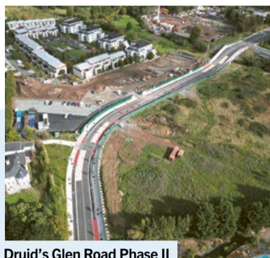
Druid's Glen Road Phase II