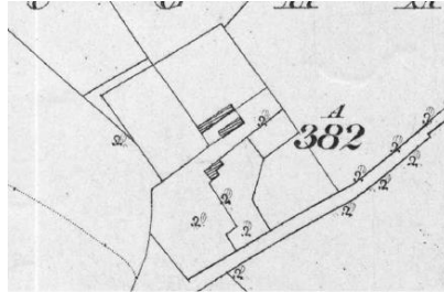
Above: Ordnance Survey first edition, 1843

The original early 19th house is vacant and in a very poor state of repair and requires urgent repair works.