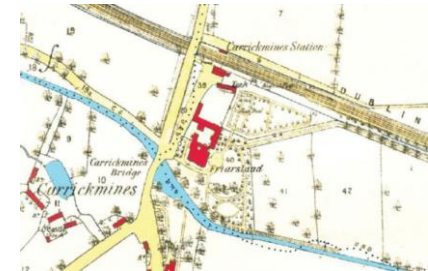
Above: 1864 Ordnance Survey Map

This is an area to the rear of the Glendruid House. The First Edition Ordnance Survey Map, 1843, shows the area laid out as a garden/orchard, evidence of which is still visible on the ground. The site has been developed in recent times with two new dwellings. An intrinsic feature of this part of the site is the high stone boundary wall onto Lehaunstown. The wall forms part of the protected structure and therefore only a minimum number of openings will be considered by the planning authority in order to facilitate development. Development considerations in this area will be of sensitive design, modest in height with a maximum of 2-storeys and of a scale subservient to Glendruid House, and 'courtyard' style development which echoes the way the garden was originally laid out as evidenced on Historic Maps.