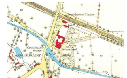
Above: 1864 Ordnance Survey Map

Carrickmines Station (located to the north of Priorsland House) was part of the original Dublin and Wicklow Railway (often referred to as The Harcourt Street Line), which ceased operation in 1958. It is a three-bay two-storey hipped roof structure having a moulded arch feature over the doorway. The former lean-to canopy to the rear elevation has been infilled to internalise the space. The building, although vacant, is in a reasonably good condition, and retains many original architectural features. One such feature is a former water tank, a remnant from the steam age.