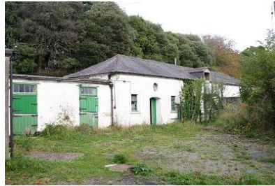
Above: Stables on western side of yard