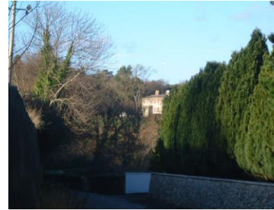
Above: Glendruid from Lehaunstown Lane