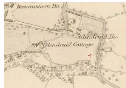
Above: Glendruid Estate, First Edition 6" Ordnance Survey Map, 1843

Within the attendant grounds of the original estate was Brennanstown Dolmen. The Dolmen is located close to the Carrickmines River, and has a very impressive capstone, which weighs 45 tonnes. The Dolmen is no longer within the Glendruid landholding. Further details of the Dolmen, including a photo, are in Part 1 of the appendix.