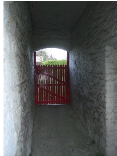
Above: Entrance from stable yard to gardens

The stable yard at Priorsland is one of the best surviving examples of its type in the County comprising a variety of buildings including stable building with timber boxes, a range of carriage sheds and two single-storey cottages. As stated previously there are many examples of how these types of structures can be successfully adapted without compromising their historic and architectural character.