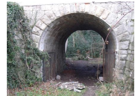
Above: Pedestrian undeTIIs close to Brennanstown Luas stop

The Second entry 332 is a pedestrian undeTIIs, which originally passed under the Harcourt Street railway embankment (now under the Luas line) and connected Glendruid to fields to the south.