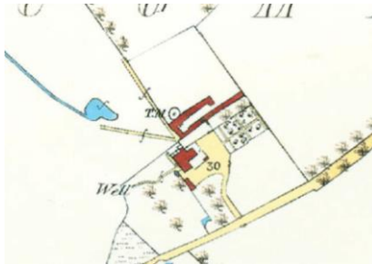
Above: Ordnance Survey Map, 1864