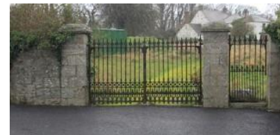
Above: Entrance gates with views towards Lehaunstown Park

This area includes Lehaunstown Park house, entrance gates, avenue and associated out buildings. Historically and architecturally, this is the most important area of the entire site. The entrance driveway is carefully aligned to offer glimpses of the house on approach. No development should be permitted between the entrance gates, driveway and the house as this would destroy the historic relationship.