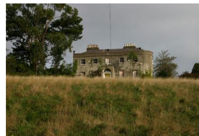
Above: View of front of Glendruid

The house itself is five-bay two-storey over basement with a projecting entrance porch, and a bow on its eastern side. It is set on an elevated site within its own mature grounds overlooking Carrickmines River Valley. The house is accessed via the original gated entrance, which includes a single-storey gate lodge. There is an interesting range of outbuildings to the rear of the house, which are accessed through a tall granite arched gateway. The site is bounded by a combination of high stone walls, mature trees and hedges, giving it a great sense of enclosure.