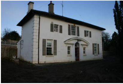
Above: Southern elevation of former station