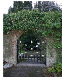
Above: Entrance to walled garden

This area is the walled garden located to the north of the house. It contains formal hedges of yew, box holly, beech, and fruit trees and is enclosed by high brick walls. There is a pre-existing rail order, which could result in the loss of the garden and its incorporation into the Carrickmines park and ride facility. To date the scheme has not been put into operation, with permission recently granted for a temporary car park in the former paddock area to the east of Priorsland House.