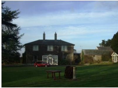
Above: Eastern elevation of Priorsland

The lands around Priorsland can be divided into three Character Areas. These areas are identified as follows: