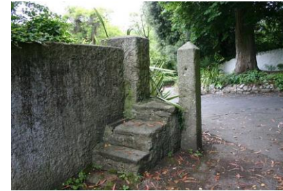
Above: Stile to rear of Cherrywood House

The Cherrywood area has been largely untouched by modern development and hence it has a very rich architectural, historic, social and agricultural heritage. There are a number of miscellaneous items of heritage interest such as street furniture and agricultural features whose retention should be incorporated into any development proposal.