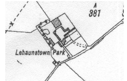
Above: Ordnance Survey Map, 1937