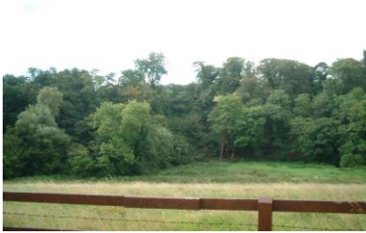
Above: View from the front of Glendruid