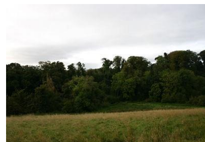
Above: Southern view from Glendruid to be protected