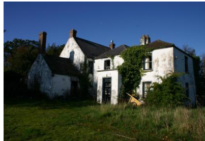
Above: Southern elevation of Lehaunstown Park