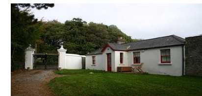
Above: Glendruid Gate Lodge