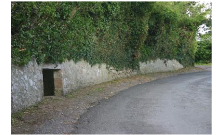
Above: Possible well, Lehaunstown Lane

There are two surviving notable entries from the Industrial Heritage Survey located in the Cherrywood SDZ boundary namely numbers 992 and 632. Number 992, which is entered as a possible well. This is a recess in the wall on the south side of Lehaunstown Lane in the vicinity of a sharp bend. The Archaeological Study on RMP 026-127 concluded that "A well built into the northern boundary wall of the road, to the northwest of the lane entrance, was probably constructed when the road was realigned in the late 19th /early 20th century." This may have been a superstructure over a natural spring to retain access to the spring once the road was realigned. There is no holy well tradition associated with this well however, given the proximity to the Tully ecclesiastical complex this should not be ruled out.