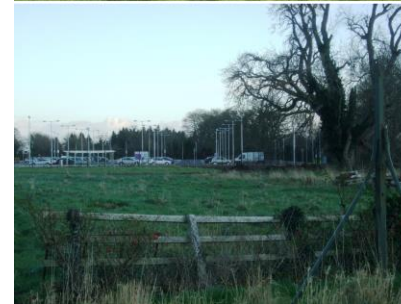
Above: paddock area to the front of Priorsland, prior to the insertion of the temporary car park at right