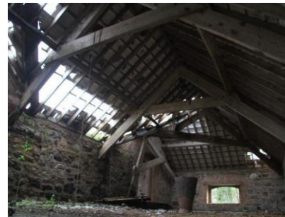
Above: Hay loft with A-truss timber roof

From the mid 19th century the house and lands have been in agricultural use. This history can be traced in the Ordnance Survey Maps of the site, which show the development of extensive ranges of out buildings. The only surviving structures comprise an L-shaped two-storey range. They are two-storey in height of granite rubble construction with red brick dressing the window and door openings. There are not many examples of this extent and quality remaining in Dún Laoghaire-Rathdown.