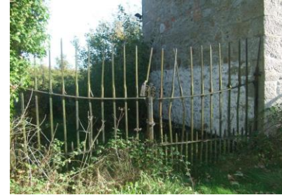
Above: Gate to farm complex

As with those at Glendruid and Priorsland, there is potential to conserve and adapt these buildings to provide new uses.