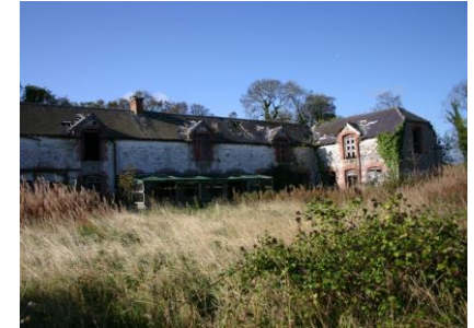
Above: View of northern end of outbuildings