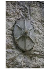
Post box and ironwork adjoining entrance to Glendruid