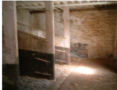
Above: Interior of stables with cobbled floor

There is potential to conserve and adapt these structures to provide new uses. There are many examples of how these types of structures can be successfully integrated into a new development without compromising their architectural and historic character. For example, in Castlecomer in County Kilkenny, similar structures have been converted to a craft village. While in Narrow Water Castle in County Down, the original stable complex has been converted to self-catering accommodation retaining the original stalls as room dividers.