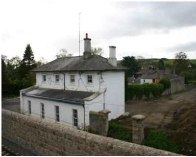
Above: Northern view of building

While the station building remains, it has lost its original context. The line of the original track is now part of the extension to the Luas Line B1. A number of associated elements were removed to make way for the Luas works. These include the original railway bridge that carried Glenamuck Road, and the granite bullnosed coping stones from the platform edges. The latter remain in a field to the south of Priorsland House.