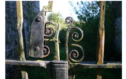
Above: Details of ironwork on gates