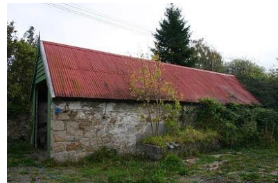
Above: Granite structure on northern side of stable yard