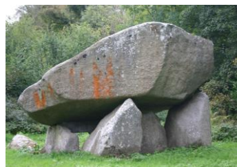
Above: Brennanstown Dolmen