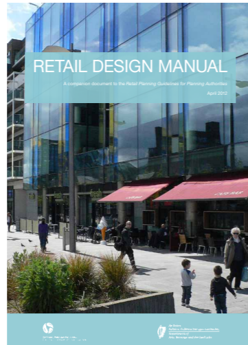
Retail Design Manual

The Retail Design Manual is a best practice guide for new retail development. It is intended to provide a planning framework for new retail development in a way which meets the needs of modern shopping formats while contributing to protecting, supporting and promoting the attractiveness and competitiveness of town centres as places to live, work, shop and visit. The Manual identifies a series of urban design principles that should inform the preparation of design statements for new retail development. Retail development proposals within Blackrock will require to be prepared in accordance with these principles.