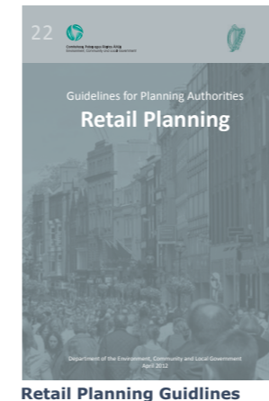
Retail Planning Guidelines