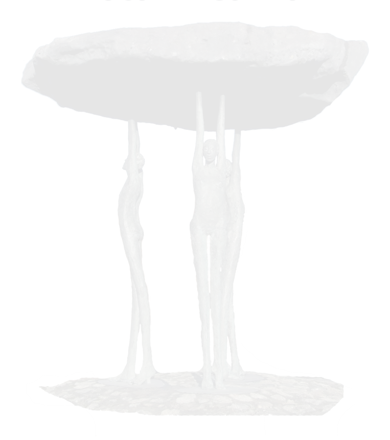
Blackrock Local Area Plan