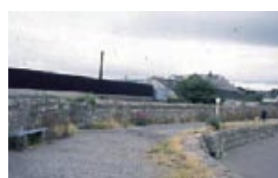
Corner of 2nd and 3rd kants.