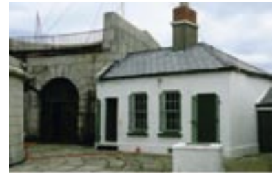
Guard House and Officer's Quarters.

Roof: Hipped natural slate roof with central rendered chimney. Chimney has been inappropriately extended with red brick but retains its granite capping. Cast iron rain water