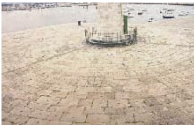
Fine radial granite paving surrounding lighthouse.