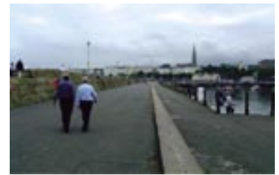
Lower walkway of 4th kant.