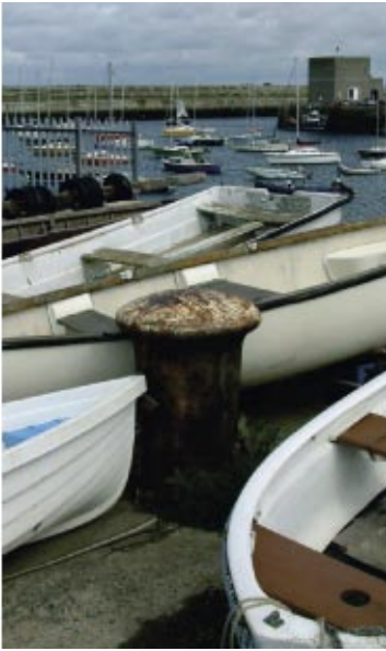
View of boatyard.