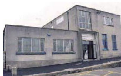
Marine Activity Centre, front elevation.