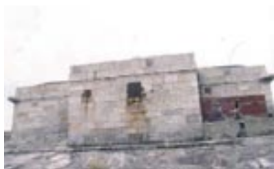
Rear elevation, note corroded tank.