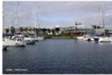
C.I.L. development, viewed from northeast .

A large complex is now being constructed on the Commissioner of Irish Lights site comprising new offices and engineering maintenance and stores. The complex will include an external storage area, waste facility, buoy washing area, and buoy pits on western side of quayside working area. The architects for the scheme are Scott Tallon Walker.