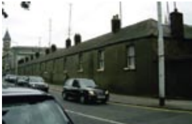
Harbour Cottages, Rear Elevation to Crofton Road, taken from west.