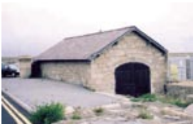
Boathouse, viewed from east.