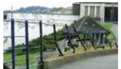
Damaged section of railings requiring replacement. Note general air of dereliction created by the neglected Baths in the background.