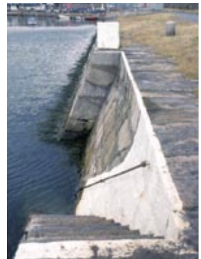
Steps into harbour, 3rd kant.