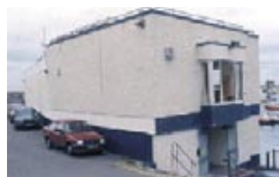
D.M.Y.C., front and side elevations.