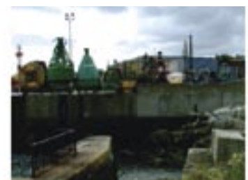
Irish Lights Depot from west.