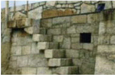
2nd kant, steps.