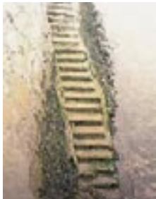
Steps into harbour.