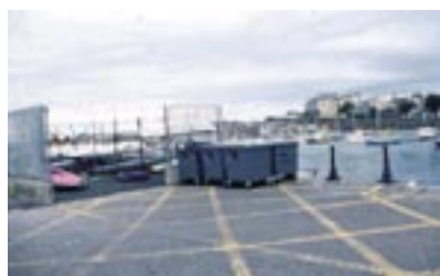
Unsympathetic ground surface to foreground.