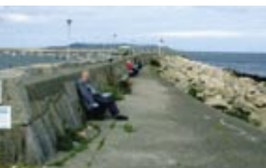
Breakwater area to 4th Kant.

Running from the wharf to the pier end is a line of octagonal granite bollards with steel chains. A concrete kerb stands in front of the bollards on the pier side. Abutting the inner pier wall is a ramp running from the lower level up to the road above. The ground surface is tarmacadam with concrete kerbing to the edge, into which modern, square profile, steel railings are bedded. Parallel to the ramp on the upper level, is a range of early cast iron railings with two square profile horizontal members and having circular members at the joints. The upper level of the pier from the bandstand to the pier end is as follows: The walkway has granite edging and a concrete surface. The ground surface has been patched with tarmacadam in sections. The upper wall is formed from coursed granite rubble with curved concrete coping. A break in this wall occurs before the geographical pointer. At this point access is given to the rear breakwater area where several timber benches are provided. The pointer is a circular structure with coursed granite walls, concrete coping and steel railings. The adjoining public toilets are flat roof, concrete structures abutting the upper pier wall. An opening in the pier wall, flanked by fine, rock-faced, gate piers, provides access to the landscaped park area to the rear. This area stretches from the former Bathing Pavilion on the coast road to the geographical pointer.