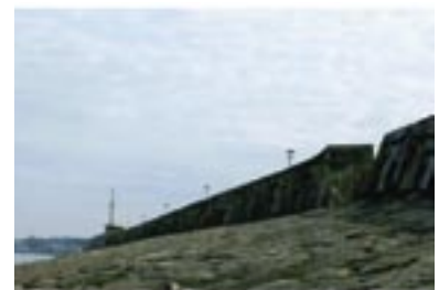
Breakwater to 1st kant.