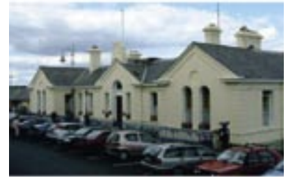
National Yacht Club.

The area in front of the Royal St. George Yacht Club has a tarmac surface and is marked for car parking. Several Pay and Display machines line the pavement. A pavement runs in front of the yacht club, with concrete flagstones and wide granite kerbing. A planted embankment with concrete plinth wall encloses the car park to the south. The road is at a higher level from the car park. Trees line the wide concrete pavement with granite kerbing. The original octagonal granite bollards with cast iron chains extend from the former site of the Victoria Monument to the termination of the pavement. A break in the bollards occurs to provide access to two flights of concrete steps flanking the railway tunnel that runs beneath the road. This tunnel was originally used by trains making the connection between Dun Laoghaire Station and Carlisle Pier. There are modern steel railings to the steps. The original cast iron railings survive to the side. The railings to the west are damaged towards the end with several of the horizontal sections missing. They stand on the original coursed rubble walls with granite coping. Temporary galvanised steel railings stand at the entrance to the tunnel. The area is quite dilapidated.