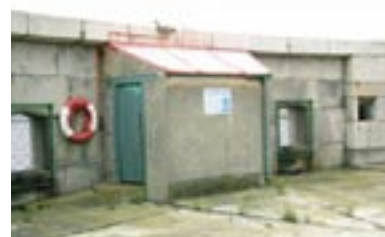
Concrete shed structure.