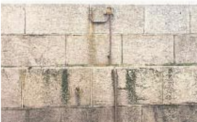
Fine stonework with inappropriate strap pointing.