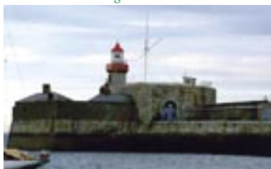
View of Battery from inside harbour.