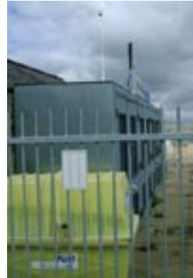
Boathouse, fuel depot to north elevation.