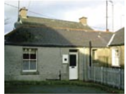
Harbour Cottages, Front Elevation, house to end of terrace.