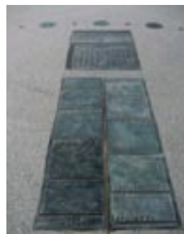
Analemmatic Sundial, Berth No.1, East Pier.