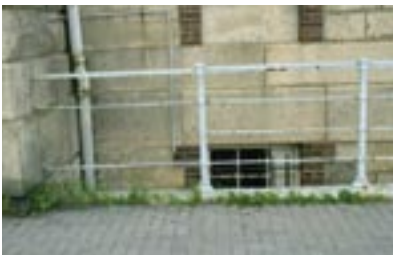
Detail of front site of F.C.A. building showing railings and modern brick pavers.