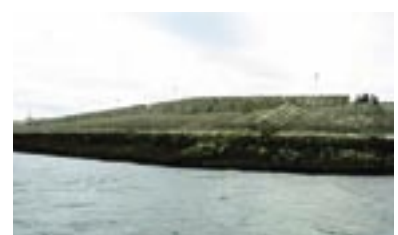
Breakwater showing granite cutwater.