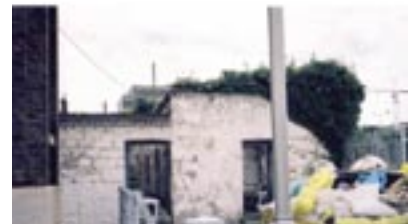
Coastguard cottages, outbuildings.