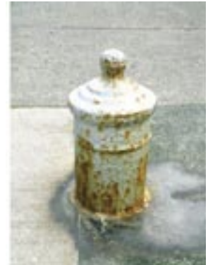
Cast iron mooring post. Note extensive rusting.