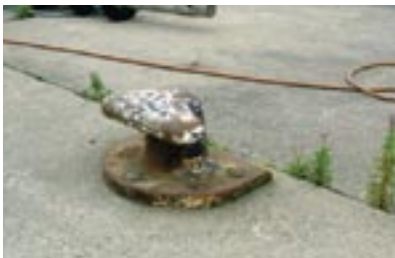
Mooring post, Carlisle Pier.