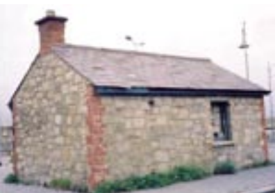
General view of Rocket House, note vegetation growth to base.