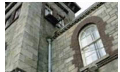
Coastguard Station, F.C.A. building, detail of front elevation.