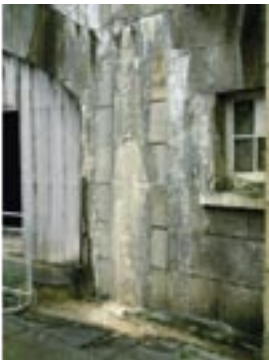
Detail of Battery Structure. Note extensive calcium deposits.