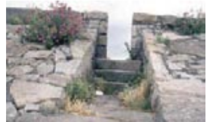
Opening in upper pier wall, 3rd kant.