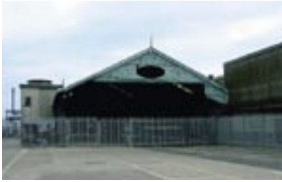
Front elevation of warehouse, Carlisle Pier.