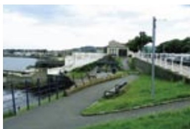
General view of East Pier Gardens.