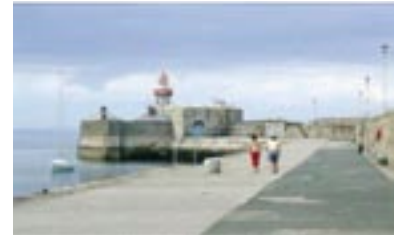
View of East Pier Battery.

Beyond this stands a structure, built from four stepped courses of granite blocks, jutting out at right angles from the breakwater. Wall mounted plastic dog litter bins and lifebuoys are