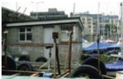
First structure abutting wall.