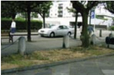
View of street showing octagonal granite bollards particular to the Dun Laoghaire Harbour Area.