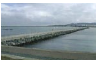
Breakwater, 3rd kant.