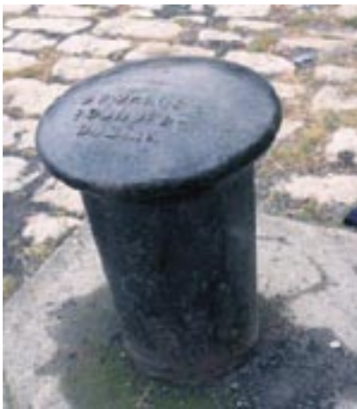
Cast iron bollard, 1st kant.

The granite walls are generally in good condition. Joints have been repointed over the years using cement mortars which is accelerating decay of granite, in particular at the arrises. There is extensive ribbon pointing which has been continued recently with fresh pointing. There is also an extensive amount of open joints requiring pointing. Concrete repairs and stone replacements have been carried out in several locations. Much of the iron and metal handrails, steps, posts, ladder fixing brackets, etc, are rusting and in poor condition with staining on stone from iron oxides and stone broken away due to expansion of iron in some instances. In general ironworks are in poor condition or inappropriately designed. The railing around the Motor Yacht Club yard is quite crude and in relatively poor condition requiring painting or replacement. Ground surfaces are inappropriate in places, in particular where concrete and tarmac cover historic granite paving. Concrete surfaces are fractured. Despite an assortment of bins, litter is a problem in this area, particularly in summer months when activity is increased. There is extensive graffiti to the concrete walls at railway bridge. Barbed wire along roof of Irish Youth Sailing Club is unsightly.