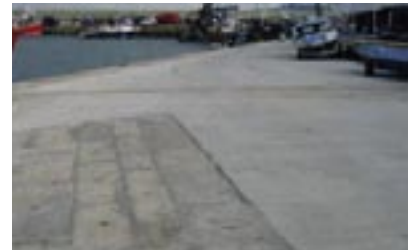
Original granite paving.