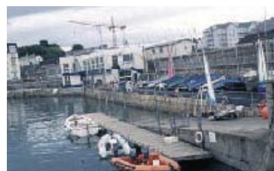
D.M.Y.C., boatyard to rear.