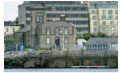
Coastguard Station, view from harbour.

Composition: Terrace of eight two storey, two bay houses, built c. 1845, with granite walls, pitched slate roofs and red brick dressings, the complex is terminated at north end by F.C.A. Building. The two houses to the south end project by approximately two metres on the eastern elevation. Running parallel to the west elevation of the houses a range of single storey outbuildings, now in a derelict condition.