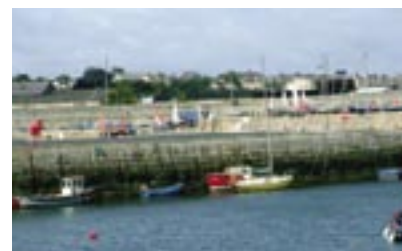
Old Pier, viewed from north.