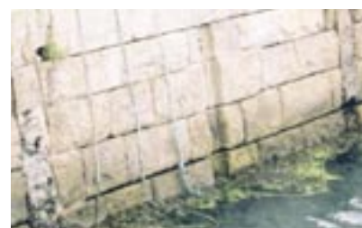
Detail of Quay Wall, Old Pier.