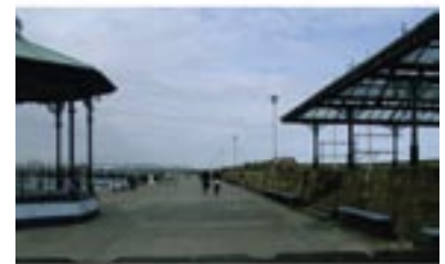
Bandstand and East Pier Shelter.