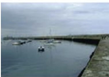
View of 2nd and 1st kants.