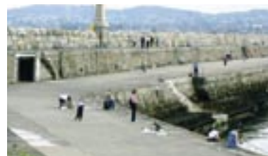
General view, corner of 2nd and 3rd kants.