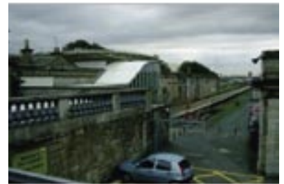
View of station from Brasserie na Mara.