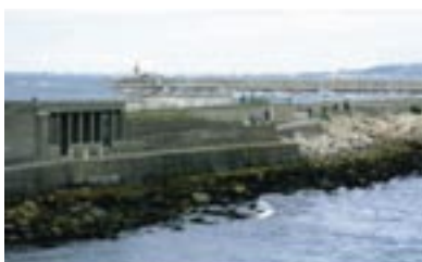
Pavilion No. 1.