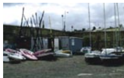
Boatyard, temporary structures to southeast corner.