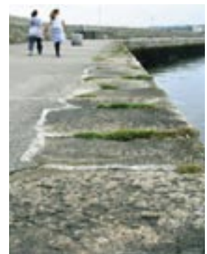
Edge of lower walkway. Note vegetation growth to joints.