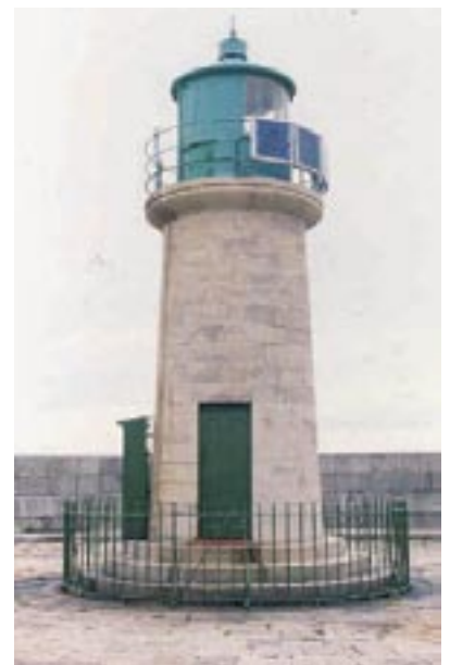
Red Flash Lighthouse.

Roof: The roof is conical formed in metal with a finial at the apex, which acts as a lightning conductor. Copper earthing cable runs down the side of the lighthouse and terminates in the ground.