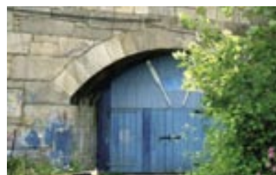
Archway to Rowing Club.