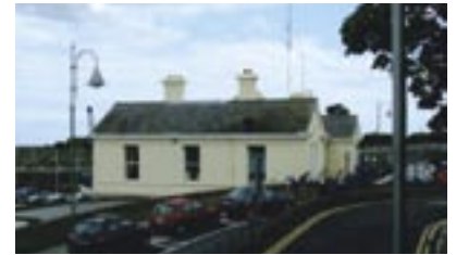
View eastwards towards National Yacht Club.