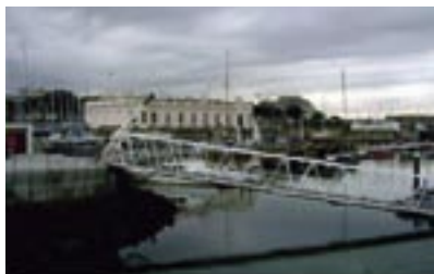
Articulated bridge, Dun Laoghaire Marina.