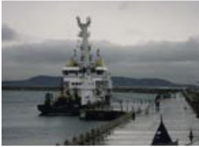
The Granuaile berthed at Berth No.1.