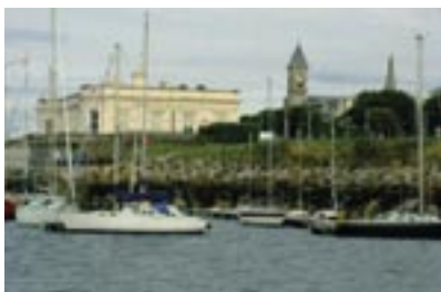
Royal Irish Yacht Club.