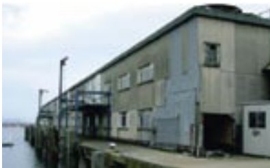
West elevation, ferry terminal.