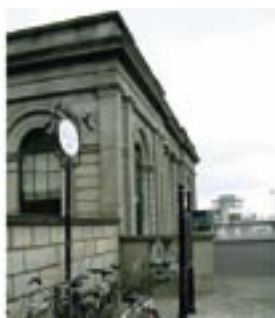
Brasserie na Mara, originally entrance pavilion.