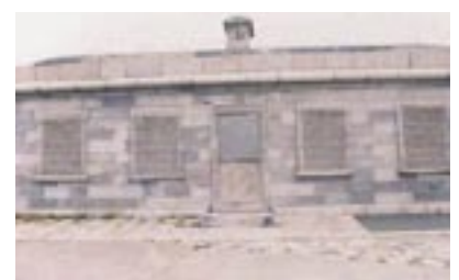
Lighthouse keeper's cottage, front elevation.