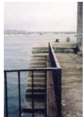
Trader's Wharf, west end.