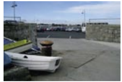
New concrete surface roadway linking the boatyard to Trader's Wharf.