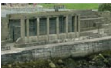
Pavilion No. 2.