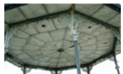
Detail, bandstand soffit.