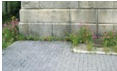
Detail, F.C.A. building, fine granite masonry. Note extensive vegetation growth.