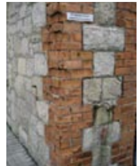
Detail of brick quoins and surround to door opening.