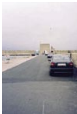
Trader's Wharf, south side.

The Coal Harbour is the oldest part of Dun Laoghaire Harbour, having been built in the eighteenth century. The Coal Pier juts out in a NW direction, enclosing the Coal Harbour. Trader's Wharf runs parallel to the Coal Pier further north. These small harbours are used to moor small yachts and dinghies and the outward harbour also accommodates fishing trawlers. Improvement works were carried out, c.2000, around the Coal Pier. This included resurfacing with tarmacadam, the introduction of some kerbing and footpaths and the reclamation of land to either side of the Coal Pier. A single lane road runs parallel to the railway line, forming the southern boundary of the Coal Harbour.