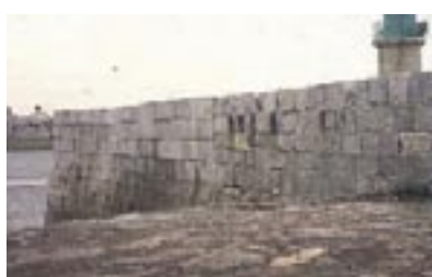
Outer granite wall to rounded pier end.