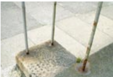
Detail, steps 2nd kant.