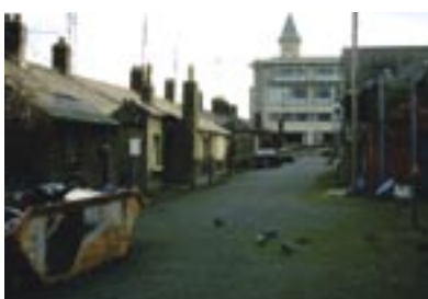
Harbour Cottages, Front Elevations, viewed from west from end of terrace, with Civic Offices in the background.

• Pointing: retain any original sound mortars. Rake out replacement cement mortars and repoint using hydraulic lime mortars based on analysis of historic mortars. Point all open joints following similar approach.