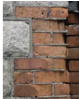
Detail of spalling brickwork to corner.