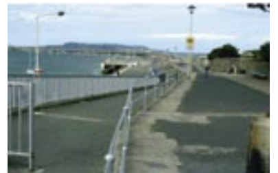
Entrance to East Pier from road.