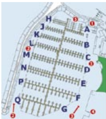
Map of Existing Marina