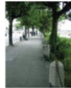
Range of original octagonal bollards to pavement.