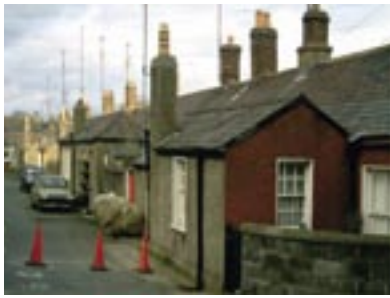
Harbour Cottages, Front Elevation.