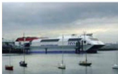
H.S.S. ferry at terminal.