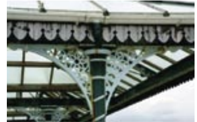
Detail, East Pier Shelter.