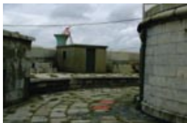
Machine room located on gun position.

Interior: Barrel vaulted brick ceilings throughout. Suspended timber floor to first space. Granite flagstones to second space. Granite steps lead downwards to third space, which has exposed brick walls. Granite flagging to ground surface. Square headed door opening with granite steps leading downwards. This space originally contained the shifting room and magazine.