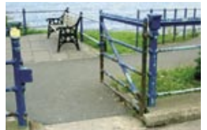
Entrance to East Pier Gardens from road. The railings clearly require maintenance.