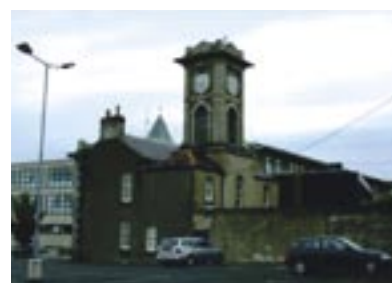
Harbour Master's Lodge, west elevation.