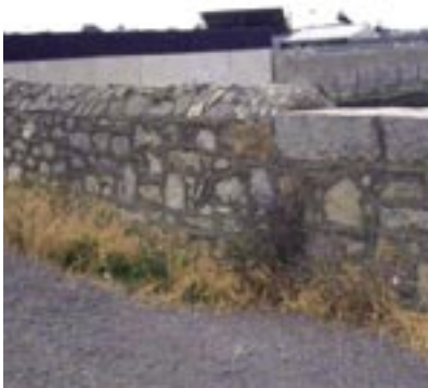
Detail, junction of upper walls, 2nd kant. Note poor concrete strap pointing.

A section of the lower walk level has been railed off as a boat store for the Motor Yacht Club. A low concrete rising wall supports a galvanised metal boundary fence. The ground surface within the boat store compound has been covered with black tarmac to the granite coping stone edge which is uncovered. Greenish/blue angular chippings have been laid on the walkway surface outside the railings. 2 no. metal bollards with a metal chain between them are located beside the entrance to the boat compound and restrict vehicle access further out along the pier. The lower level of the pier is finished with concrete brick paving in a herringbone pattern from the entrance to the boat compound, adjacent to the 1st kant, to the beginning of the pier.