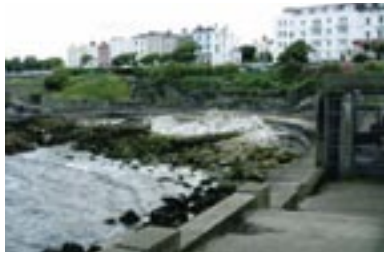
General view showing grotto style landscaping to south.