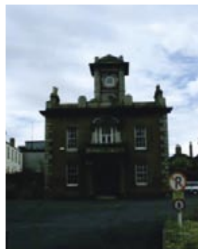
Harbour Master's Lodge, north elevation.

♦ Stone: remove corroded iron fixings where these are causing decay of the stone and replace with non-corrosive material and/or carrying out appropriate priming and surface treatment of ironworks to be retained; monitor and treat organic growth with approved biocide as necessary.