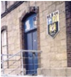
F.C.A. building, entrance.