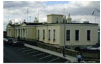
Royal St. George Yacht Club.

Openings: Timber clerestory windows to east elevation at ground floor level. Timber picture windows, in poor condition, to west elevation. Ribbon windows run along the west and north elevations at first floor level. Three entrances to west elevation, ground floor level, two which have been boarded up. The third entrance has timber double doors. At first floor level there are four openings, two open out onto the steel structures and two sliding double doors, timber clad, for loading goods.