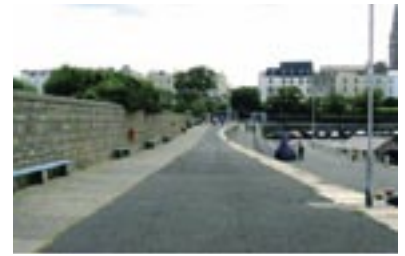
View of 4th kant looking southwards.

The East Pier Battery, Anemometer, Boyd Memorial, East Pier Shelter, Bandstand and public toilets.