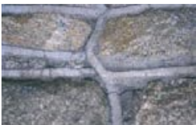
Detail of poor cement strap pointing to coursed rubble, upper wall, 2nd kant. This is accelerating decay of the stone.

The upper wall is higher with a rounded granite capping for approximately half the length of the 2nd kant before it drops to the standard height of approx. 4.5 feet which continues to the end of the 5th kant. There is one access ope leading via steps down to the outer breakwater area and beyond to a small outer harbour area formed by a stepped concrete wall running around the area West of the 1st and 2nd kants of the West Pier and known as the 'gut' area. There are 2 no. sets of steps leading down to the water from the lower walk level, at either end of the 2nd kant. These are highlighted with white paint and are set into the pier wall. There is one set of steps, 7 no. only as the level difference decreases along this kant, between the upper and lower walk levels. The bottom step has been finished with concrete bricks identical to those on the lower walk level, the latter which are lined with road markings – yellow box and yellow lines – as cars are allowed in this area.