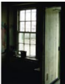
Interior Guard House

The Battery was built 1859-1860 around the stone lighthouse that had been built in the previous decade. Its defensive curved granite wall was designed to deflect canon balls. The lighthouse dominated the Battery courtyard. It forms the centre of the radiating circles which form the plan of the Battery. There is a high level of craftsmanship in the stonework throughout. The buildings contained within the circular Battery include, a soldiers' quarters, guard house, officer's quarters, gun powder magazine, machine room, w.c.s and the lighthouse. The entrance is from the East Pier lower walkway through an arched opening with timber double doors.