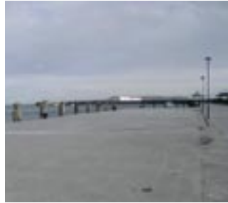
Detail of ground surface.

Berth No.1, originally built to berth ships, was provided with a new, high performance surface. The Berth is constructed in three sections - the two, outer dolphins have been surfaced with the same concrete mix as the main Pier structure and the central, infill panel has been resurfaced in a special, more flexible variant of the main Pier concrete mix, due to the limited depth available arising from the structural form of this section of the Berth.