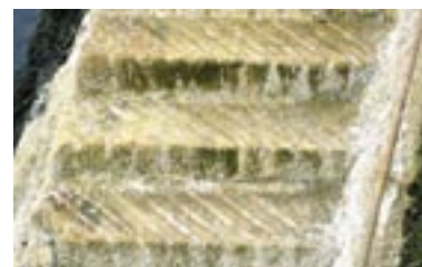
Detail of steps into harbour.