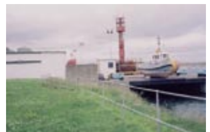
Irish Lights Depot viewed from grassed area.