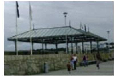
East Pier Shelter.

General: A flight of concrete steps with steel railings give access to the stage area. The steel railings continue around the stage. The ground surface consists of timber deck.