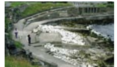
View of East Pier Gardens. The network of concrete paths date to the first half of the last century.