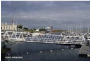
C.I.L. development, viewed from Marina.