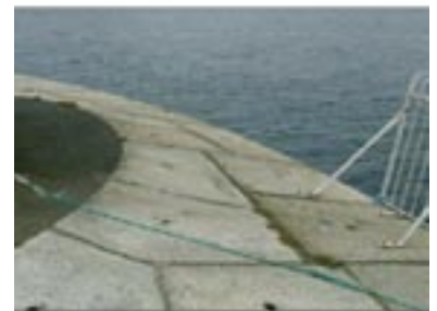
Detail, masonry of Battery walls.