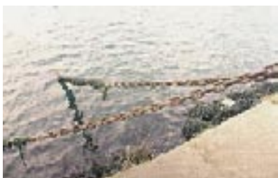
5th kant, rusted iron fixings.

The pier structure is stepped with the level dropping towards the harbour enclosure. There are two main levels. The upper, narrower level has a slightly battered granite wall on its outer, north facing, side. This wall, rising to approximately 5 feet above ground level is rubble granite with a roughly dressed granite block capping. There is one opening onto the outer breakwater of the pier and this has large roughly dressed jamb stones. A very finely dressed granite building terminates this level at the pier end. The ground surface is quite uneven with rough stone coming to the surface due to weathering. It has been surfaced recently with loose aggregate. The lower level is just over 23 feet wide, suitable for vehicle access for maintenance. There is one set of stone steps leading to the upper level. An inner path runs along the retaining wall and is demarcated from the rest of the surface with a granite kerb. The ground surface is earthen with a grassed section. Loose aggregate has been laid on the earthen areas recently.