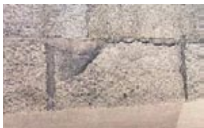
Cement joints causing stone decay.