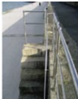
New stainless steel railings to upper level of East Pier.