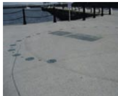
Analemmatic Sundial, Berth No.1, East Pier.