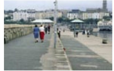
General view along 4th kant.

A second, more substantial wharf is located after the bandstand. This wharf, known as Berth No.1, dating to the middle part of the last century, is formed of reinforced concrete supported by massive piers and reinforced, triangulated sections. Timber buffer piles and four cast iron columns line the west edge of the wharf. Modern steel uprights with chains run along the north and south sides of the wharf. A flight of concrete steps with iron railings are located parallel to the wharf at the inner pier wall. The railings are corroded at the joints.