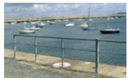
Trader's Wharf, northwest end.