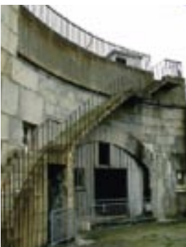
Partially cantilevered granite steps.