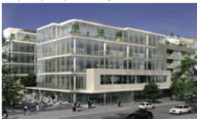
View of scheme from Crofton Road looking westwards.