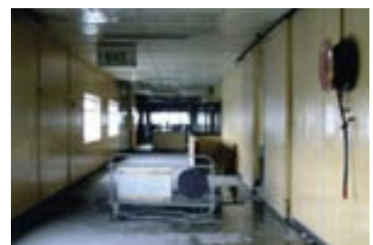
First floor west corridor of ferry terminal.