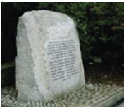
Granite block memorial.

Opposite the tunnel entrance, the yacht club boundary wall terminates and the bend is continued with a galvanised metal railing. The railing, fixed to a concrete plinth, is rusting excessively at all joints. The entrance gate to Carlisle Pier is rather unsightly. The railings and gates are rusting, particularly at joints. The road splits into two levels in front of the passenger entrance to the former ferry terminal. A concrete block wall with a simple steel railings separate the two. The R.N.L.I building is accessed via the lower roadway. This is a single storey above basement, rendered building with a hipped, tiled roof. An open shelter with a cantilevered, concrete canopy is located to the south, with the roof lying roughly flush with the public road above. ( Described more fully in 'Site' section of Carlisle Pier ).