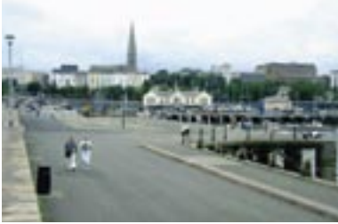
View from upper walkway of 4th kant with former ferry wharf in the midground.