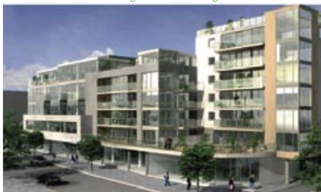
View of scheme from Crofton Road looking eastwards.