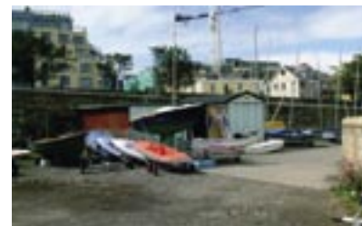
Temporary structures to south boatyard.