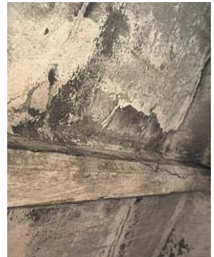
Corroded concrete rib beam to interior.