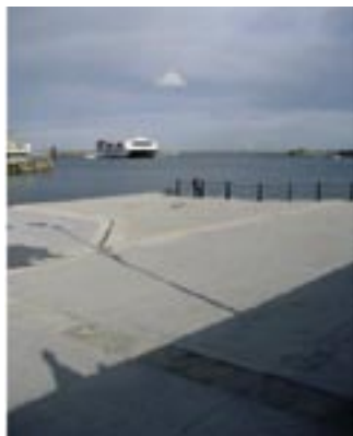
Berth No. 1 and kant 4 viewed from upper level. Note Carlow granite banding between the polished concrete bays in foreground.

A major resurfacing project on the lower level of the East pier has been completed in September 2005. The surface was designed to take impact from maintenance traffic as well as pedestrian traffic. The concrete is made up with a mix of aggregates that includes marine aggregate from Wexford, Wicklow aggregates and crushed seashell. Carlow granite (which is of the same geological formation as the Dalkey/Dun Laoghaire granite used in the original pier) was used in bands to articulate the concrete panels and facilitate the location of expansion joints for the concrete panels. A ten year planning permission was obtained for the resurfacing of the entire East Pier and it is planned to resurface the upper level in 2007/2008.