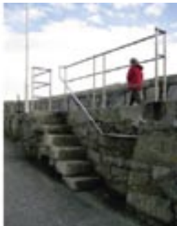
New stainless steel railings to upper level of East Pier

General: The corroded iron railings along the upper section of the East Pier have been replaced with stainless steel versions in a similar profile. The extent of railing was increased to provide a handrail to selected steps between the upper and lower levels, to facilitate easier use of the steps.