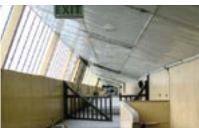
First floor east corridor, ferry terminal.