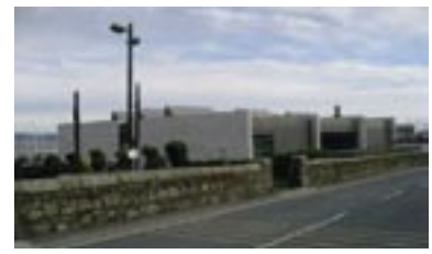
C.I.L. offices under construction November 2006.