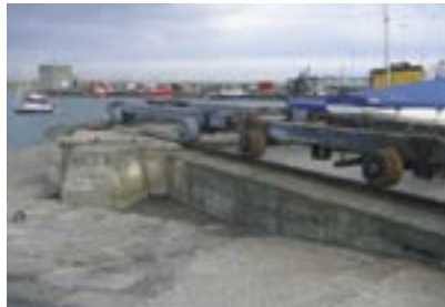
Boat turntable with iron and timber bogey.

General: A programme of works as part of an overall masterplan on the Boatyard commenced in 2006. Works completed to date include the construction of a new concrete surface road linking the boatyard to Trader's Wharf. Areas of existing granite paving were left undisturbed by the works. Improved access for members of the public using the slipway has been enabled by the opening up of a section of the boatyard wall beside the slipway and bounding the car park. Restoration works to the boat turntable have commenced and include the replacement of the timber deck and the reconstruction of a new wooden cradle for the turntable, re-using the original iron fittings of the cradle and its holding arms.