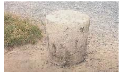
Cut granite mooring post.