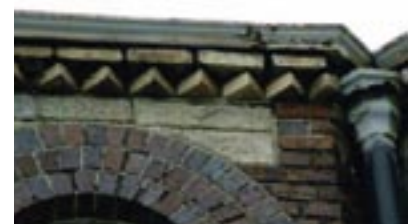
F.C.A. building, brick cornice.