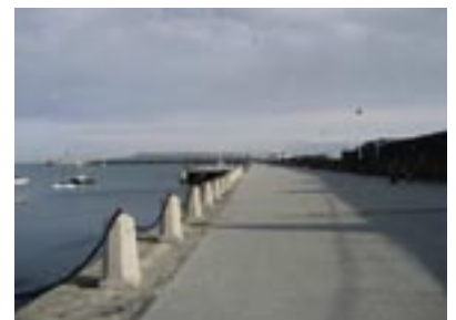
Beginning of kant 4 showing new polished concrete surface and range of granite bollards.