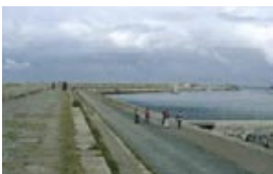
3rd kant, note junction with breakwater.