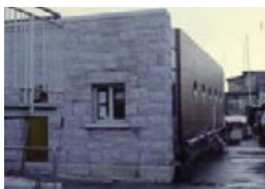
Detail of National Yacht Club extension looking west.