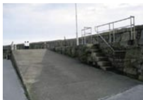
New stainless steel railings.