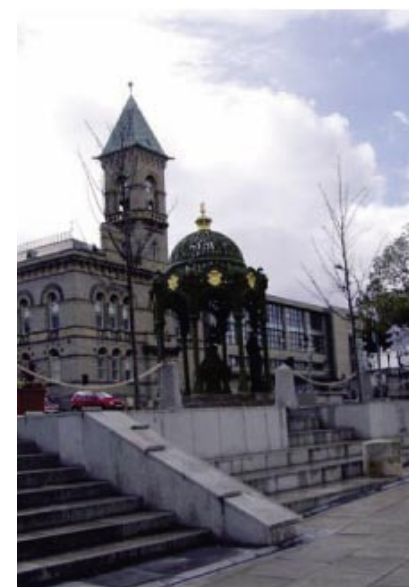
Restored Victoria Fountain with Civic Offices in background.