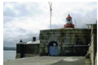
East Pier Battery.