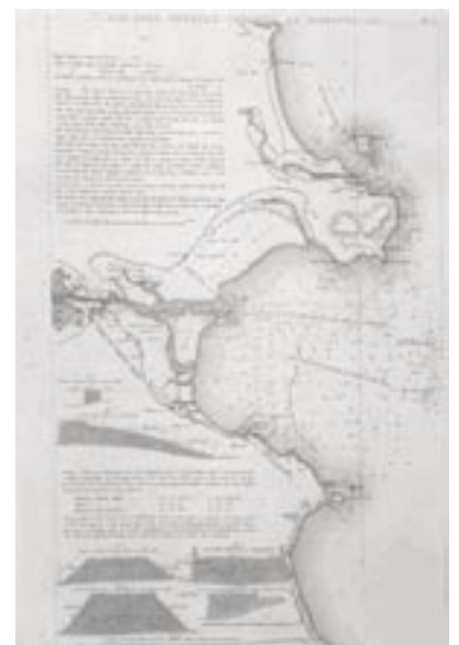
Extract from Sir John Rennie's original drawings and specifications for Dun Laoghaire Harbour.