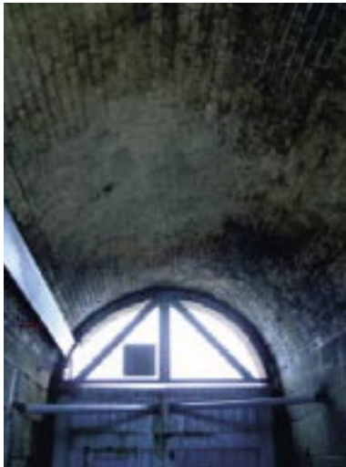
Vaulted brick ceiling to entrance passage.