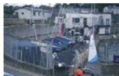
Boatyard and clubhouse D.M.Y.C.