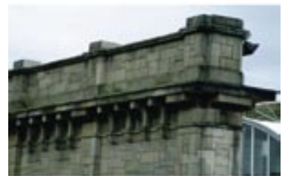
Detail, wall facing ferry terminal.