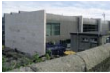
C.I.L. offices under construction November 2006.