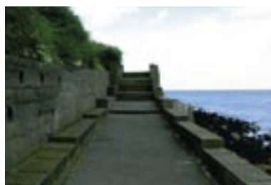
Concrete pathway and steps to north of Gardens.