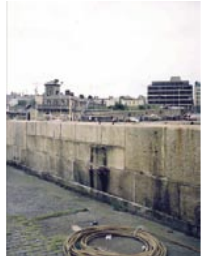
Inner pier wall, Trader's Wharf.