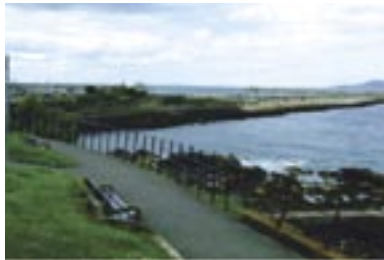
View of East Pier Gardens with East Pier in background.