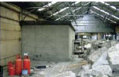
Interior of warehouse, Carlisle Pier.