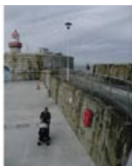
New stainless steel railings to upper level of East Pier.