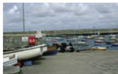
Boatyard, start of slipway, note fine granite paving.