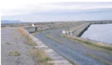
Corner of 4th and 3rd kants.