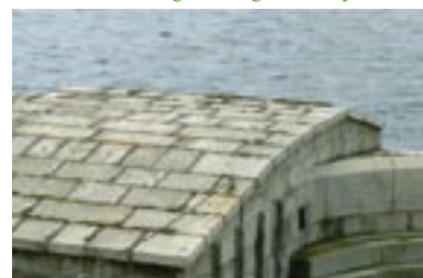
Detail, granite roof to Artillery Store in need of pointing.