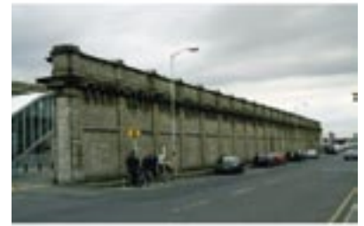
Wall facing ferry terminal.

Importance: None. Condition: Good, Well maintained.