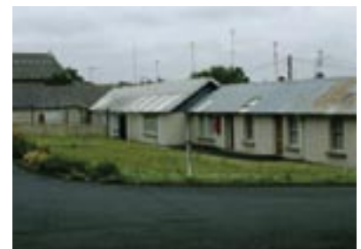
Harbour Company offices.