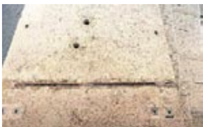
Borehole to granite pier edging.