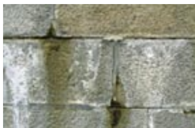
Detail, stonework to Artillery Store showing inappropriate cement strap pointing. The wall is suffering from wide spread water penetration.