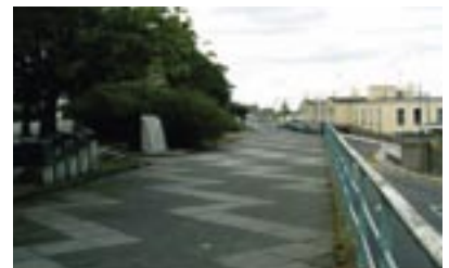
Viewing platform located over parking area.