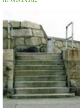
Steps before Bandstand, 4th kant.