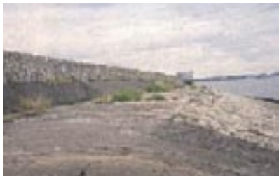
Outer section of 5th kant with concrete platform and granite breakwater.