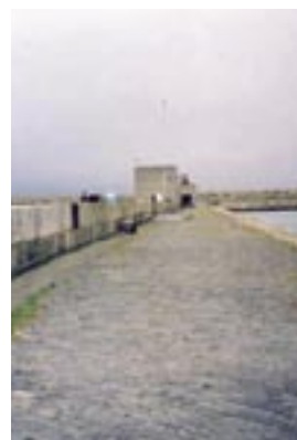
Trader's Wharf, north side.