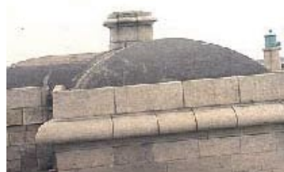
Detail of roof.