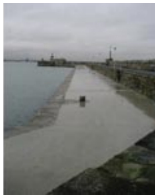
View of kants 2 and 1 with East Pier Battery in the background.