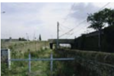
West entry point.