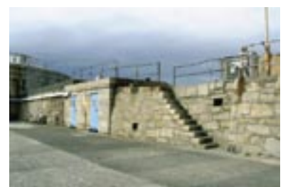
1st kant with view of steps and cut granite structure.