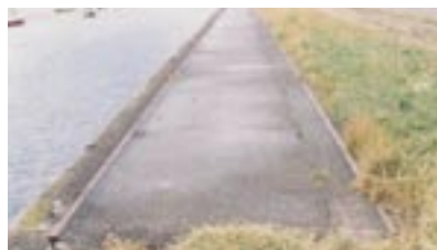
Iron tracks to lower walkway prior to construction of marina breakwater.