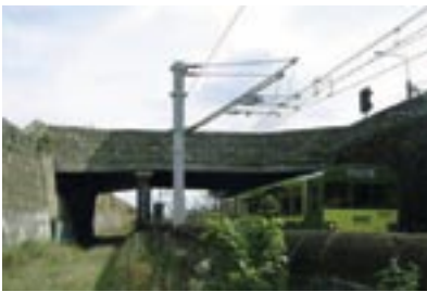
Crofton Road Bridge.