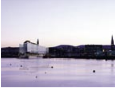
Evening view of proposed development from end of West Pier.