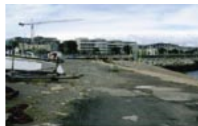
Uneven surface, boatyard.