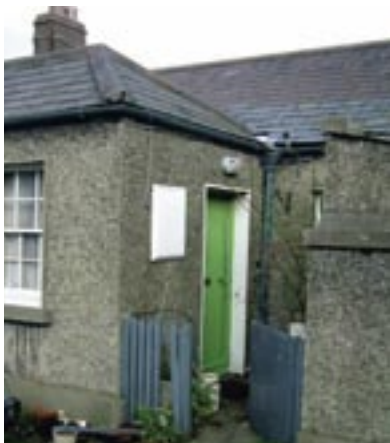
Porch, note fine original window.