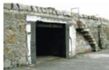
Shelter to 3rd kant.