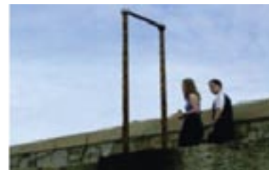
Corroded iron railing to steps, 3rd kant.