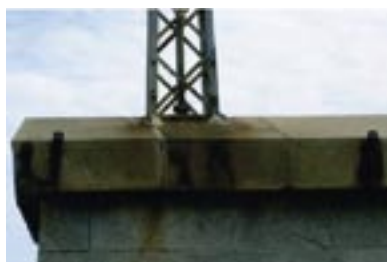
Detail showing rust damage.