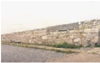
View of two levels of 5th kant – note concrete to upper wall section.

Description: Length: 720 Feet (220 metres); making angle of 145° with 4th kant and bearing E by S1/2S