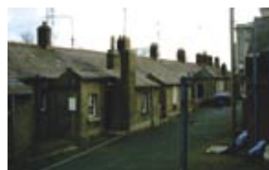
Harbour Cottages, Front Elevations.