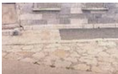
Detail of patchy ground surface in front of structure.