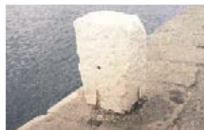
Roughly hewn granite mooring post.