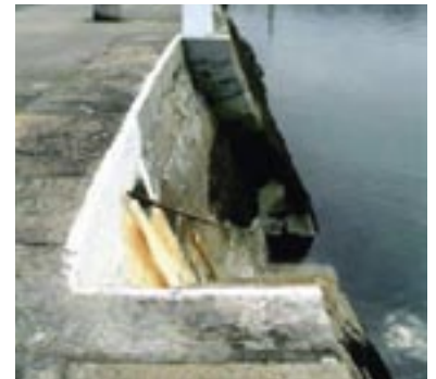
Steps into harbour, 4th kant. Note extensive rust staining from corroding iron handrail and also open joints to stonework.