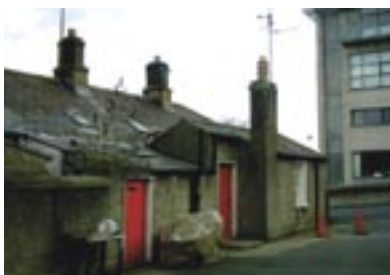
Harbour Cottages, Front Elevations, viewed from west with Civic Offices in the background.