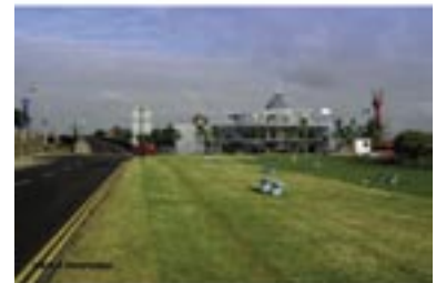
C.I.L. development, viewed from Harbour Road.