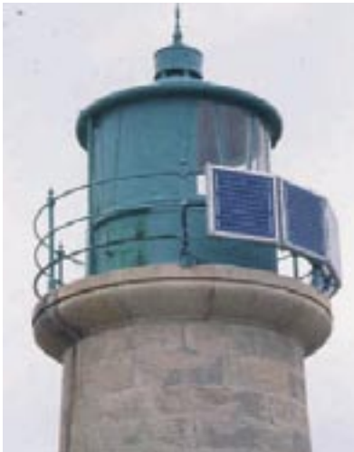
Lantern and walkway, red flash lighthouse.