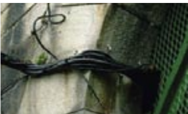
Unightly cables running from entrance passage.