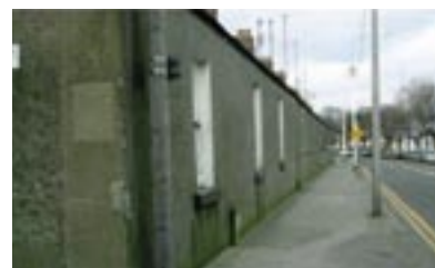
Harbour Cottages, Crofton Road Elevation.