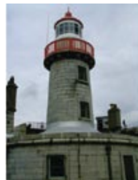
White Flash Lighthouse.