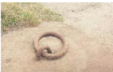
Iron mooring hoop to lower walkway.