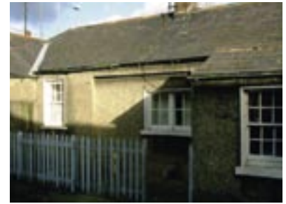
Harbour Cottages, Front Elevation, mid-terrace house, note original sash windows.

• The most recent maintenance shed is in good condition and could be dismantled for re-use elsewhere.