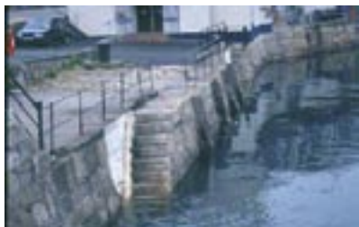
Fine masonry to 1st kant.