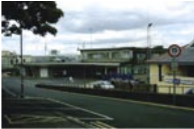
Front elevation, ferry terminal.