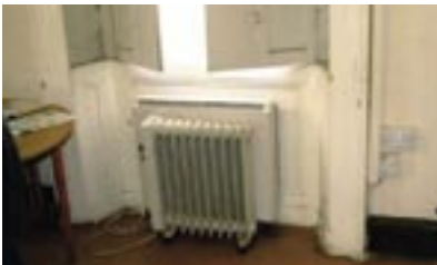
Interior F.C.A. building, window surround and shutters.