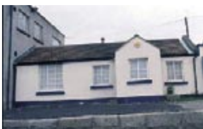
Structure adjoining Marine Activity Centre.