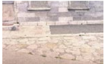
Ground surface in front of Lighthouse Keeper's Cottage.