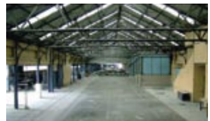
View southwards from interior of warehouse.