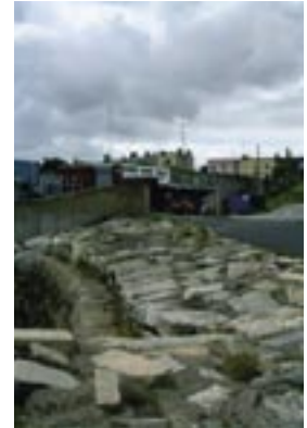
Stonework to quay walls, adjoining boathouse.