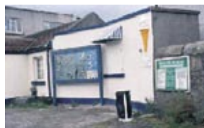
Later annex to side.