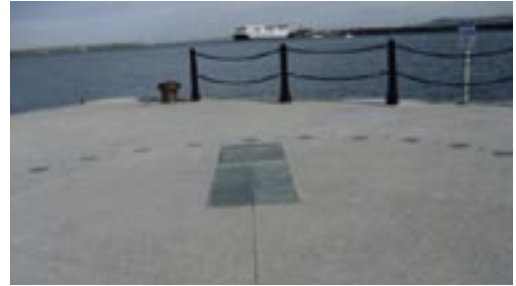
Analemmatic sundial comprising bronze plates sunken into the ground surface.