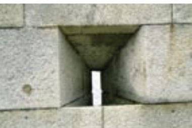
Lancet opening to battery wall demonstrating immense depth of ashlar and quality of masonry work.

goods with central downpipe, having octagonal hopper. Clay ridge tiles.