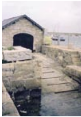
Boathouse, east elevation,