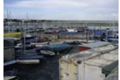
View of boatyard from curved road.