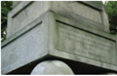
Detail of granite obelisk.