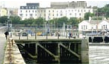
Former ferry wharf, 4th kant.