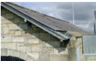
Boathouse, roof detail.