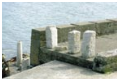
Granite bollards imbedded in concrete adjoining shelter pavilion.