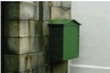
Exterior wall with attached service box. The stonework requires repointing. Note also rust staining from internal iron fixings.