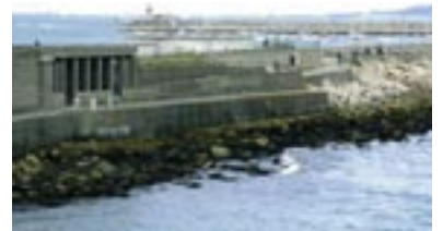
View of East Pier Gardens at low tide showing concrete shelter pavilion and exposed rock armour.