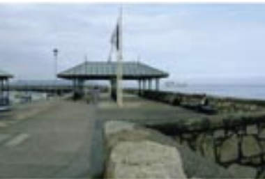
View of East Pier Shelter, 4th kant.