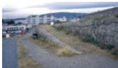
Ramp between lower and upper levels.