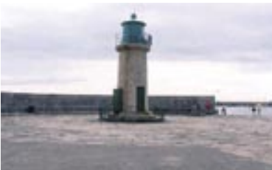
Note poor concrete patch repairs to paving.