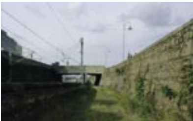
Section west of bridge, looking east.