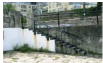
Concrete steps from Coal Harbour to road. Note original granite paving and also extensive rust staining from iron railings.