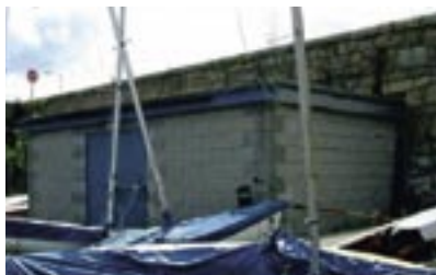
Second structure abutting wall.