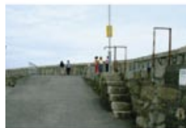
Ramp at corner of 3rd and 4th kants. Note original granite steps.