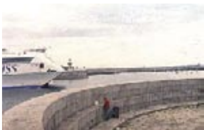
Curved wall of pier end.