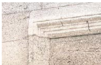
Detail of carved granite door architrave.