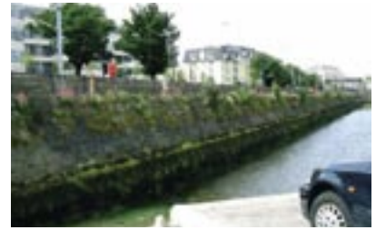
Ramparted wall to road. Extensive vegetation growth is damaging the fine stonework.