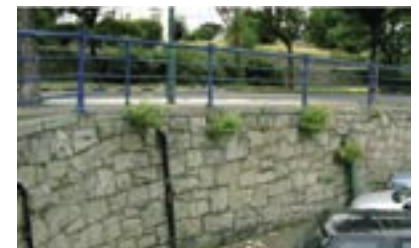
Fine snecked stonework to retaining wall. Note peeling railings and extensive vegetation.