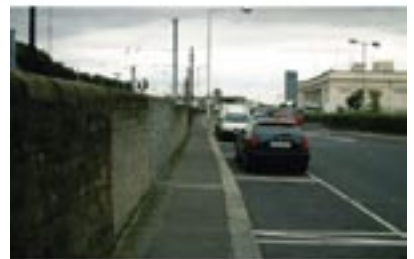
Road running parallel to railway line.