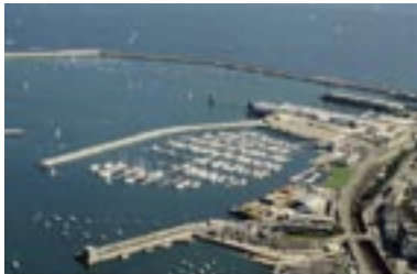
Aerial view of marina.