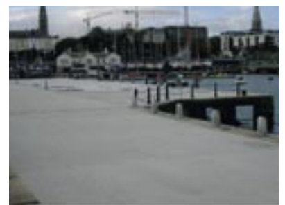
Berth No. 1 viewed from north on upper level of kant 4.