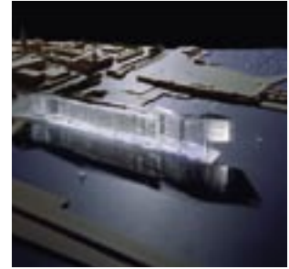
Early model of scheme.

General: The Carlisle Pier has lain disused since the closure of the ferry terminal. An international competition was held in 2003 by Dun Laoghaire Harbour Company for the redevelopment of the Pier. The brief derived from the zoning objective in the Dun Laoghaire-Rathdown Development Plan, as varied in 2002 which states: