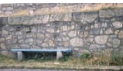
Timber bench with granite legs, an important early element.