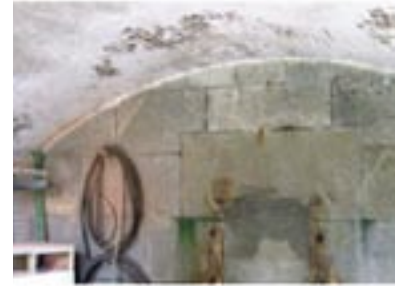
Vaulted area beneath gun platform.