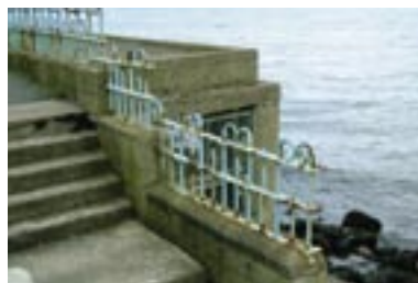
Wrought iron railings to parapet of shelter in need of maintenance. Modest details such as this are an important element of the history of the harbour and its surroundings.