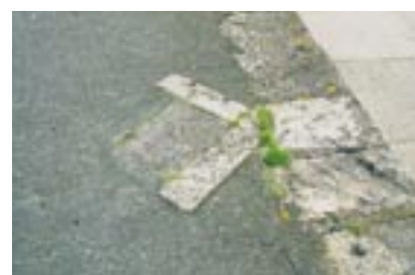
Detail, remnants of granite to 2nd kant, upper walk way. Care should be taken to ensure that historic elements such as this are retained after resurfacing.