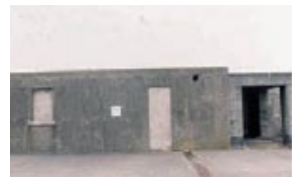
Structure adjoining shelter.