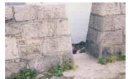
Break in upper wall giving access to rear breakwater. Note inappropriate cement strap pointing.