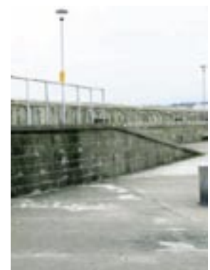
Ramp between levels at corner of 3rd and 4th kants. Note inappropriate concrete facing.