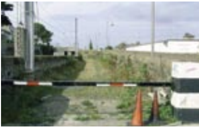
East entry point to Accommodation Walk.