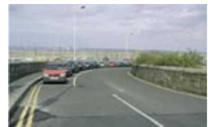
Curved road from south.