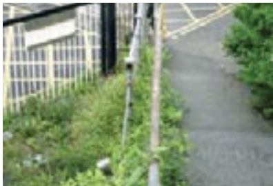
Steps adjoining tunnel. Note range of original railings running parallel to the modern range. The reinstatement of the former is recommended.