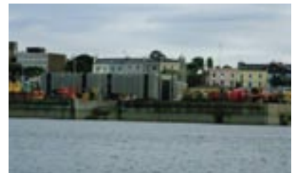
View of Irish Lights Depot from harbour.