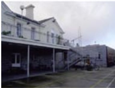
View of original National Yacht Club clubhouse from seaward side, showing 1980’s raised terrace extension and new extension to background.

The National Yacht Club has commenced a programme of refurbishment and expansion of their clubhouse and seaward facilities. The extension, which includes a new boatmen’s office and changing rooms, was designed by architects Cantrell Crowley. The building comprises a single storey annex clad with rock faced stone and timber, with nautical porthole fenestration to the north elevation. A flat roof minimises any disturbances to views at street level above. There are plans to further extend the clubhouse to fill the space beneath the first floor terrace. On the seaward side, the platform and launching slips have been extended.