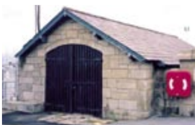
Boathouse, viewed from Trader's Wharf.