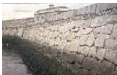
Inner rubble granite wall face.