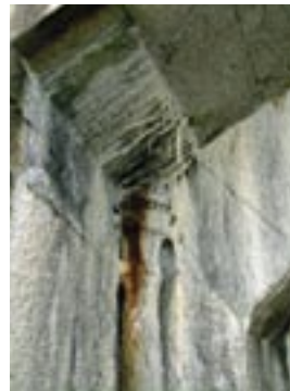
Iron downpipe and hopper encased in calcite deposit.