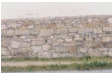
Inner and upper pier walls composed of random rubble.