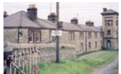
Coastguard station, taken from southeast.