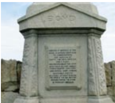
Detail, showing fine carved stone detailing.