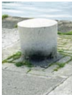
Granite mooring post on 4th kant. Note granite setts.