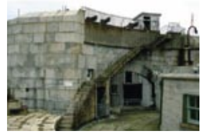
Battery structure with gun platform to roof.

Overall Importance Values for Battery Complex: A (Architectural); T (Technical); H (Historic); D (Design & Detailing); O (Other– Craftsmanship in stonework)