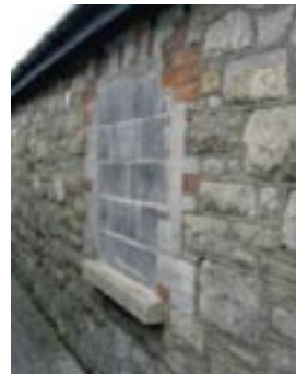
Shored-up window opening to side wall with inappropriate cement based repairs to brick reveals.