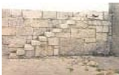
6th Kant, granite steps.