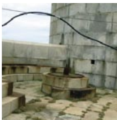
Extensive rust staining to stonework. Note also unsightly cables.