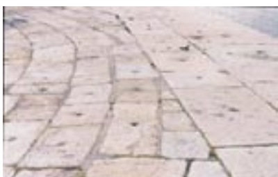
Curved granite paving surface.