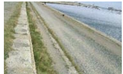
Ground surface, 4th kant.