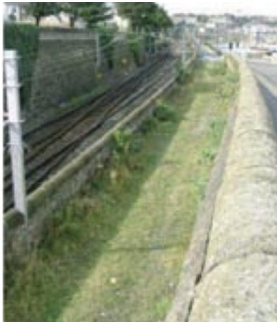
Section west of bridge, looking west.