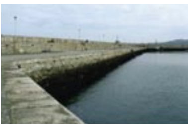
Corner of 1st and 2nd kants.

placed at regular intervals along the inner pier wall for the duration of the pier.