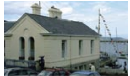
National Yacht Club.