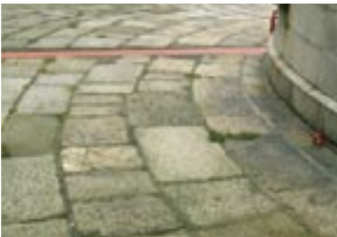
Radial paving with service duct running from entrance passage.