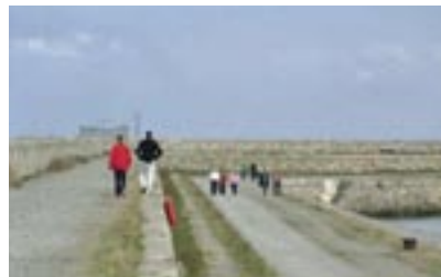
4th and 5th kants.