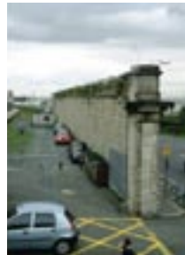
View of station from Brasserie na Mara.