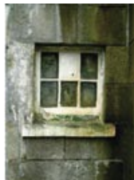
Detail, window to vaulted space.