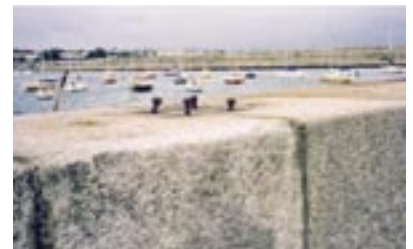
Trader's Wharf, rusted iron fixings, inner wall.