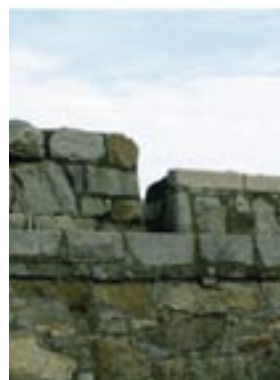
Opening in upper pier wall along 3rd kant.