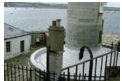
View from upper gun platform.