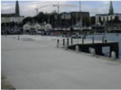
Berth No. 1 viewed from south on upper level of Kant 4.