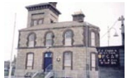
Coastguard Station, front elevation.