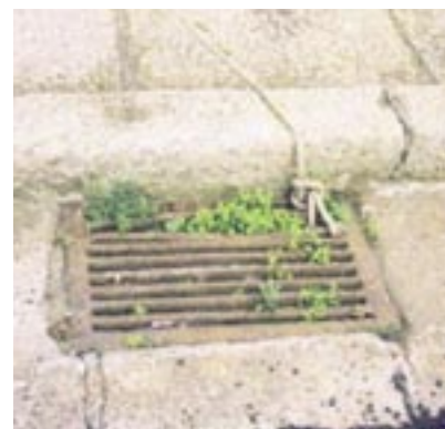
Old Pier, detail of drainage grille. Note fine original granite surround. Details such as this should be preserved.

The stone work is generally in good condition. Erosion is mostly apparent on the top/coping stones and prevalent at stone arrises at joints, in particular where cement pointing repairs have been carried out. Ferric oxides are visible on the faces of many of the granite blocks, possibly from embedded iron and/or the matrix composition of the stone. Vegetation is evident in some of the joints that require repointing. The cast iron railing around the granite steps is badly corroded and this is damaging the stone work. The cast iron bollards are in reasonably good condition but are rusted in parts.