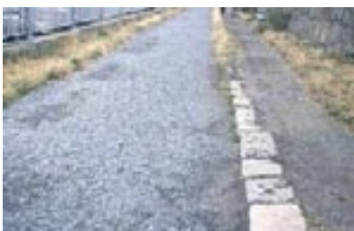
Lower walkway. Any improvements should include the retention of the granite edging to inner pathway.