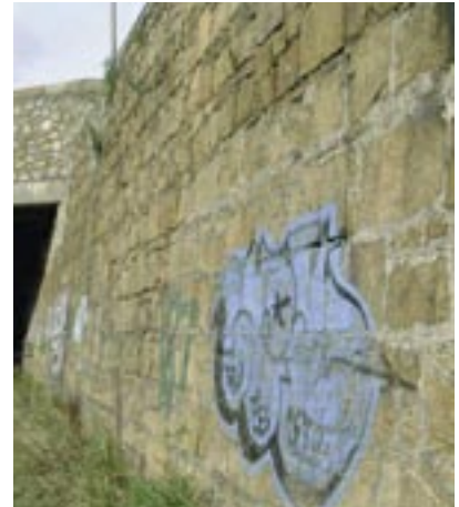
Graffiti to Accommodation Walk walls.