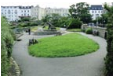
Area of East Pier Gardens to side of 1st kant of East Pier.