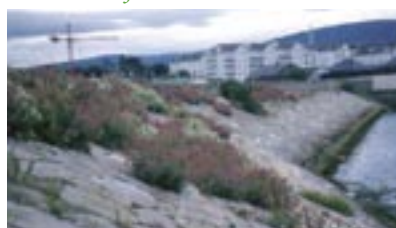
Overgrown breakwater to rear of 3rd and 2nd kants.