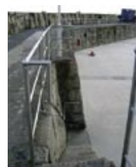
New stainless steel railings.