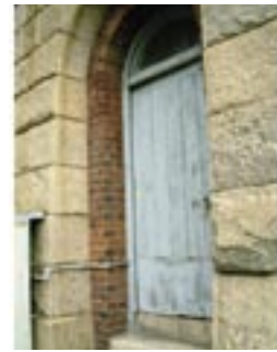
Basement door, F.C.A. building.