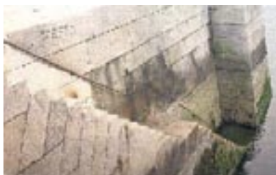
Finely cut granite steps into harbour.