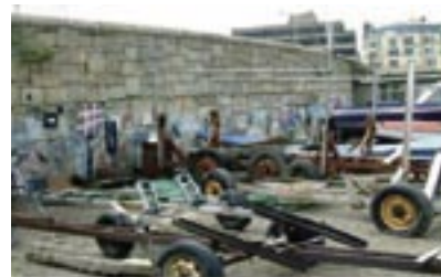
Fine stonework wall, with extensive graffiti.