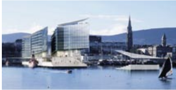
Proposed development with floating stage to foreground.