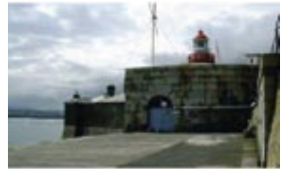
East Pier Battery.