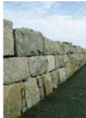
Upper pier wall, 3rd kant, composed of massive, roughly dressed granite blocks.