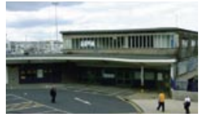
South elevation, ferry terminal, Carlisle Pier.