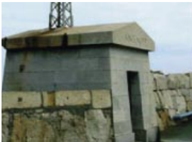
Anemometer showing differing pier walls to either side.