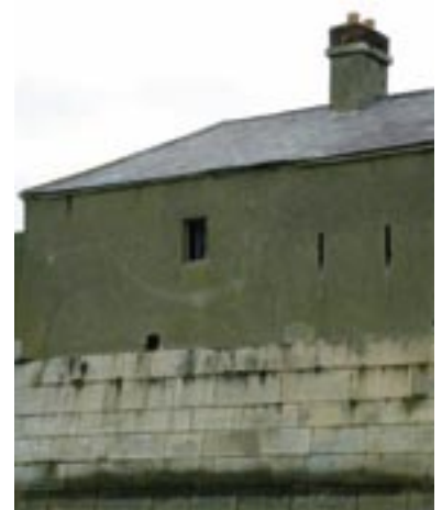
Soldiers' Quarters, elevation to harbour.