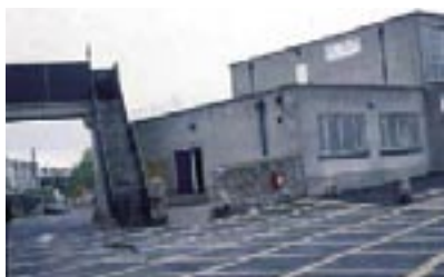
Footbridge and Marine Activity Centre.