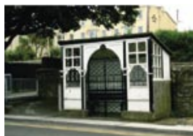
Timber shelter pavilion on Queen's Road.