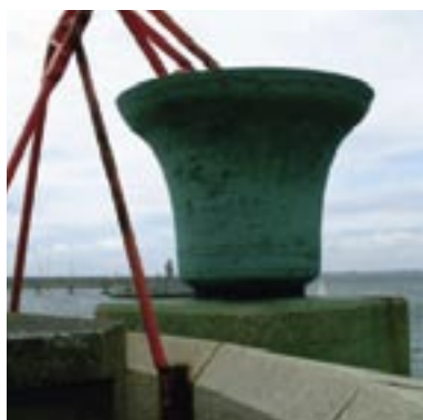
Copper bell on concrete plinth attached to Battery wall and machine room. Relocation is recommended.