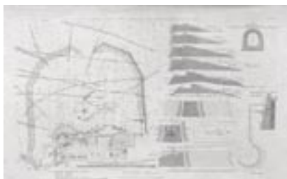
Extract from Sir John Rennie's original drawings and specifications for Dun Laoghaire Harbour.

The first stone of the Harbour was ceremonially laid by Lord Lieutenant Whitworth on 31st of May 1817. A handful of coins and newspapers from the previous ten days were placed in a hole under the stone and this was sealed in turn by a plate with a memorial inscription. Rennie's original scheme provided for a two-piered harbour, but the one first agreed to by Parliament was a single pier to the east of what was later known as the Old Pier. This pier had been built in 1767, but had quickly dried up and was sometimes known as the Dry Pier [now the Coal Harbour]. However during the course of construction it was decided that a second pier to the west should be built and this was constructed according to Rennie's initial scheme. Decisions by Parliament to proceed, and the arrival of money to do so, came in stages and both piers were brought to a penultimate state of construction around the year 1831. There was considerable disquiet after this about how the Harbour mouth should be finished. Rennie's son, Sir John Rennie, who took over the responsibility for the construction of the Harbour after the death in 1821 of his father, believed that the original design, with an opening of 450 ft, should be adhered to. Others, such as William Cubitt suggested an opening considerably larger. Cubitt also proposed that a breakwater of 1200 ft be placed east