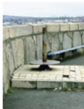
Platform with base of telescope, now redundant. Removal is recommended.