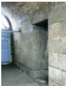
East Pier Battery, Entrance Passage.