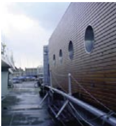
Detail of National Yacht Club extension looking east.