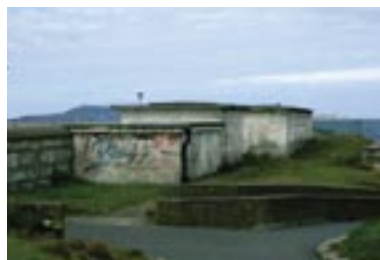
Dilapidated public toilets abutting upper pier wall.