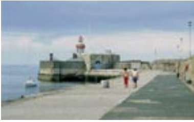
1st kant, General view.