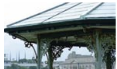
Detail, bandstand. Note rusting iron brackets.