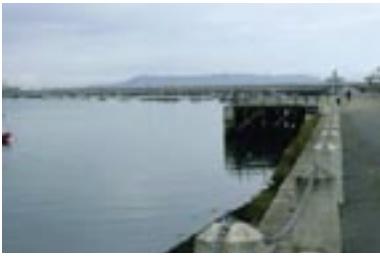
General view from end of 4th kant looking northwards with range of octagonal granite bollards to west.