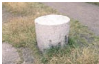
Granite mooring post.