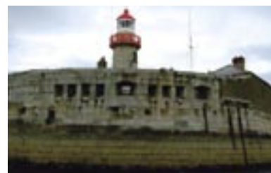
View of Battery from harbour. Note rusted pipes discharging from W.C.s. Internal iron fixings have caused extensive rust staining.

Openings: Square headed door to side of steps. Small window with granite cill and timber casement window to first space, located above steps. Segmental archway with mid twentieth century infill gives access to second space. Blocked up window opening to back wall. Small square headed window openings, with granite cill and fixed casement window to either side of single bay breakfront. Square headed door opening to breakfront.