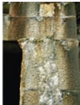
Detail of stonework.