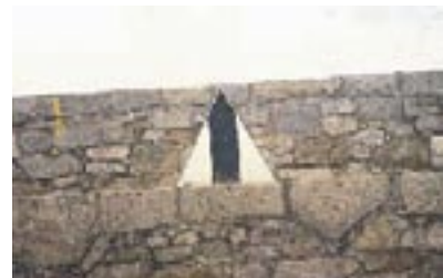
Coursed rubble walls.