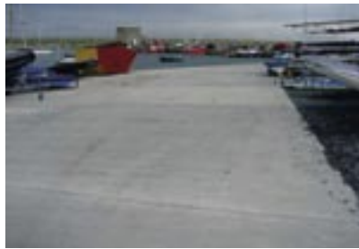
New opening giving access from public slipway to carpark.