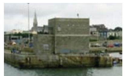
Trader's Wharf, viewed from West Pier.