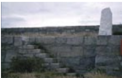
Steps between levels, 3rd kant.