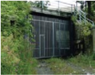
Tunnel entrance near Royal St. George Yacht Club. This area requires maintenance having suffered neglect over the years.