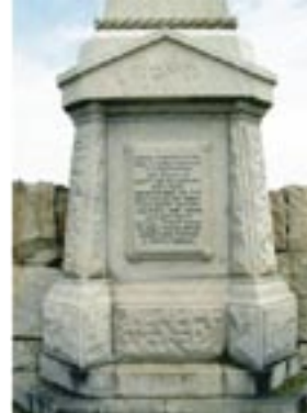
Detail, Boyd Monument, showing high quality of masonry.