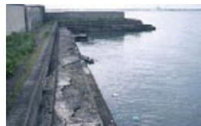
Stepped concrete to south west of West Pier