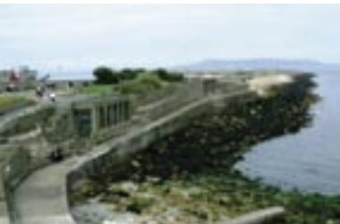
View of East Pier Gardens.