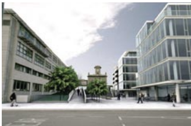
View of scheme from Crofton Road, with the Civic Offices to the left and the Harbour Master's Lodge to the centre background.

General: This complex replaces the Harbour Cottages and the Harbour Company offices and warehouses, previously recorded in 2003 in the Dun Laoghaire Harbour Inventory.