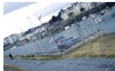
Steel railed boatyard enclosure with concrete plinth.