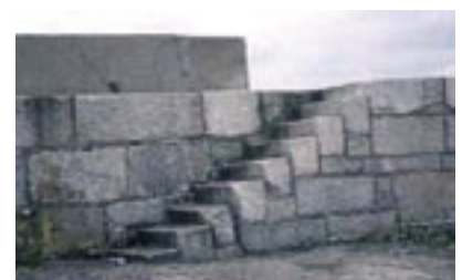
Rear of shelter, abutting pier wall. Note fine flight of granite steps.