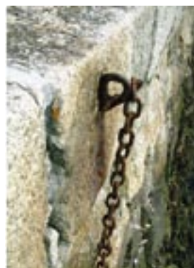
Edge of lower walkway. Note open joints and rusting fixings.