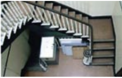
F.C.A. building, staircase.