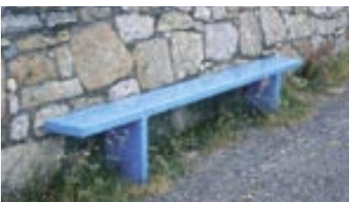
Simple timber bench.