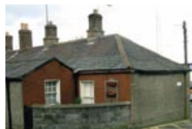
East end of terrace.