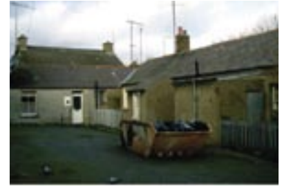
Harbour Cottages, Front Elevations, end of terrace, viewed from east.