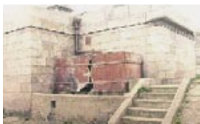
Detail of corroded tank. This corrosion inevitably leads to stone decay. The use of concrete such as for the plinth is inappropriate for an historic structure such as this.

of the area and/or a temporary exhibition space. Consideration of appropriate security provisions would be required.