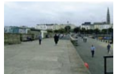
General view of 4th kant looking southwards, showing patchy and inconsistent ground surface. A coherent ground surface plan is required along the entirety of the pier, taking care to preserve the fine stone edging.