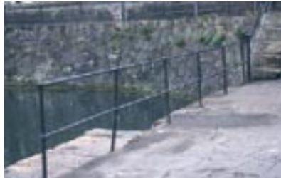
Fine masonry steps contrasting with inconsistent and unsympathetic tarmac and concrete pavier surfaces.