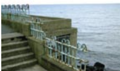
Pavilion No. 2, detail wrought iron railings.