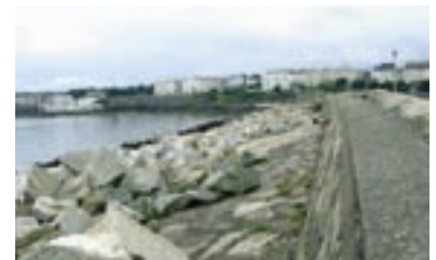
Exposed rock armour to breakwater of 4th kant. Note extensive use of concrete and vegetation growth to open joints.