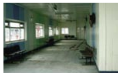
Waiting area of ferry terminal, first floor east.