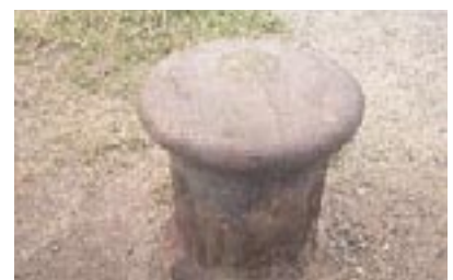
Cast iron mooring post.