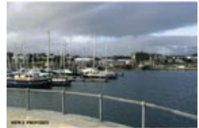
C.I.L. development, viewed from east.