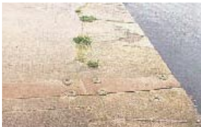
5th kant, granite pier edging.