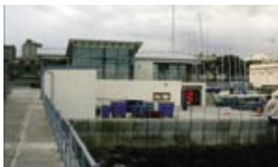
Pathway to breakwater.