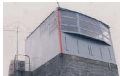
Weather Station Anemometer

• Regular maintenance required including painting and rendering of concrete blockwork base.