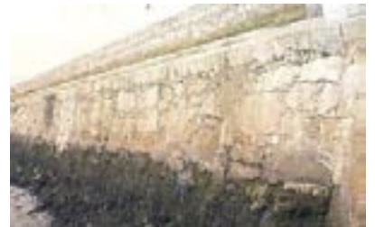
Slightly ramped pier wall composed of random rubble.