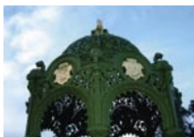
Details of ironwork to Victoria Fountain.