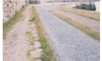
Ground surface, 5th kant. Note granite edge pathway.