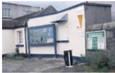
Pleasant seating area, 1st kant, could be improved by resurfacing, removal of graffiti and maintenance of seating.