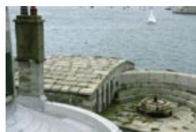
View of Artillery Store and gun position. Note extensive vegetation growth to joints.