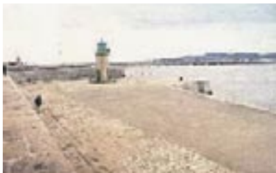
6th Kant, note fine granite paving.

O (Other – Craftsmanship of masonry work)