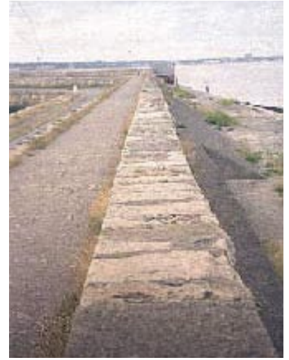
View of 5th kant showing corner with 4th kant. The ground surface of upper and lower walkways is patchy and uneven with extensive vegetation growth.