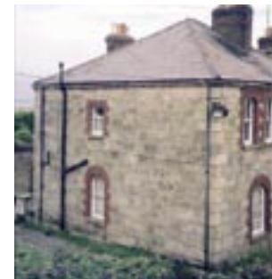
Coastguard cottages, south elevation.