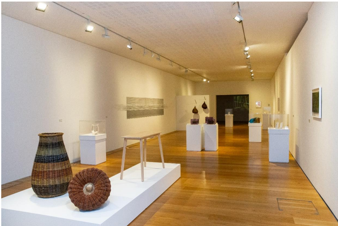
From the exhibition TAKING TIME: An Appreciation of Irish Craft , 2019