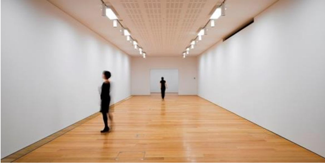
View of Gallery 1, leading to Gallery 2, from main door