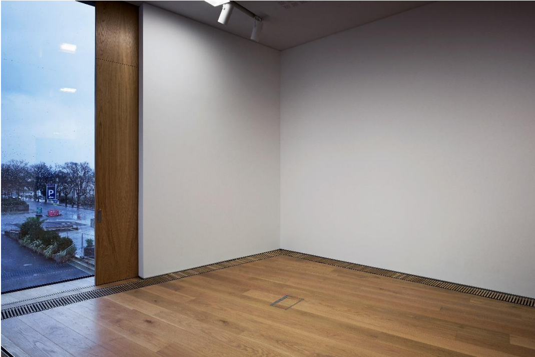
Gallery 2, showing timber screen which can cover window