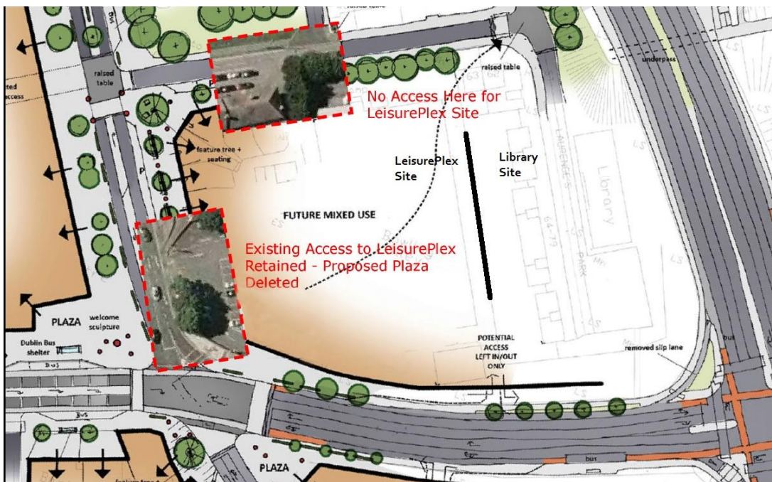
Figure 2. Graphic showing the effects of the Material Alteration (for illustration purposes only)