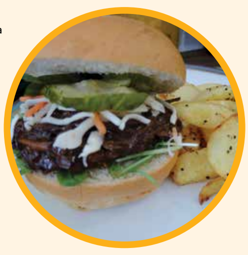
Chef's Tip You can also serve this dish with leftover salads.

Serve on your favourite bread with some toppings and sides of your choice. We have used brioche baps and some pickles made with excess cucumbers and slaw. We plated this with some home fries made with excess potatoes, tossed in olive oil salt and pepper and roasted in the oven until crispy.