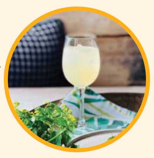
Chefa Tip This is the perfect drink to pair with the Burnt Bread Dip

Serve diluted with sparkling water, and apple peels to garnish.