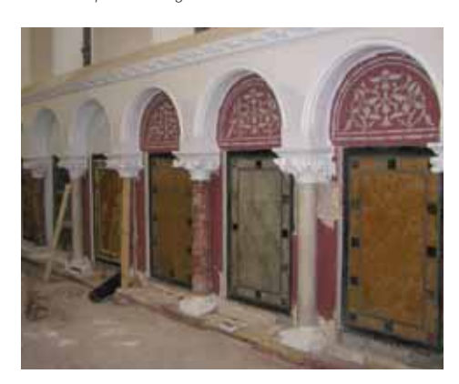
In this example, the original decorative paint scheme is being recreated based on detailed evidence