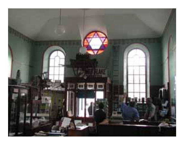
The conversion of a redundant church to a socially-inclusive function is often a good way of retaining its central importance to the community as with this example of a former Presbyterian church which now houses a museum