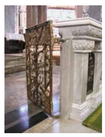
Internal fixtures such as box pews, confessional boxes and altar rails can be significant elements of the character of the place of public worship