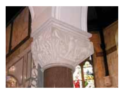
Places of public worship are often repositories of works of art such as painting and sculpture which continue to be added to by each generation as with this newly carved capital in Loughrea Cathedral