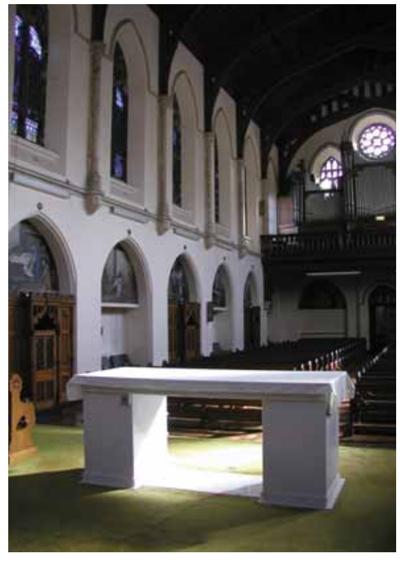
The adaptation of places of public worship may be sought to reflect revisions in liturgical requirements