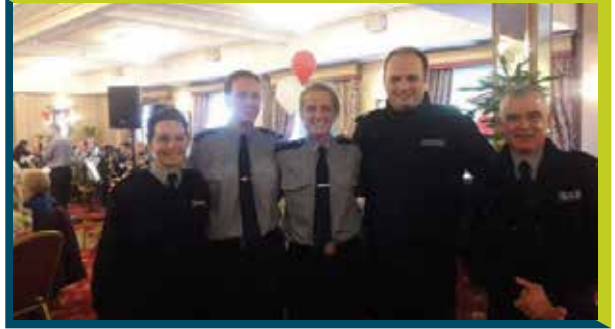
GOPA Valentines Tea Party

Garda Older Persons Association enjoyed a performance of the Garda Band at their Valentine's Day Tea Party at the Killiney Castle Hotel.