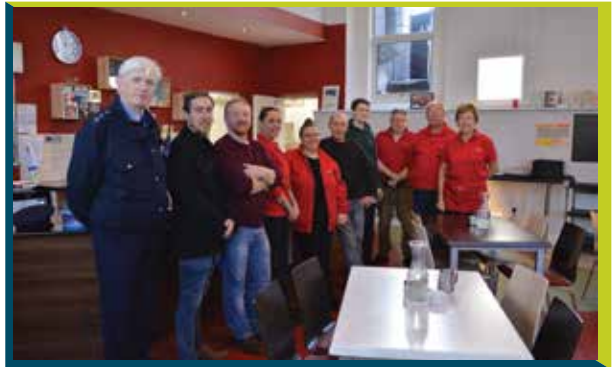
Crosscare Community Café in Central Dún Laoghaire

Dún Laoghaire's Community Café opened in 2016 and was identified as a priority action at the Dún Laoghaire Local Policing Forum. The Community Café provides a welcoming space, hot food and companionship for the people of our community that find themselves in need of support.