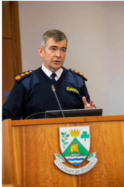
Commissioner Harris at the February JPC meeting

At the February meeting Commissioner Drew Harris presented the new Garda Operating Model and outlined how it will impact on policing policy generally, front-line community policing, administration and criminal investigation in relation to the DMR East Division. He also discussed how to keep people safe from Cyber Crime, Trafficking/Slavery, Domestic Violence and Sexual Assault. The Commissioner also responded to questions from the floor on issues pertinent to the DLR County area.