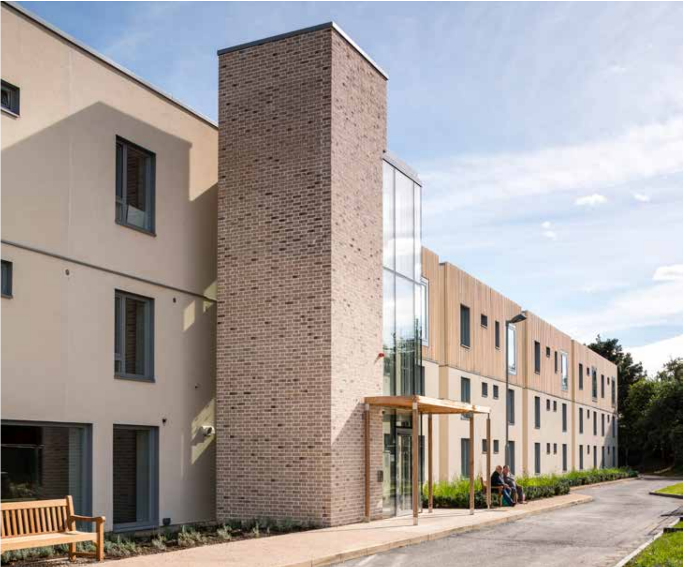
Rochestown House, Sallynoggin, Phase 2, awarded the Best Sustainable Building Project in the RIAI Awards 2017.