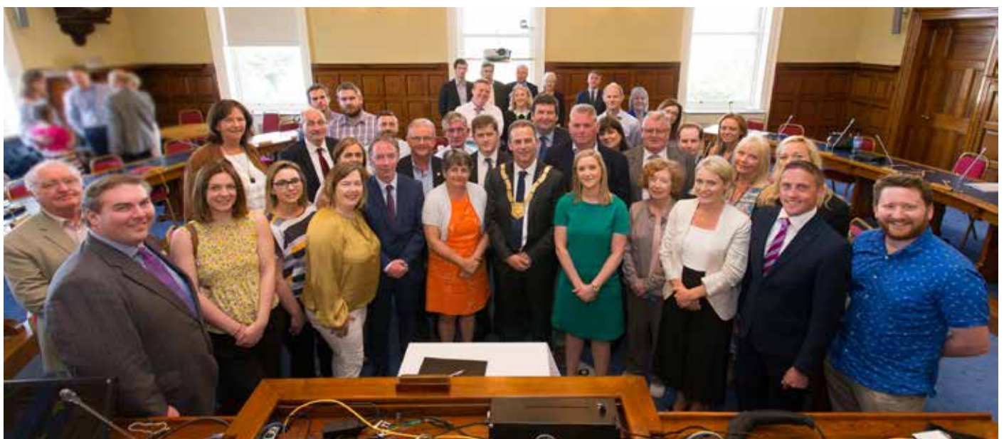
Members of Dún Laoghaire-Rathdown County Council - June 2017