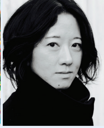
clann