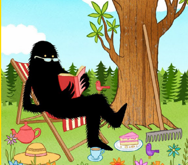
The Lonely Beast