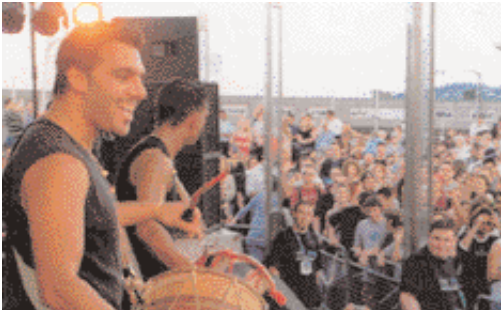
Photo: Our Lady of the Wayside School, Kiltiernan.