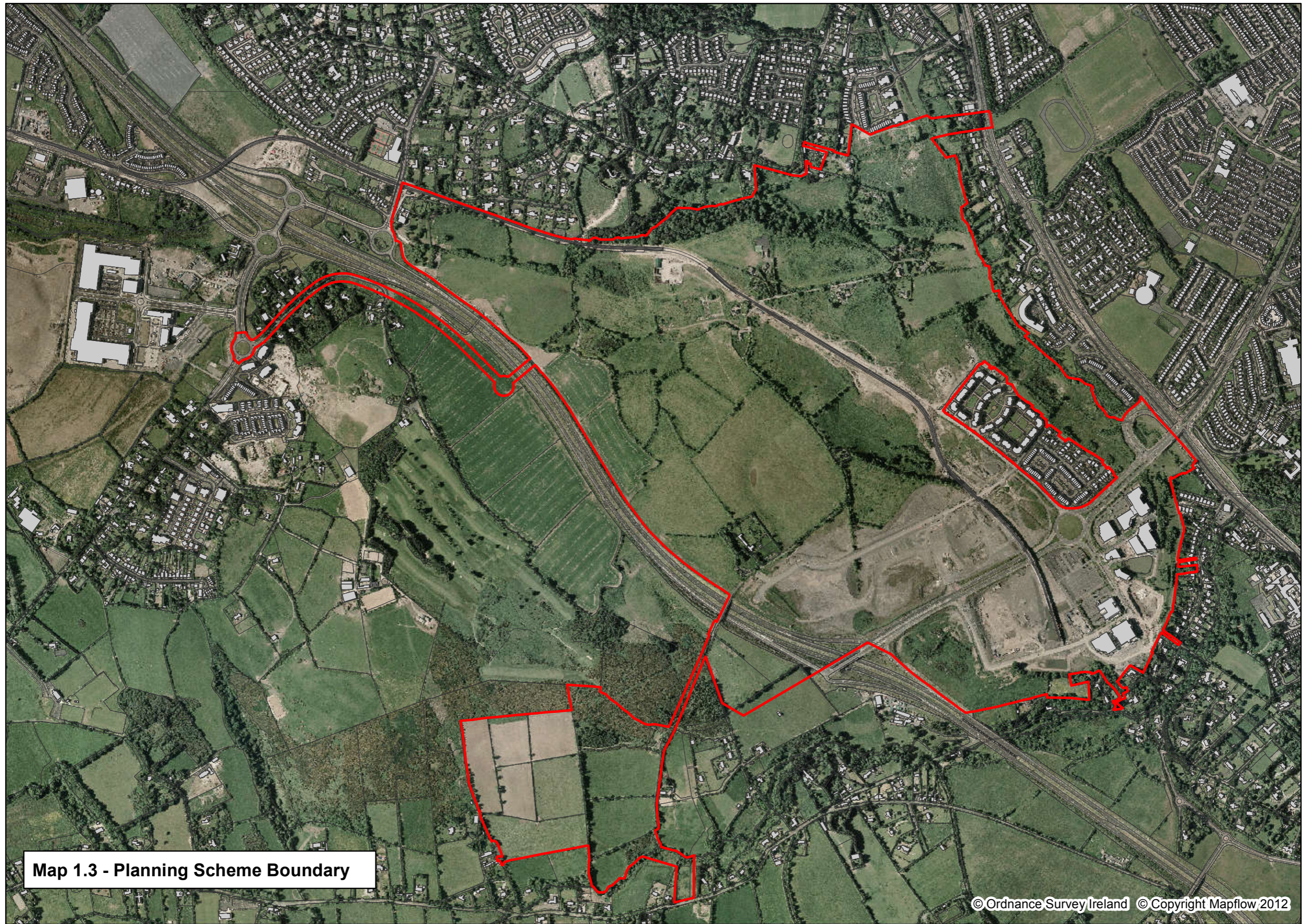
Map 1.3 - Planning Scheme Boundary