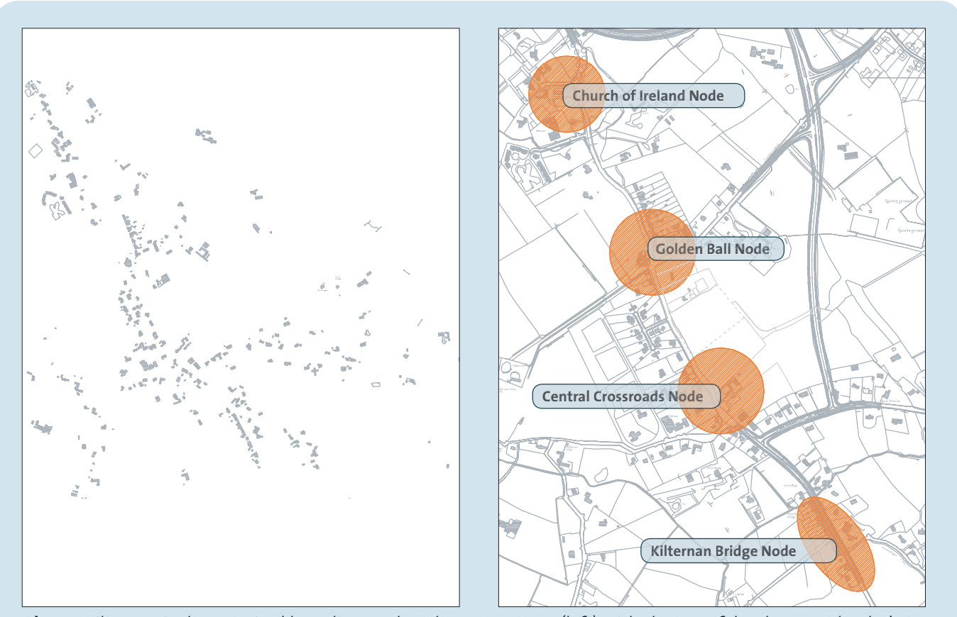
Above: Kilternan is characterised by a dispersed settlement pattern (left) with clusters of development 'nodes' at certain points along the road (right).

The Historic Landscape Character Assessment carried out by DIT (2004) also describes this settlement pattern identifying clusters of development 'nodes' at certain points along the road. The nodes that it identifies which are of significance to this Neighbourhood Framework Plan include the Church of Ireland Node, the Golden Ball Node, and the nodes at the intersection of Ballybetagh and Ballycorus Roads.