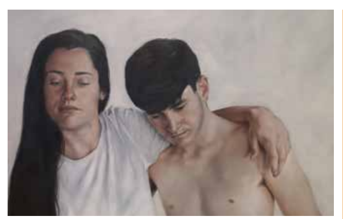
Two Friends, 2019 by Siobhán O'Callaghan