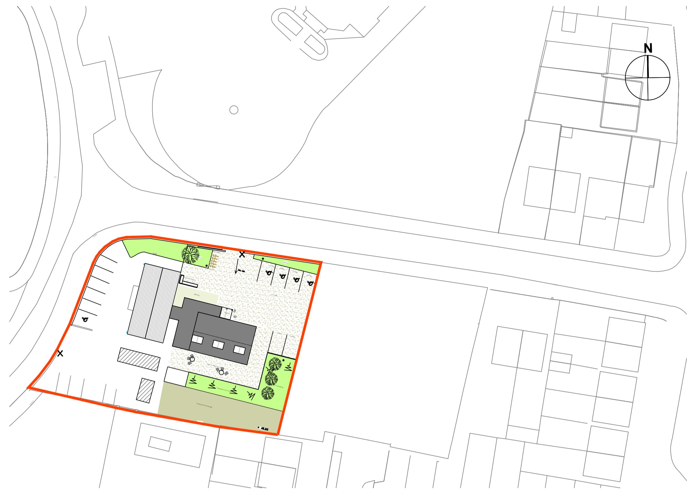
PROPOSED SITE PLAN 1:500 SITE OUTLINED IN RED