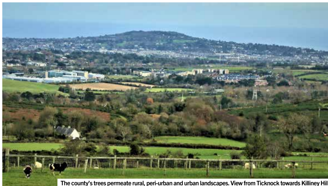
The county's trees permeate rural, peri-urban and urban landscapes. View from Ticknock towards Killiney Hill.

dlr Parks and Landscape Services is preparing a new strategy for the county's trees, A Climate for Trees: Human Well-being and Nature is focus on connecting people to nature in a climate-resilient county, in line with the council's commitments to Climate Action, Quality of Life and Sustainable Placemaking. The current and draft County Development Plans include an objective "to ensure that the tree cover in the County is managed and developed to optimise the environmental, climatic and educational benefits which derive from an 'urban forest'."