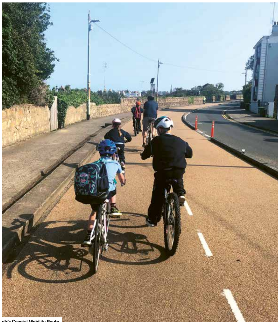
dlr's Coastal Mobility Route

In the last year there has been significant development in active travel facilities in many of our local areas. These include new and enhanced cycle routes on and adjacent to roads as well as new and widened walking and cycle paths in our many local parks.