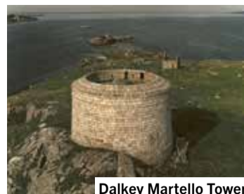
Dalkey Martello Tower