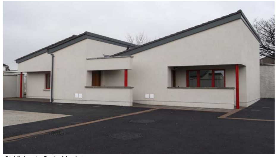
St. Michael's Park, Monkstown