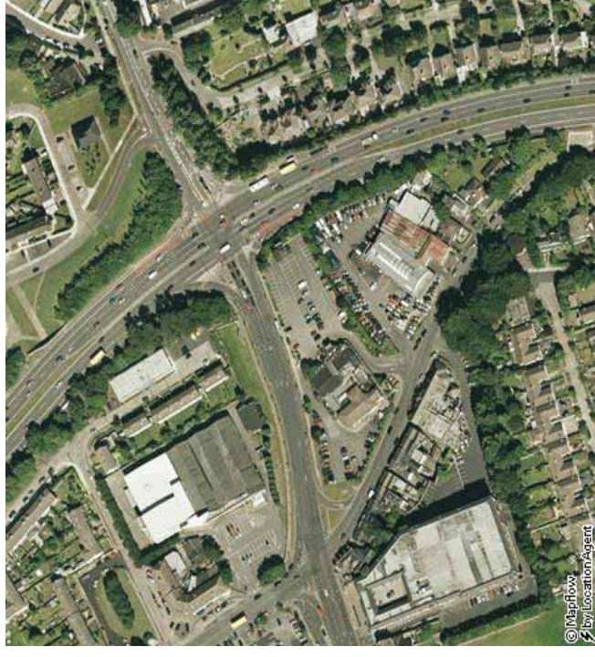
Photo 5.3. Kilmacud Rd Lower/N11 & Kilmacud Rd Lower/Old Dub Rd./The Hill'

The existing layout provides inadequate passive surveillance of the public realm resulting in its poor quality and maintenance. This is reflected in the degraded footpath surface treatments and the fact that there is little, inadequate or dated street furniture, public art, passive recreational areas, lighting and landscaping (Photos 5.1 & 5.2). The existing urban form and development, therefore, provides little cohesion or sense of place. The area is deficient in passive recreational public space. There is no collective architectural form or strong identity and the existing road network creates a barrier, restricting the permeation of pedestrians throughout the area.