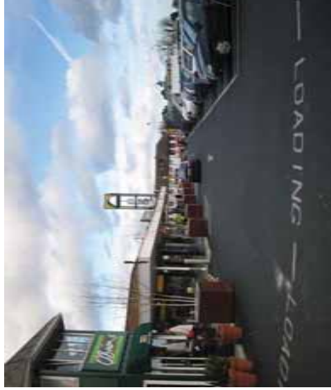
Photo 5.1. Stillorgan Shopping Centre