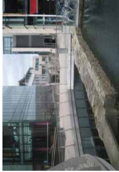
Photo 5.4. Dundrum Town Centre: An example of high quality architecture with building frontage interest.