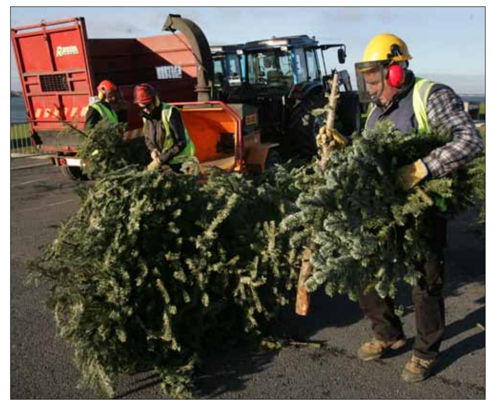
Council staff operating the Christmas Tree Recycling service last January at the West Pier Car Park, Dún Laoghaire.

Christmas Tree Recycling will take place from Tuesday January 3rd – Sunday January 15th 2012 inclusive between 9.30am and 3:30pm at Cabinteely Park Car Park; Killiney Hill Car Park; Grange Road Car Park (Marlay Park); Shanganagh Recycling Centre Car Park; Blackrock Park Main Entrance; Mount Anville Parks Depot, Goatstown; West Pier Car Park, Dún Laoghaire.