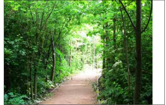
Above: Marlay Park

business support for start-ups, attraction of Foreign Direct Investment, growth of the existing SME sector and securing the vitality and viability of retail centres throughout the County are given particular focus. The importance of Third Level Institutions to the economy of Dún Laoghaire-Rathdown is also recognised and these have been afforded a distinct zoning in the Draft Plan.