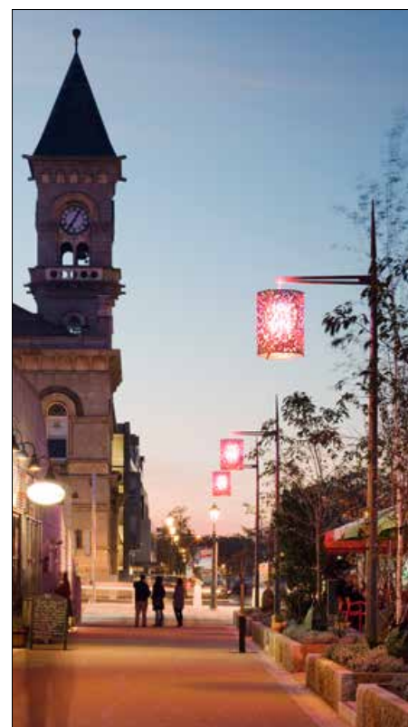
Above: County Hall, Dún Laoghaire

The Planning process is an open and public one. In that context, all submission documents are made available for public inspection. This information may also be placed on the Council’s website.