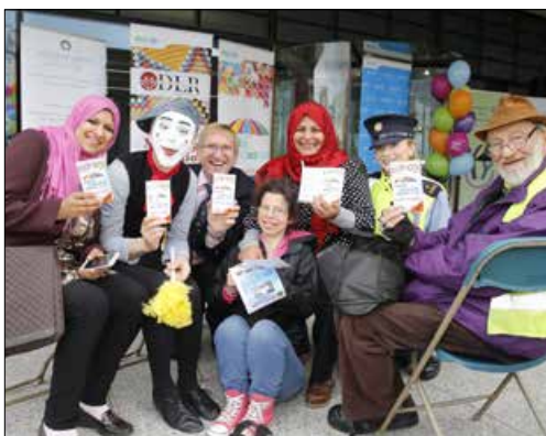
Above: Launch of Social Inclusion Week 2014.

The Draft Plan will continue to promote social inclusion and community development throughout the County. The Draft Plan incorporates policies which fully support the ongoing improvement in the provision of Community Facilities, Education, Childcare, Arts and Culture and will facilitate and complement the implementation of the forthcoming Local Economic and Community Plan - which is currently being prepared under separate legislation for the County.