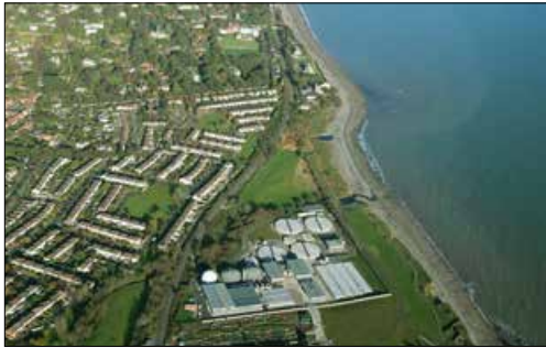
Above: Shanganagh Wastewater Treatment Plant

The Draft Plan highlights the current water and wastewater infrastructural shortcomings in the south of the County and the importance of continuing to work with Irish Water to address these issues, and so enable the full development potential of the County to be realised. The Draft Plan seeks to promote Dún Laoghaire-Rathdown as a carbon-neutral County by encouraging resource preservation, energy efficiency and the application of considered climate change mitigation policies for the duration of this Plan and beyond.