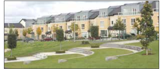
Above: Honeypark Estate, Dún Laoghaire

Development and redevelopment within the County during the lifetime of the Plan will be required to be carried out to a high standard and adhere to the principles underpinning good urban design. The Draft Plan incorporates appropriate urban design policies, development management standards and land-use zoning objectives which will ensure that future development in the County delivers in terms of quality place-making and public realm.