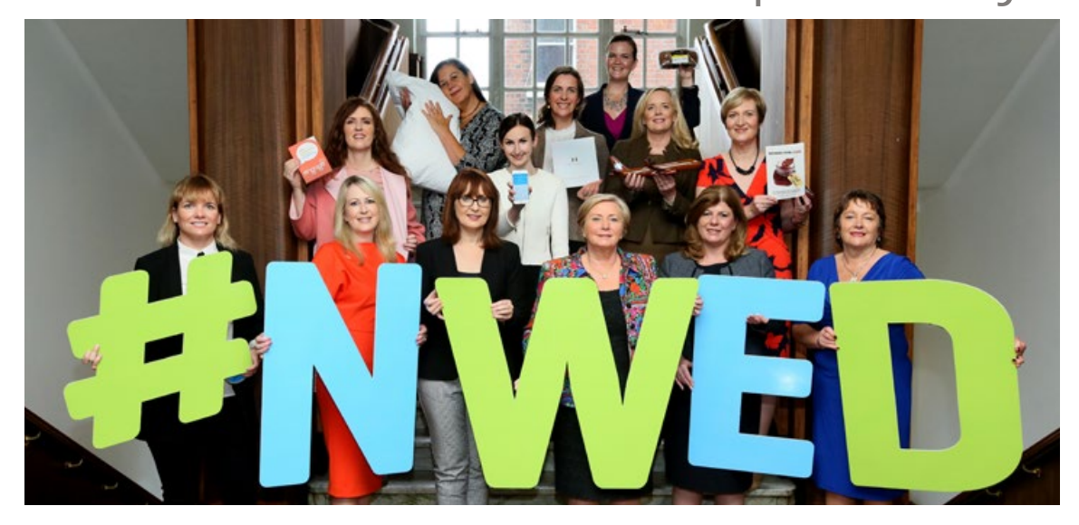
Open Doors to New Markets - Join us on 12 October for National Women's Enterprise Day Dublin.

The Local Enterprise Offices in Dublin have teamed up once again this year to organise National Women's Enterprise Day. This exciting event, which will highlight the success of female entrepreneurs in Ireland, is an annual initiative of the Local Enterprise Offices with support from Enterprise Ireland and the Local Authorities Network.