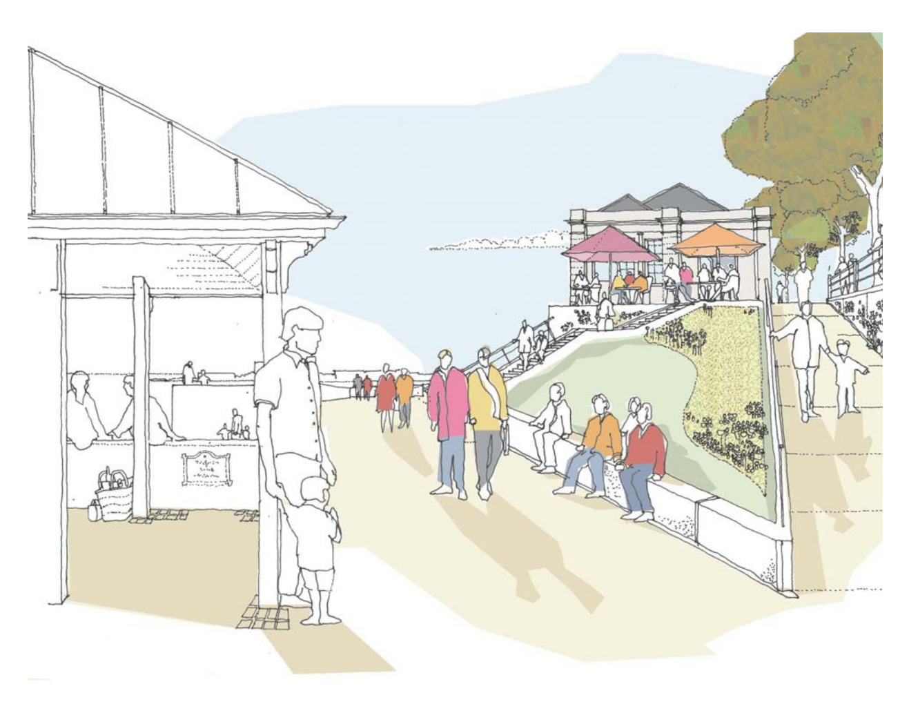
Figure 3. Views of the restored bandstand new route to connect the East Pier with Newtownsmith and 'café terrace'.