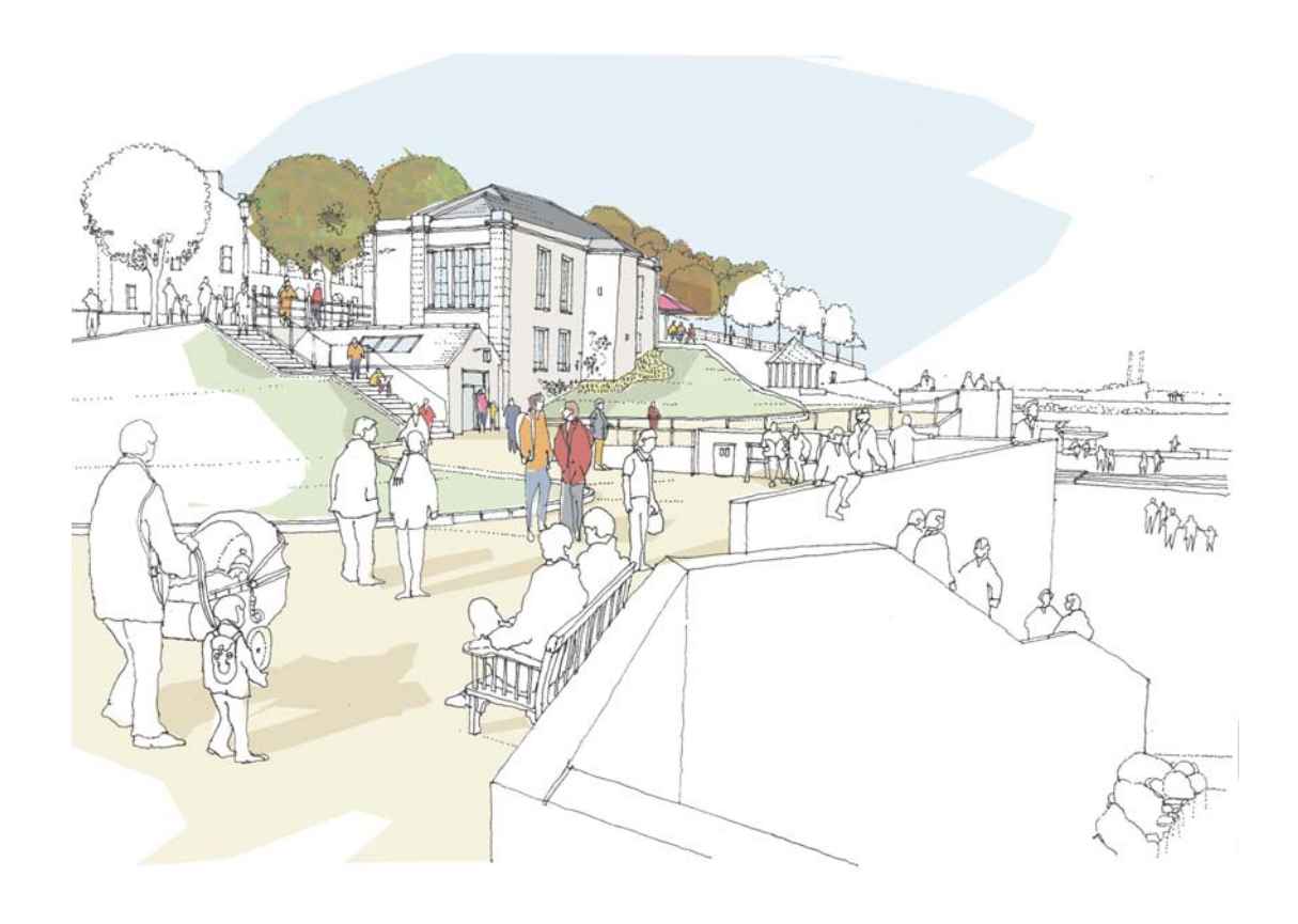
Figure 2. Views of the new route to connect the East Pier with Newtownsmith.