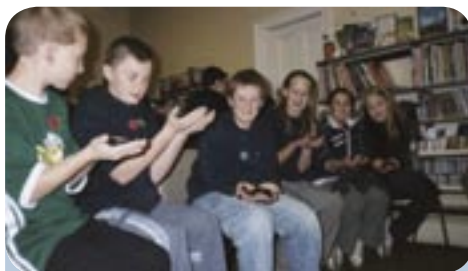
ABOVE: Handling giant millipedes at the Big Bug Show in Shankill Library