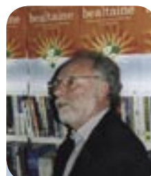
ABOVE: Author Brian Keenan in Cabinteely Library