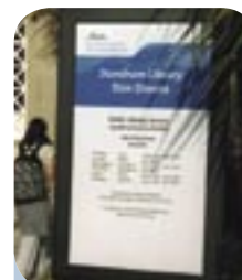
ABOVE: New signage at Dundrum