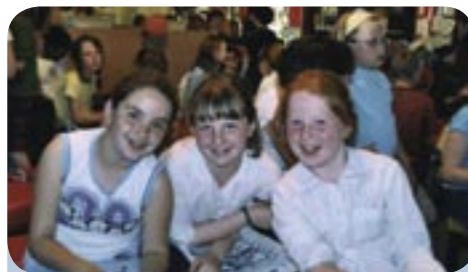
ABOVE: Enjoying the Harry Potter quiz in Deansgrange Library in June