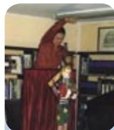
ABOVE: The Pavaly Company performing for the International Puppet Festival in September