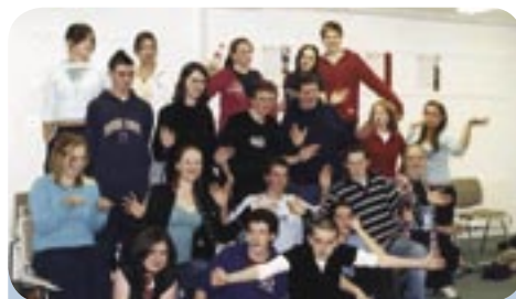
ABOVE: Fifth annual Transition Year Literary Project in Deansgrange Library