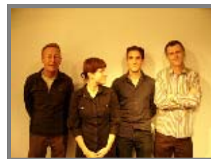
Beginning to End