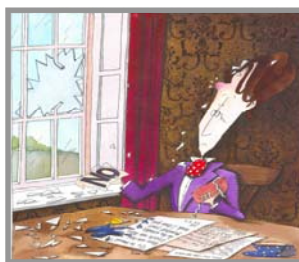
Yeats receives an answer to his second marriage proposal

This humorous exhibition is based on WB Yeats and his trials and tribulations.