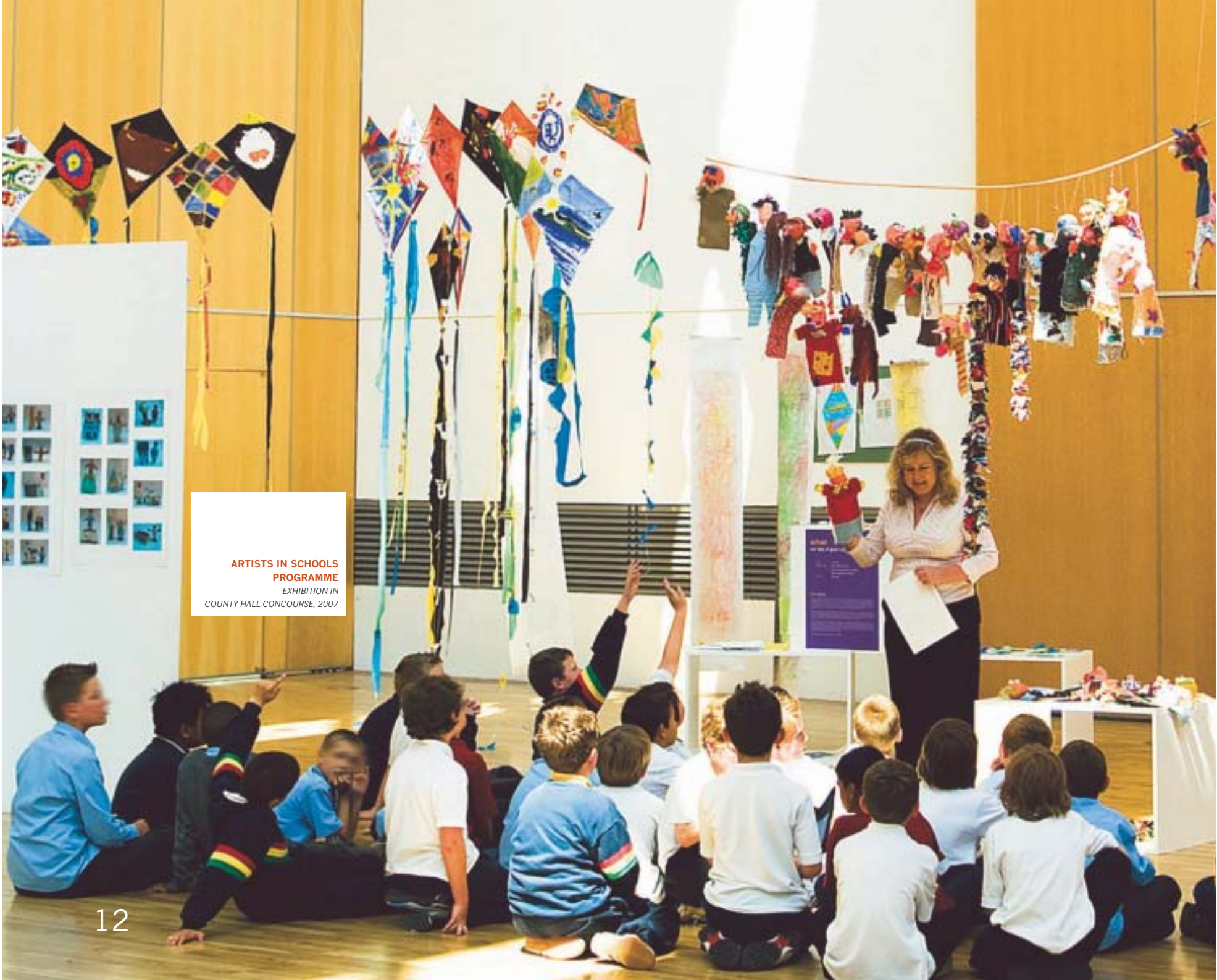
ARTISTS IN SCHOOLS PROGRAMME EXHIBITION IN COUNTY HALL CONCOURSE, 2007