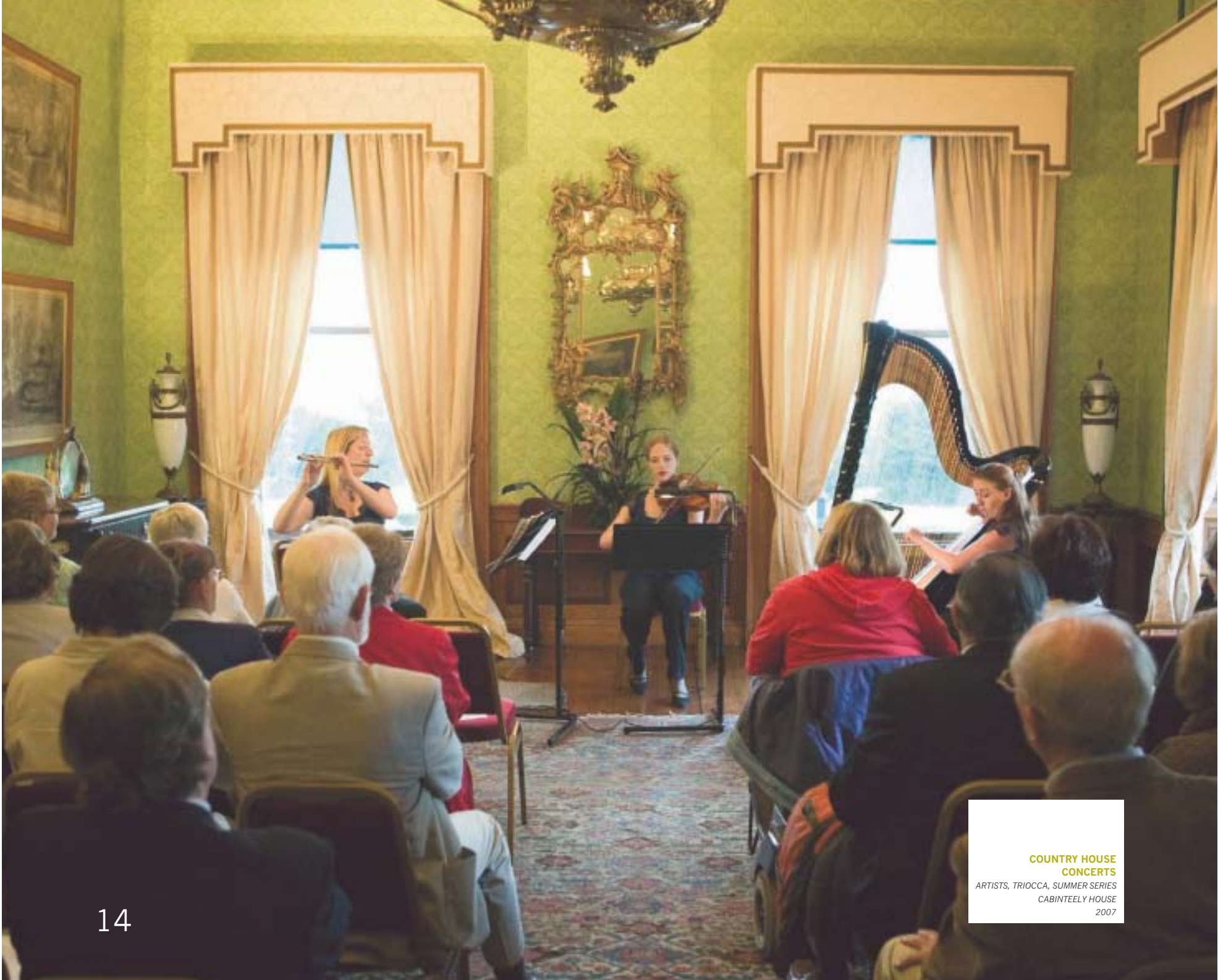
COUNTRY HOUSE CONCERTS ARTISTS, TRIOCCA, SUMMER SERIES CABINTEELY HOUSE 2007